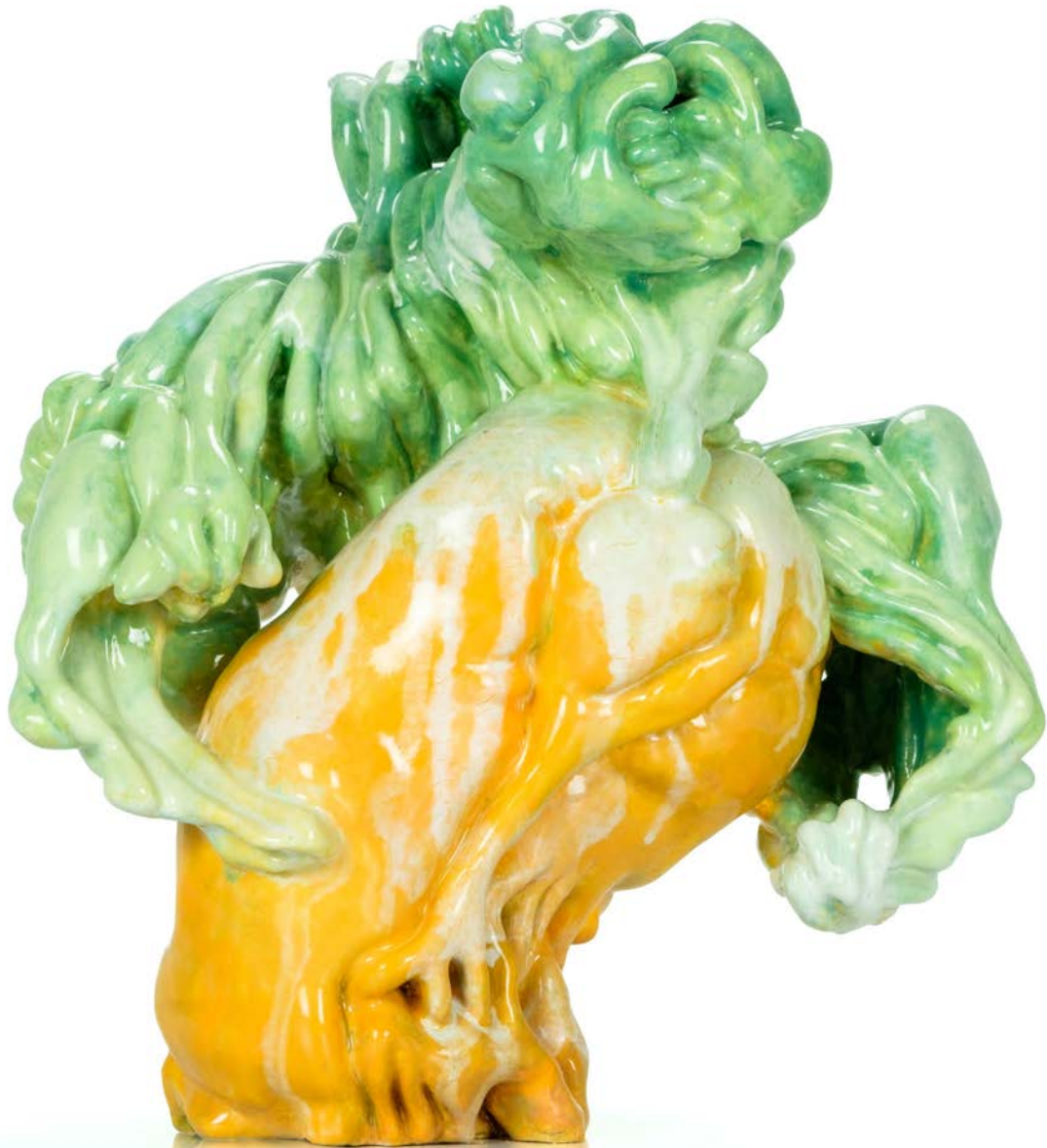
COREWOLI, 2016 - 2018 ceramic 31 x 25 x 28 cm 12.2 x 9.8 x 11 inches