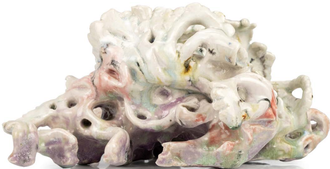
CROBOSLIVO, 2022 ceramic 11 x 18,5 x 21,5 cm 4.3 x 7.3 x 8.5 inches