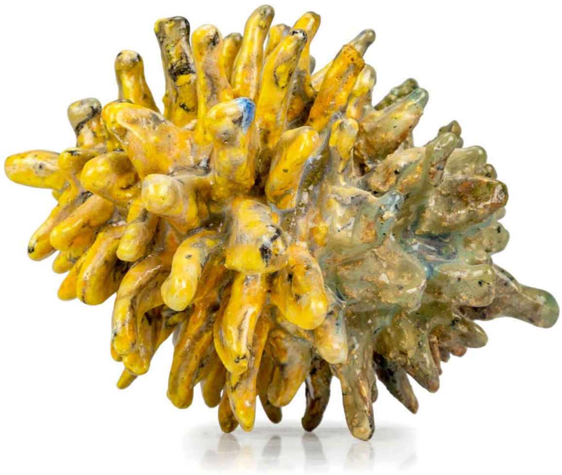
PINUOSIOR, 2023 ceramic 15,7 x 20,5 x 16 cm 6 x 8 x 6.3 inches