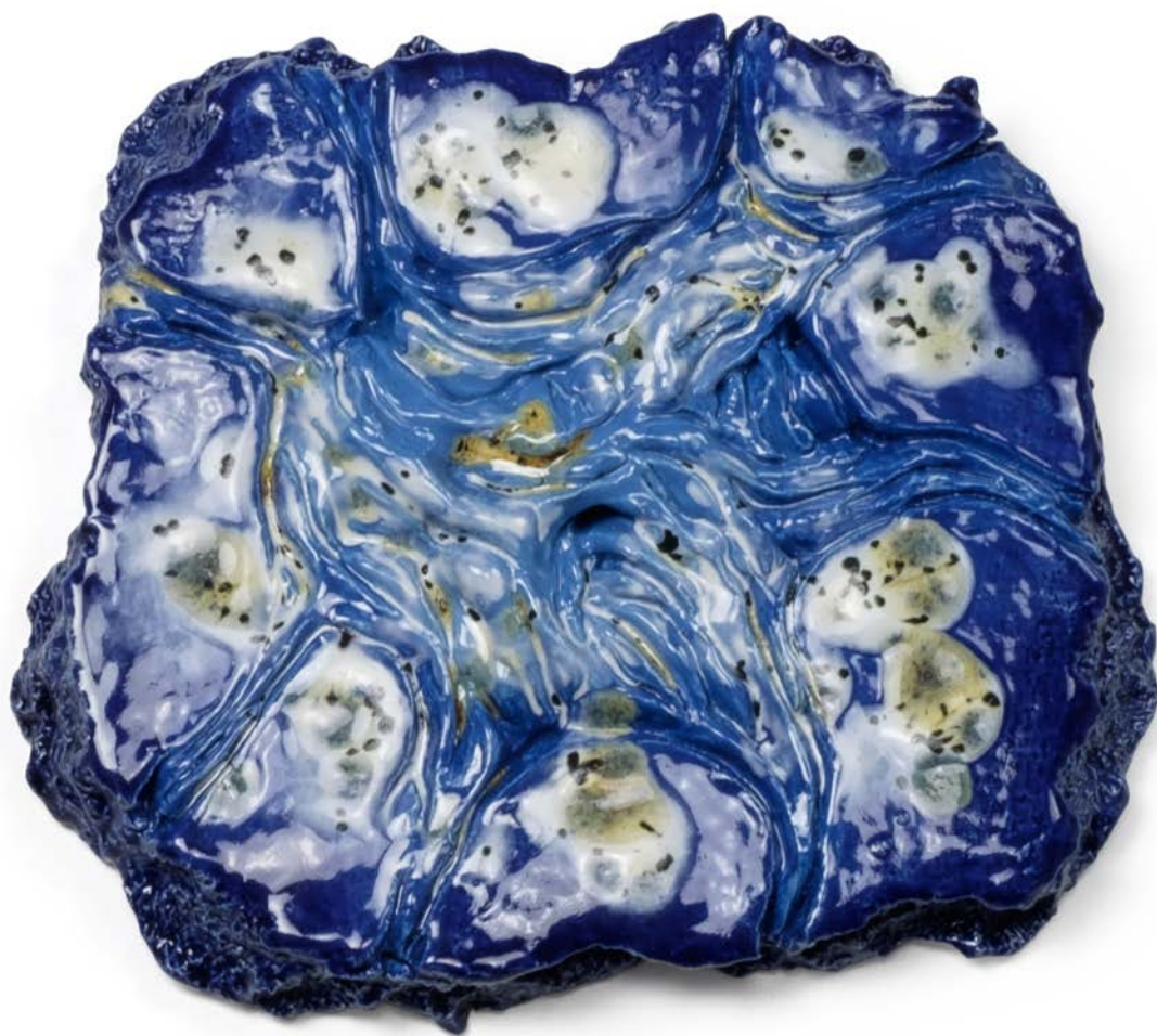
KINOBLAZOK , 2018 ceramic 18 x 16 x 2.5 cm 7.1 x 6.3 x 1 inches