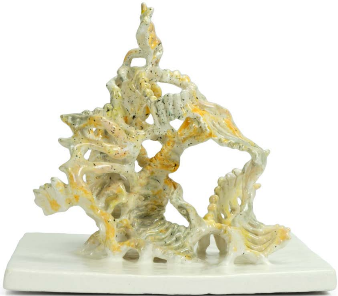
MINOTERCERIS , 2017 ceramic 25 x 21.5 x 22 cm 9.8 x 8.5 x 8.7 inches