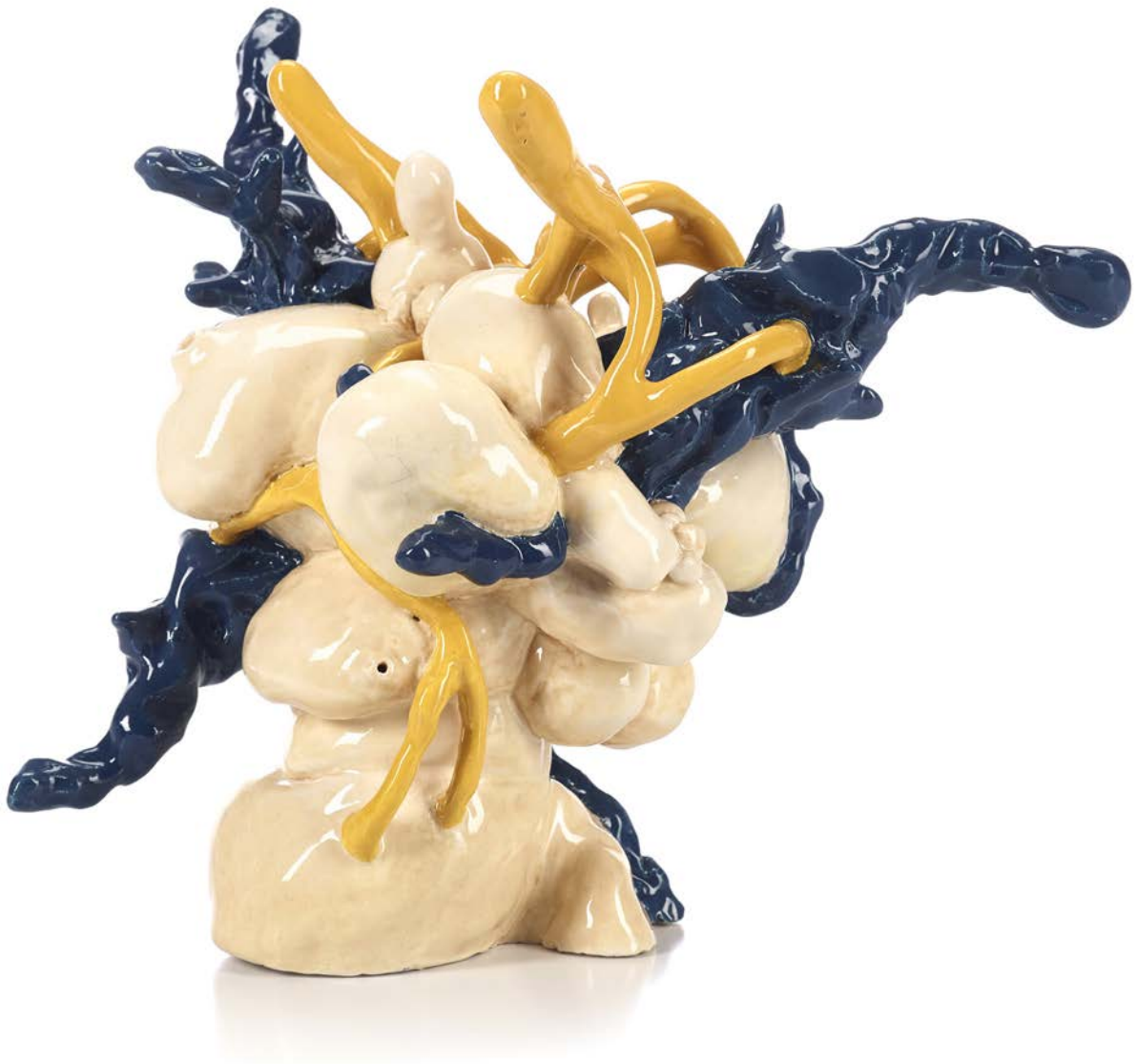
TSAEBTID , 2016 ceramic 22.5 x 25.5 x 20.5 cm 8.9 x 10 x 8.1 inches