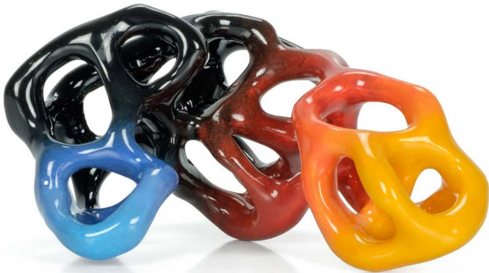
TIEKALDERUM, 2016 ceramic 10 x 20 x 15 cm 3.9 x 7.9 x 5.9 inches