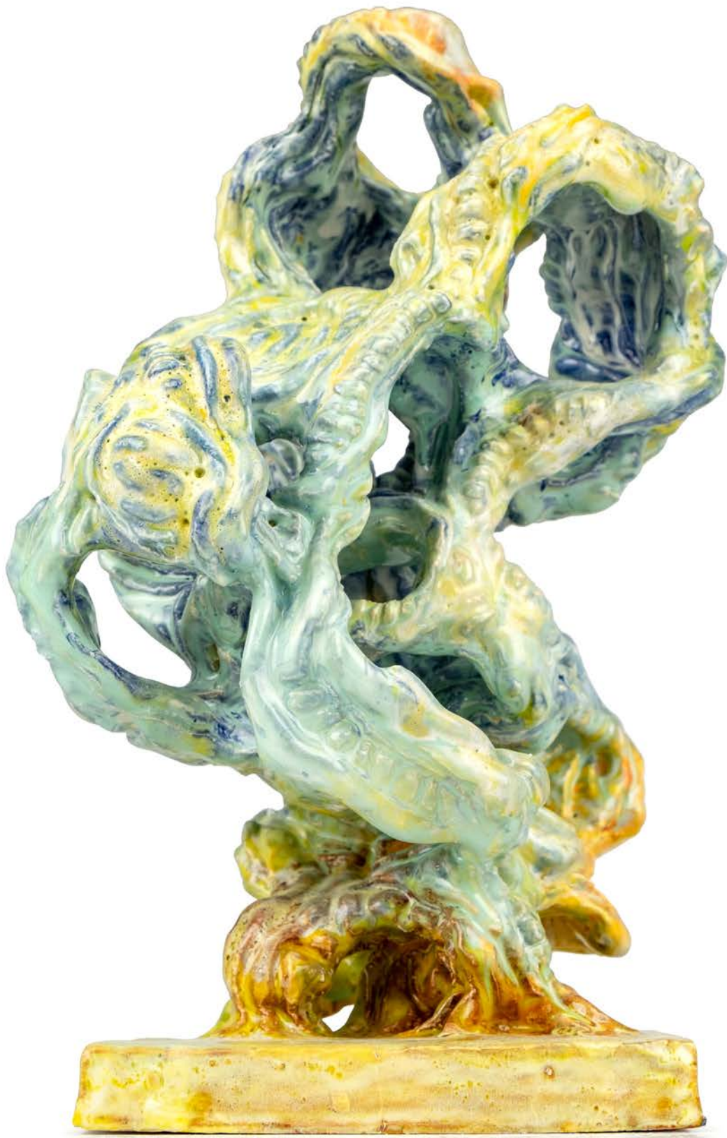
MINOTERIOM, 2023 ceramic 26,5 x 16,5 x 17 cm 10.4 x 6.5 x 6.7 inches