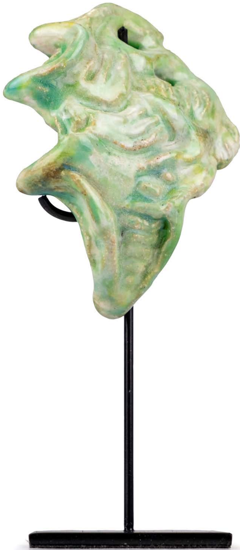
WIGNIROAS, 2022 ceramic 3,5 x 9 x 7 cm 1.4 x 3.5 x 2.7 inches