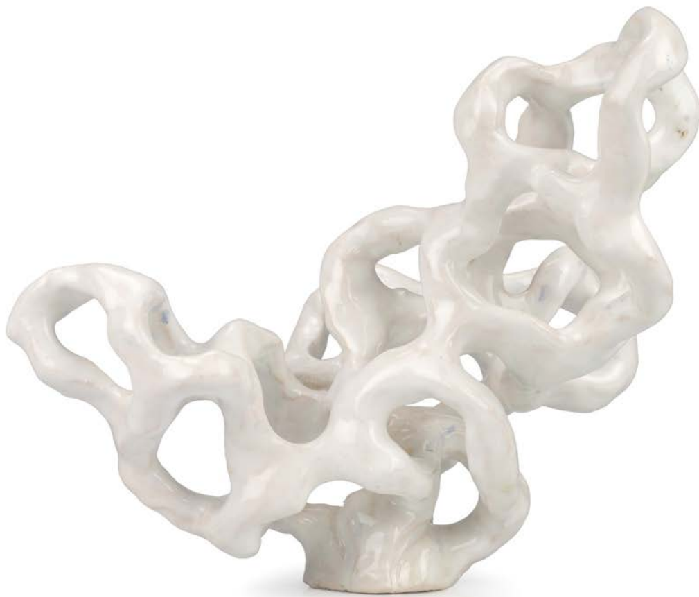
LEGULEARI, 2022 ceramic 16,5 x 19,5 x 15 cm 6.5 x 7.7 x 5.9 inches