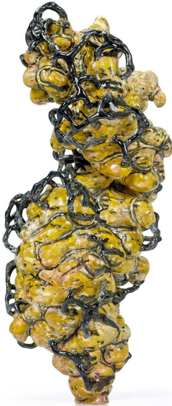
ELCTANET, 2017 ceramic 61 x 30 x 30 cm 24 x 11.8 x 11.8 inches