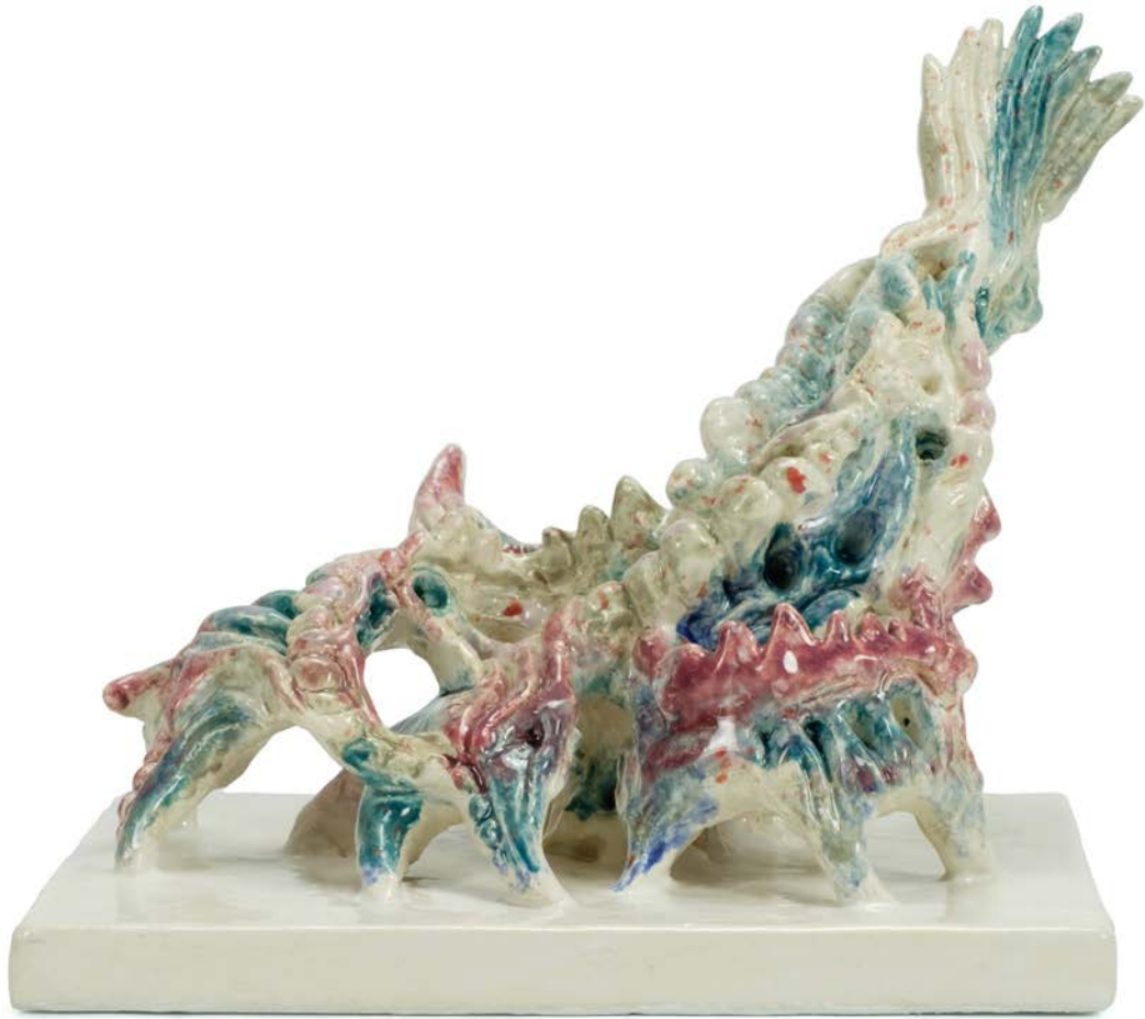
MINOTERKS, 2017 ceramic 19 x 13.5 x 16 cm 7.5 x 5.3 x 6.3 inches