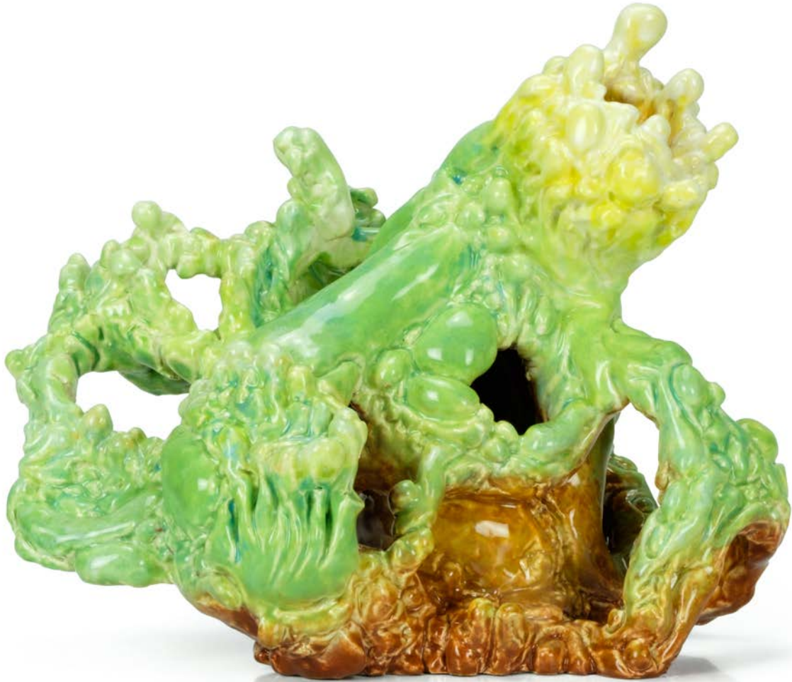
CROBOSLOEM , 2017 - 2018 ceramic 20 x 25 x 23 cm 7.9 x 9.8 x 9.1 inches