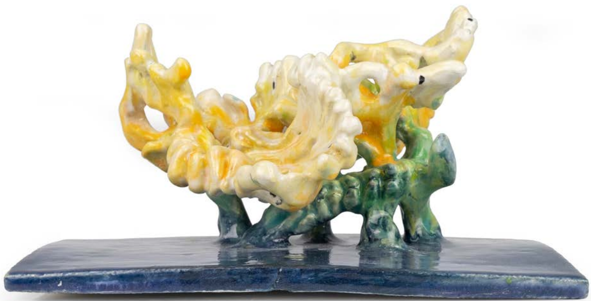
MINOTERSERU, 2022 ceramic 11,5 x 21 x 16,5 cm 4.5 x 8.3 x 6.5 inches