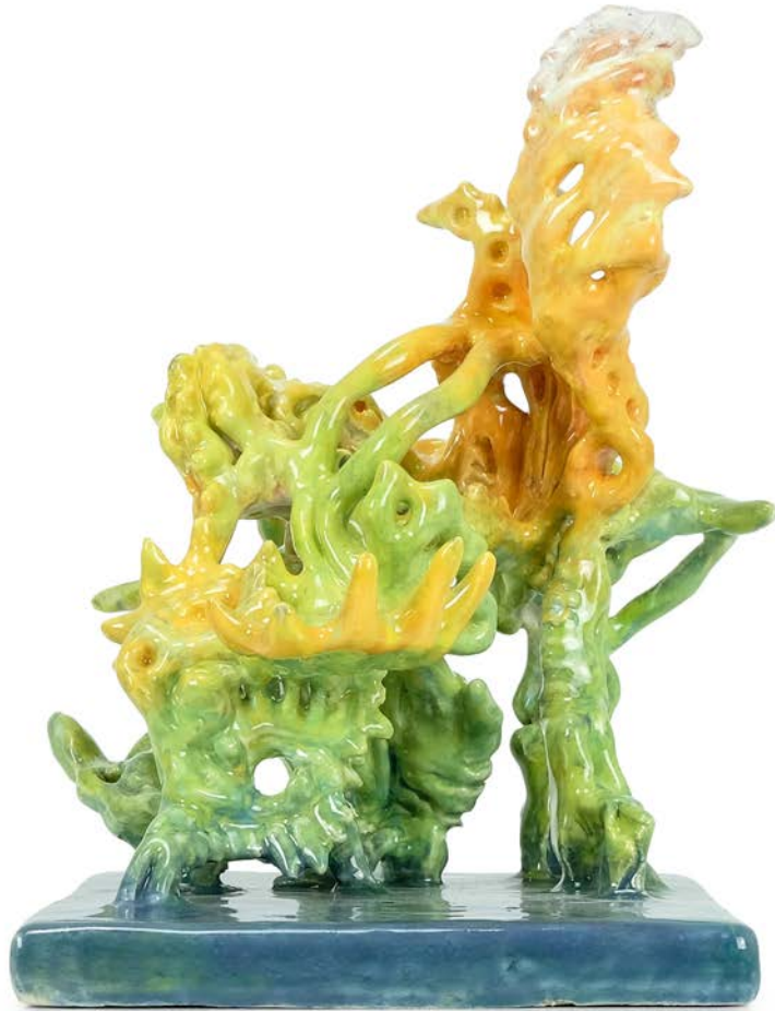
MINOTERCERIK, 2017 ceramic 21 x 20 x 16 cm 8.3 x 7.9 x 6.3 inches