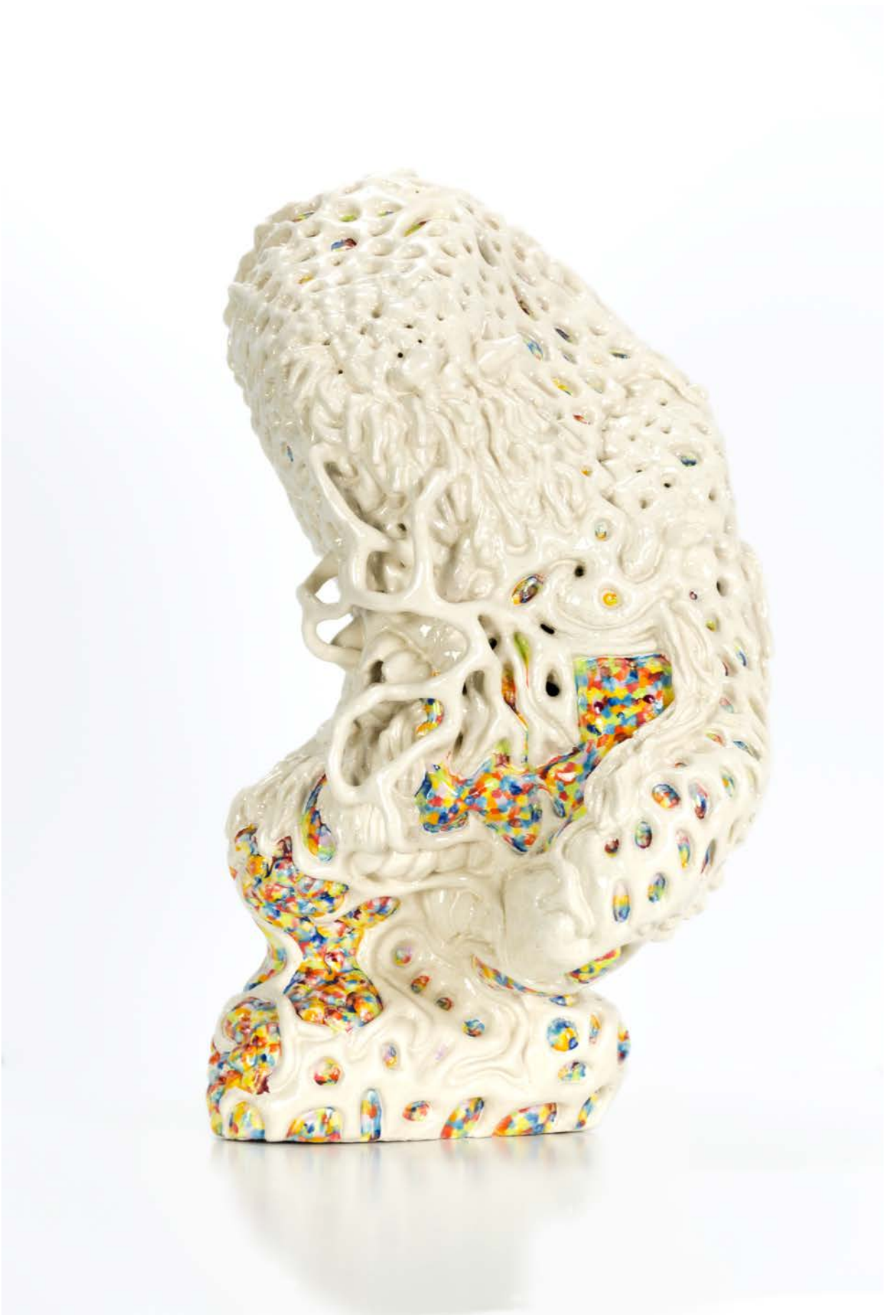
SERTNAP , 2017 ceramic 44 x 24 x 30 cm 17.3 x 9.4 x 11.8 inches