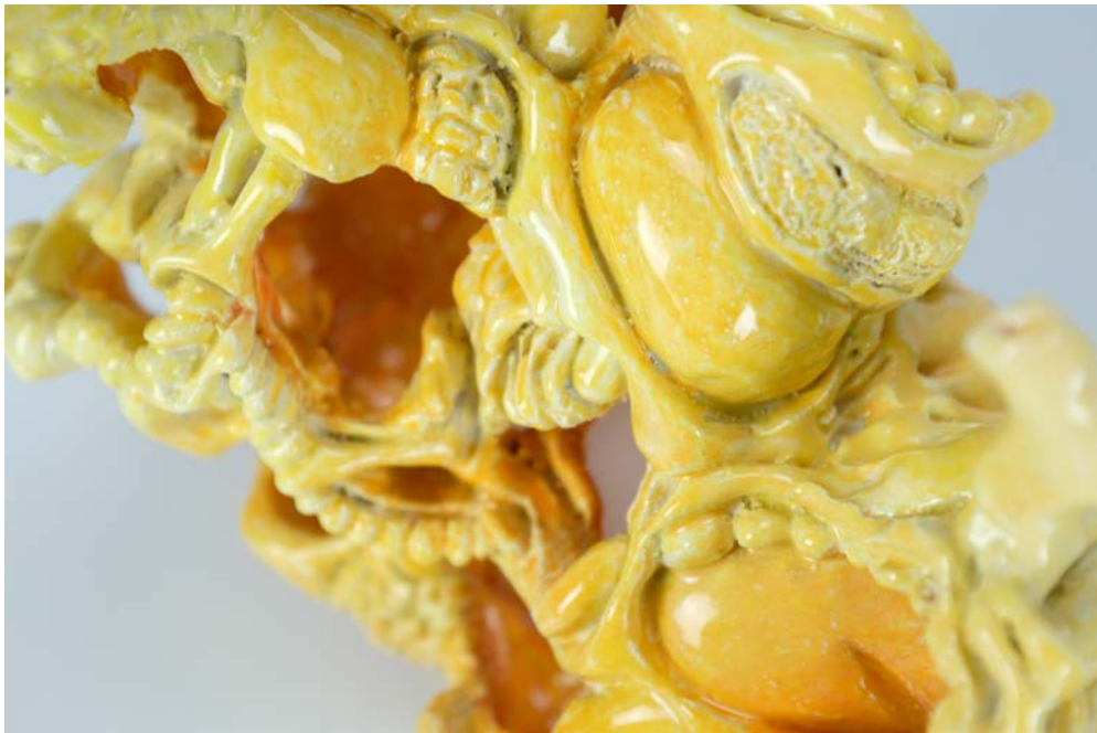
detail CROBOSLIO , 2017 - 2018 ceramic 34H x 30 x 36 cm 13.4H x 11.8 x 14.2 inches