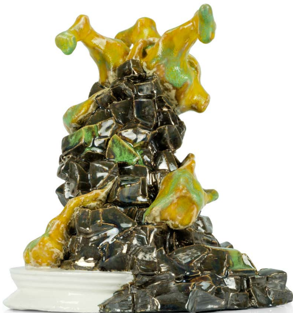
YREWLA , 2016 - 2018 ceramic 26 x 24 x 27 cm 10.2 x 9.4 x 10.6 inches