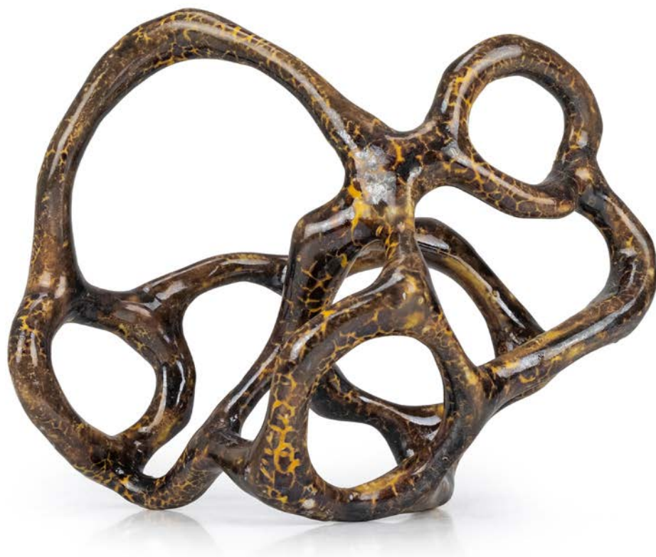
WINOCERAOS , 2020 - 2021 Ceramic 16,5 x 21,5 x 12 cm 6.5 x 8.5 x 4.7 inches