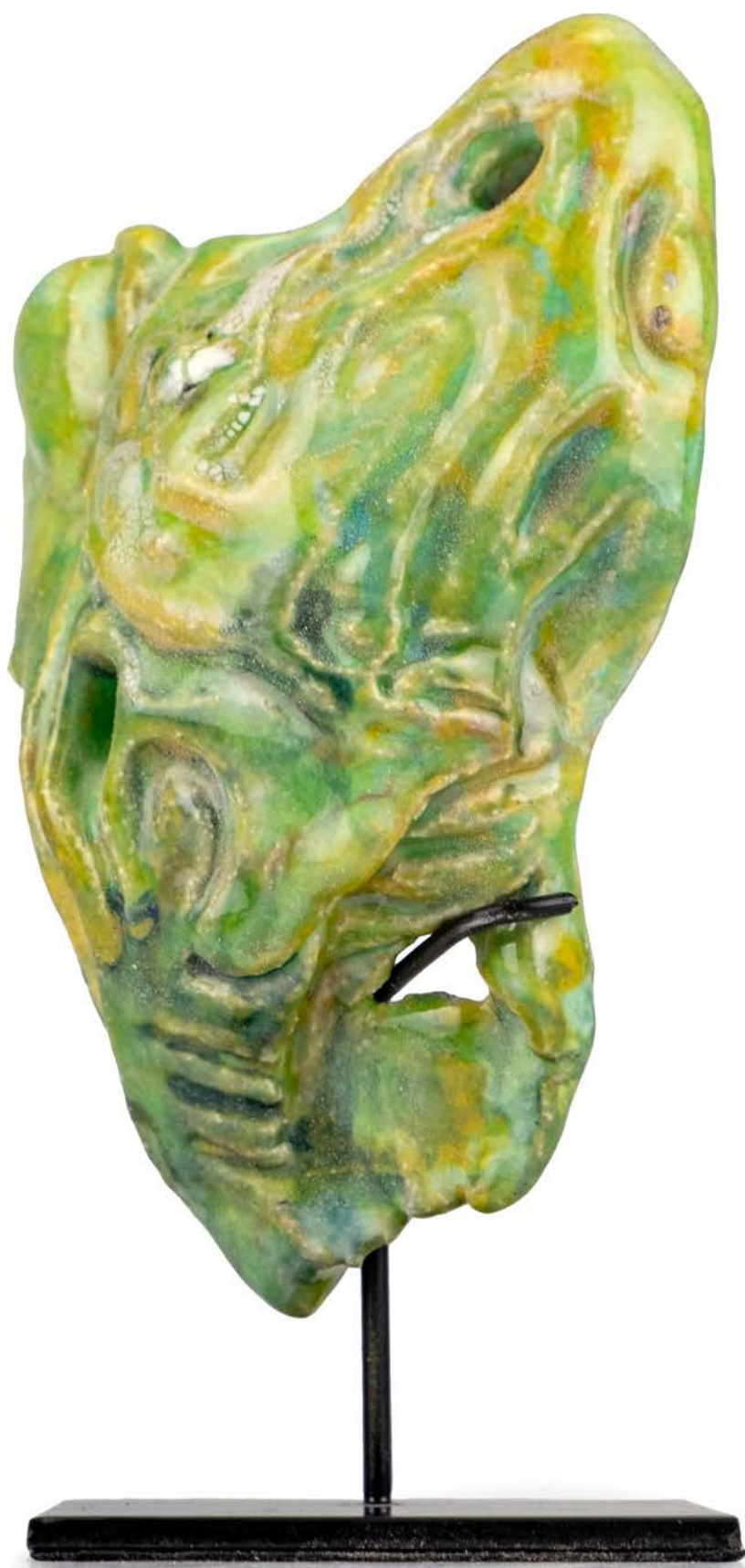
WIGNILUSA, 2022 ceramic 4,5 x 10,5 x 8,5 cm 1.7 x 4.1 x 3.3 inches