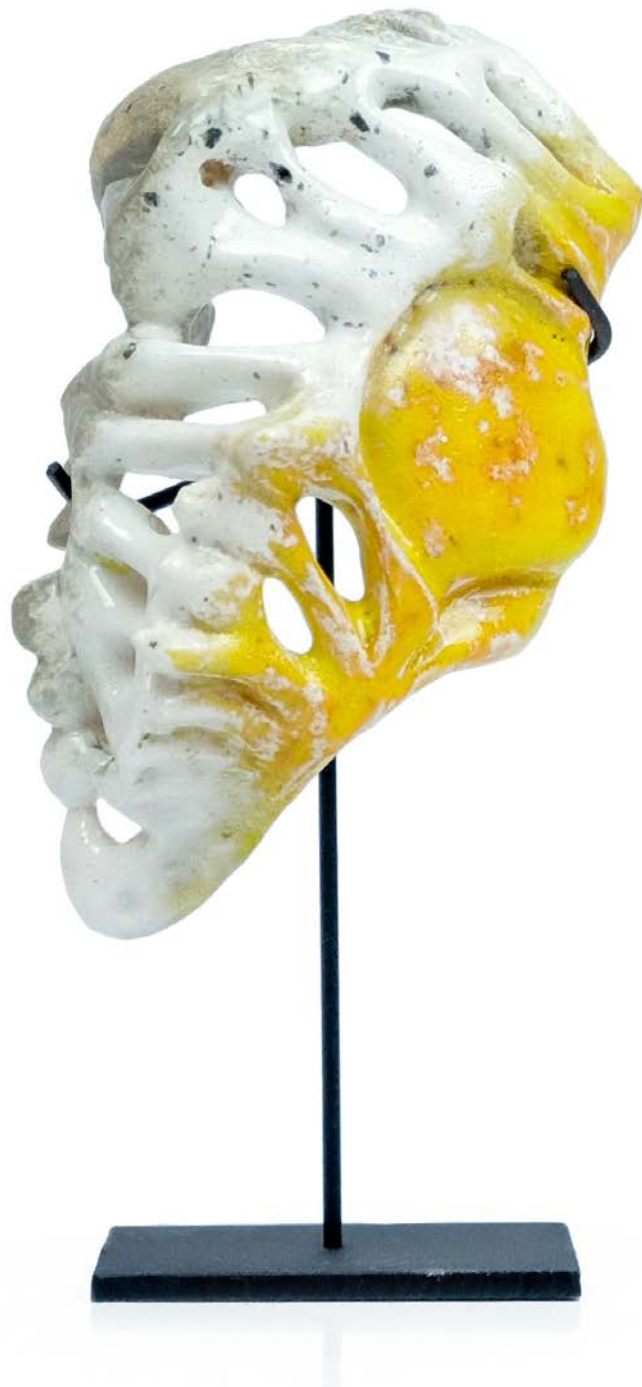
WIGNIROM , 2018 ceramic 11 x 6 x 5 cm 4.3 x 2.4 x 2 inches