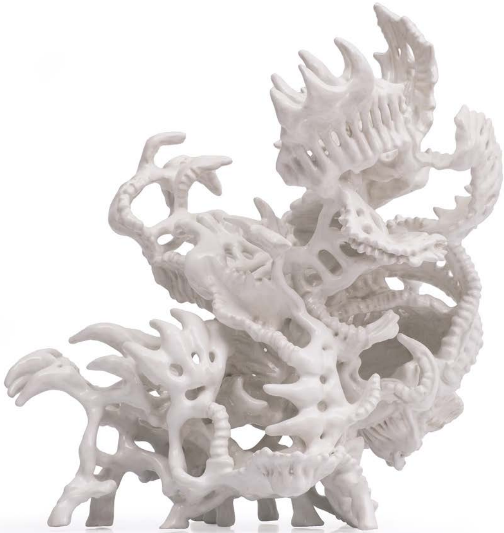
CANTARIK , 2017 ceramic 35 x 35 x 25 cm 13.8 x 13.8 x 9.9 inches