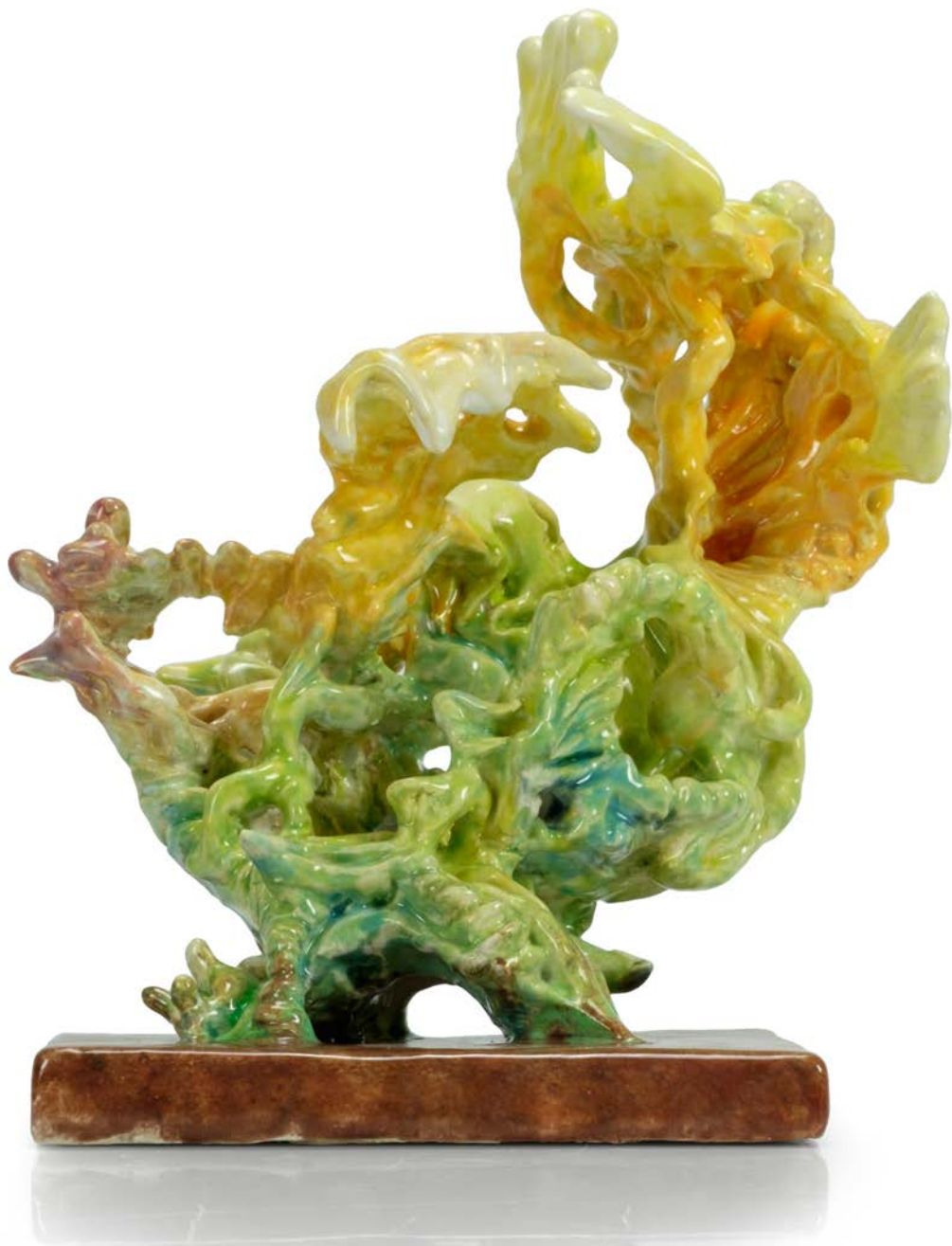
MINOTERKUS , 2017 ceramic 19 x 15 x 21 cm 7.5 x 5.9 x 8.3 inches