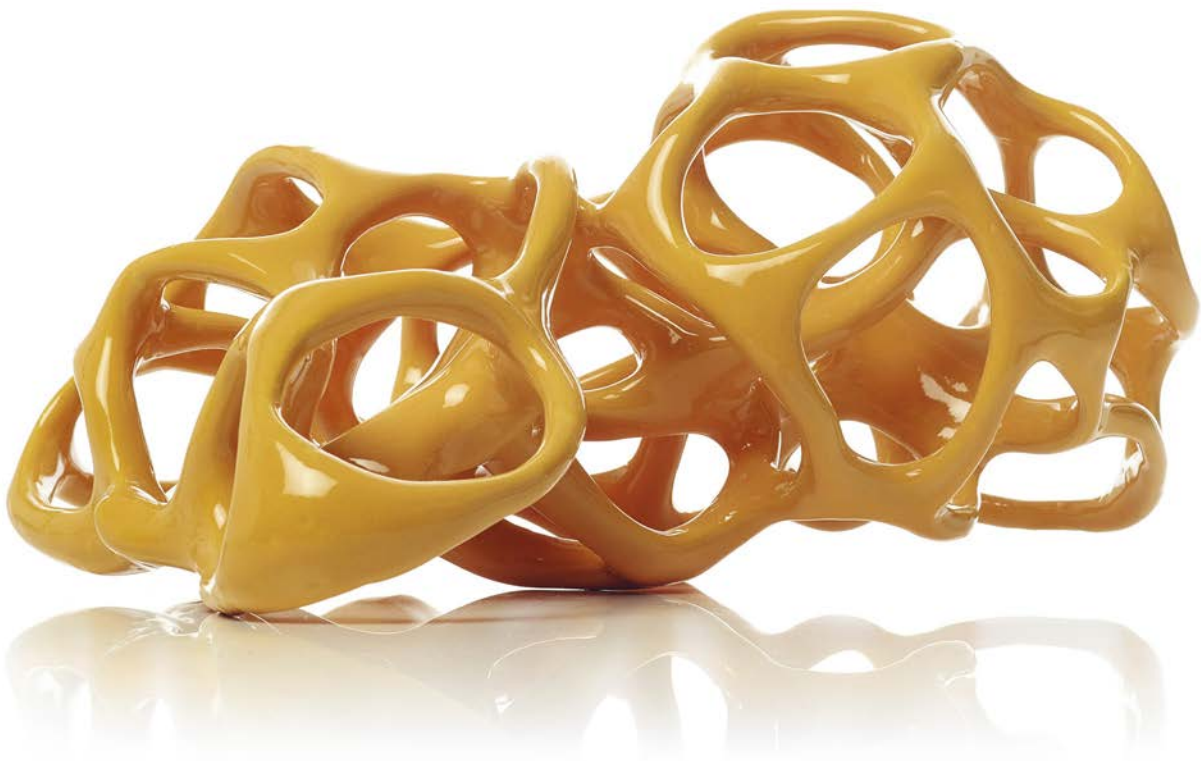
IEBLOCERICS , 2015 ceramic 17.5 x 40 x 29 cm 68.9 x 15.7 x 11.4 inches