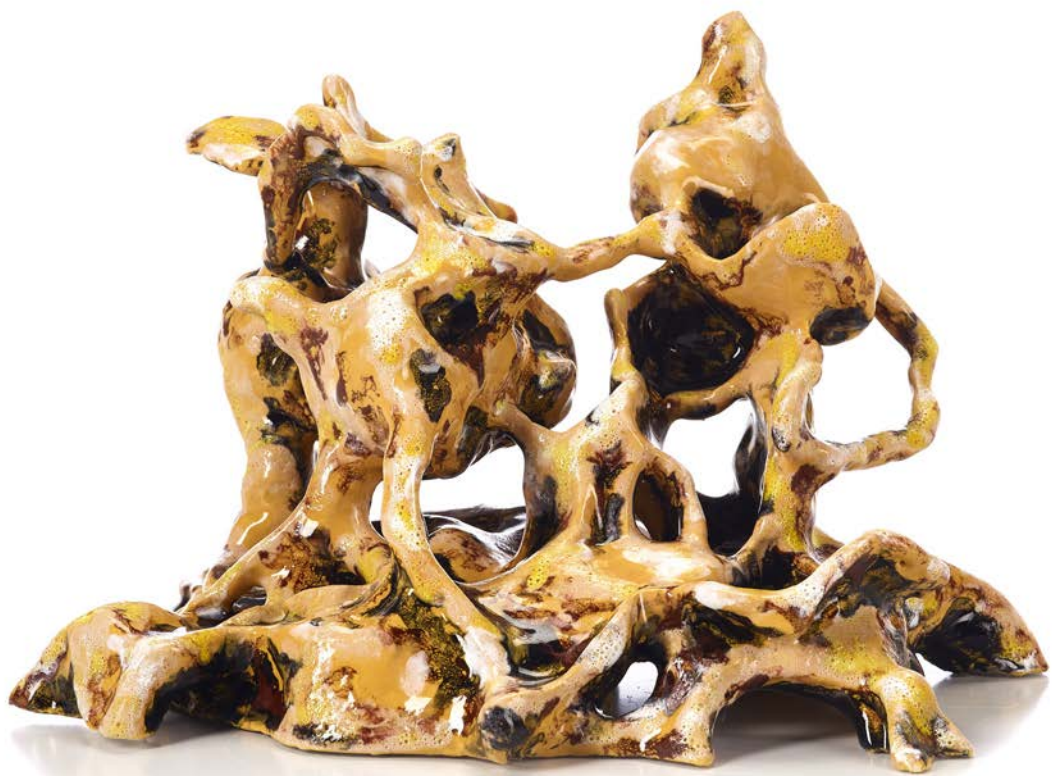
LEKNATOLLI, 2016 ceramic 22 x 22 x 18 cm 8.6 x 8.6 x 7 inches