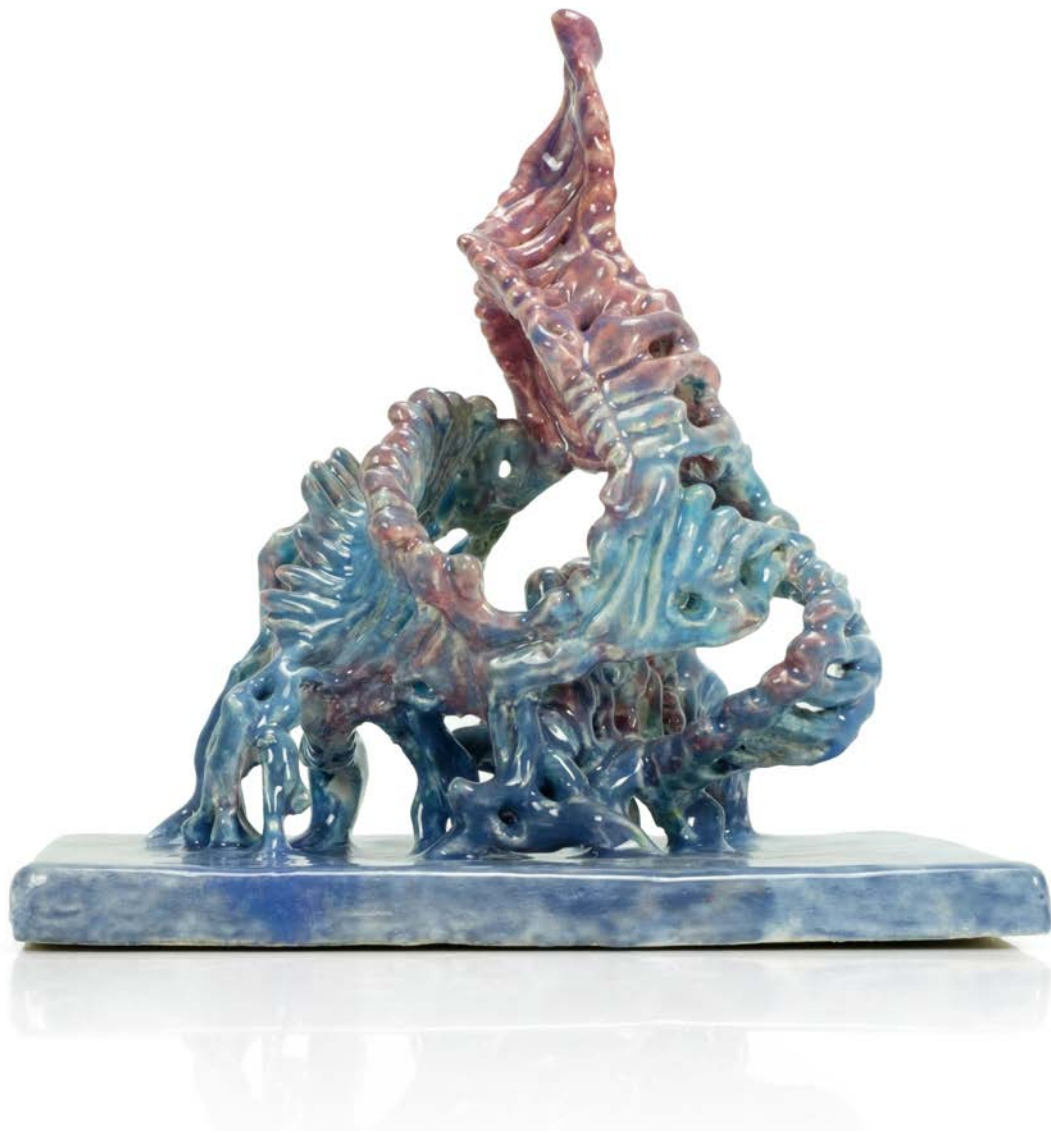
MINOTERKERUM , 2017 - 2018 ceramic 20 x 15.5 x 18 cm 7.9 x 6.1 x 7.1 inches