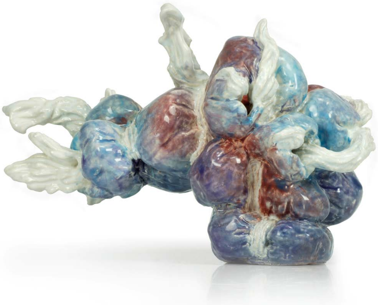
AKRITUM , 2017 - 2018 ceramic 19 x 29 x 15 cm 7.5 x 11.4 x 5.9 inches