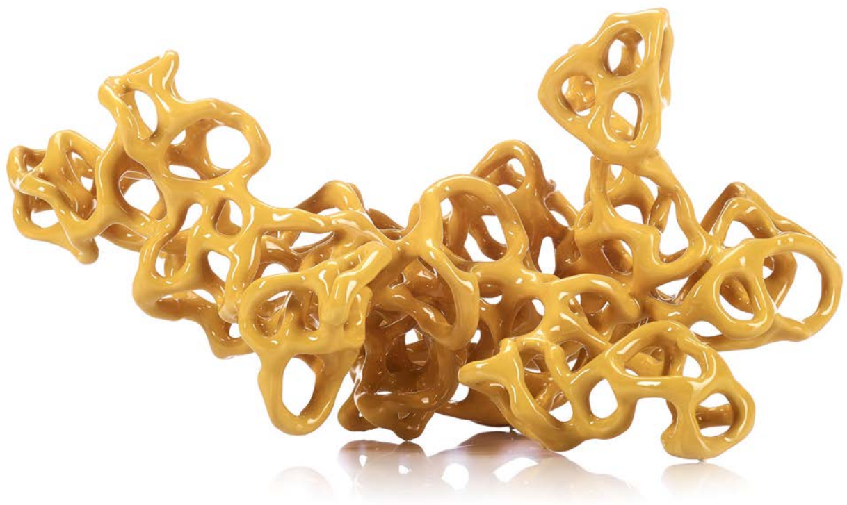
TIEWCERIM , 2016 ceramic 20 x 42 x 30 cm 7.9 x 16.5 x 11.8 inches