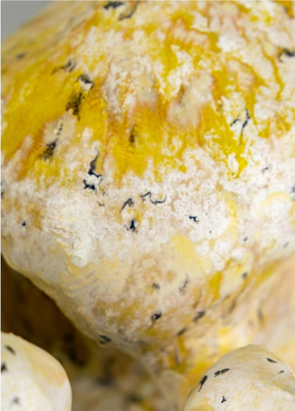
ELLEIBIO, 2023 ceramic 57 x 37,5 x 39,5 cm 22.4 x 14.8 x 15.5 inches