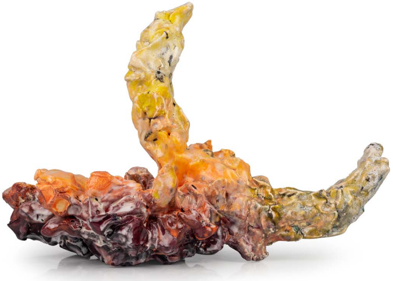
MANOSORIA, 2022 ceramic 21,5 x 29,5 x 18 cm 8.5 x 11.6 x 7 inches