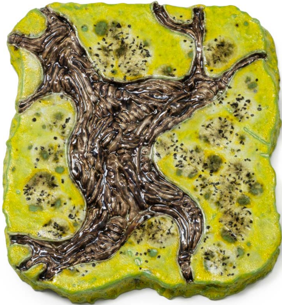
KINOVIZORK, 2018 ceramic 26 x 23 x 3 cm 10.2 x 9.1 x 1.2 inches