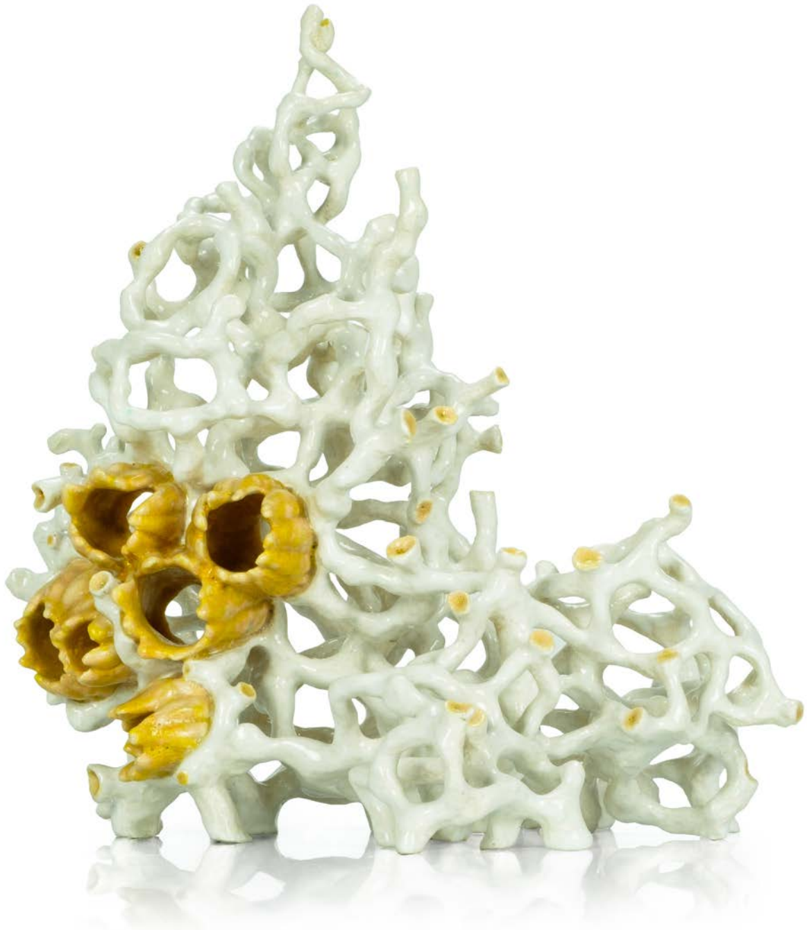
REWOLENO, 2014 - 2018 ceramic 40 x 25 x 49 cm 15.7 x 9.8 x 19.3 inches