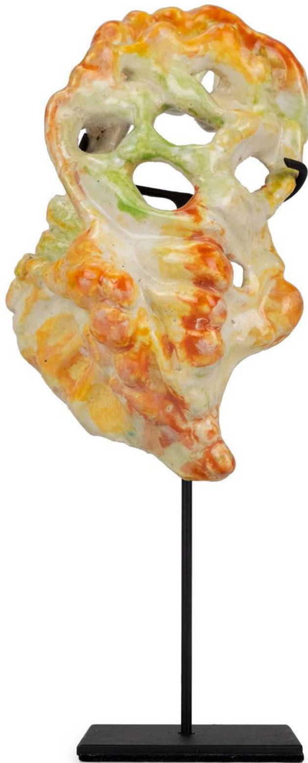
WIGNILOS , 2020 - 2021 Ceramic 15 x 9,5 x 8 cm 5.9 x 3.7 x 3.1 inches