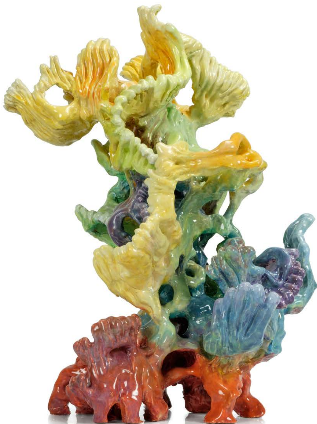
BRUNTUSCOLER, 2018 ceramic 50 x 34 x 34 cm 19.7 x 13.4 x 13.4 inches