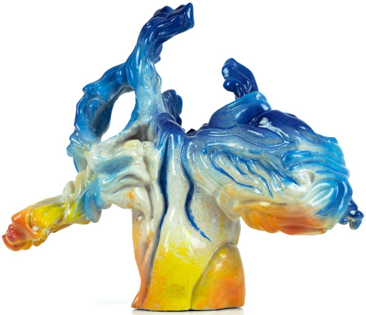
COREWOYER, 2016 ceramic 32 x 18 x 29 cm 12.6 x 7 x 11.4 inches