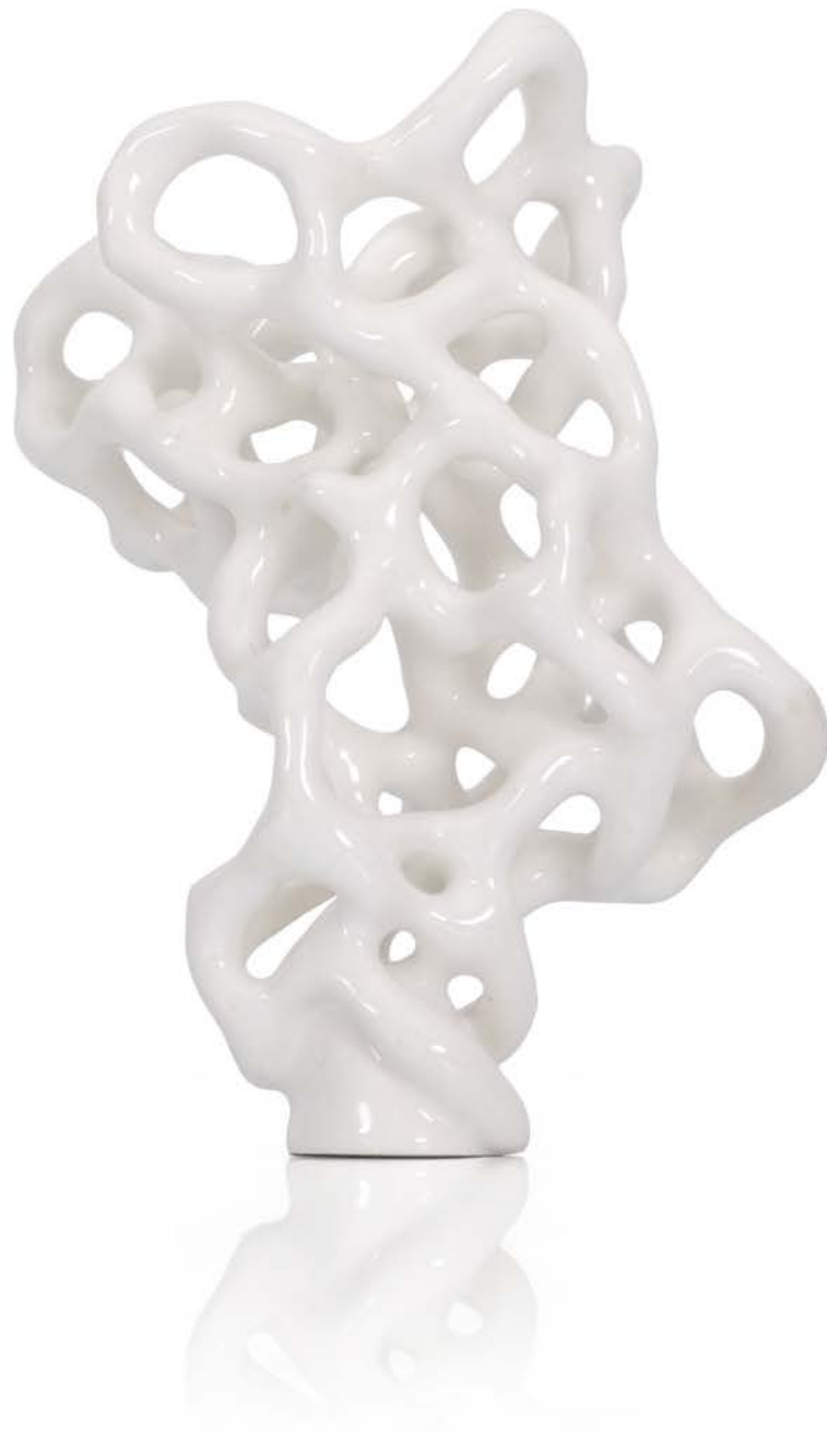
LEGULECER , 2016 ceramic 11 x 12 x 16.5 cm 4.3 x 4.7 x 6.5 inches