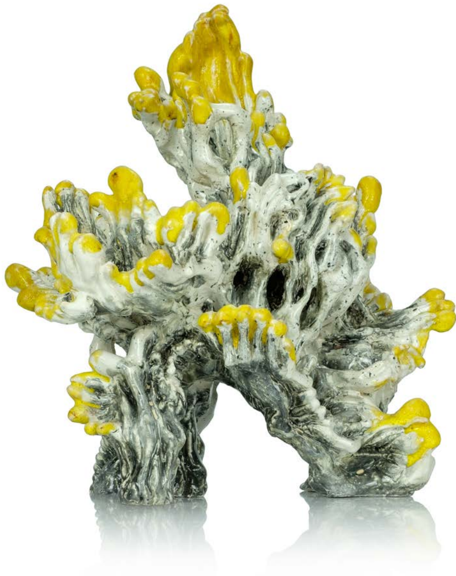
BRUNTISKO , 2017 - 2018 ceramic 33 x 30 x 30 cm 13 x 11.8 x 11.8 inches