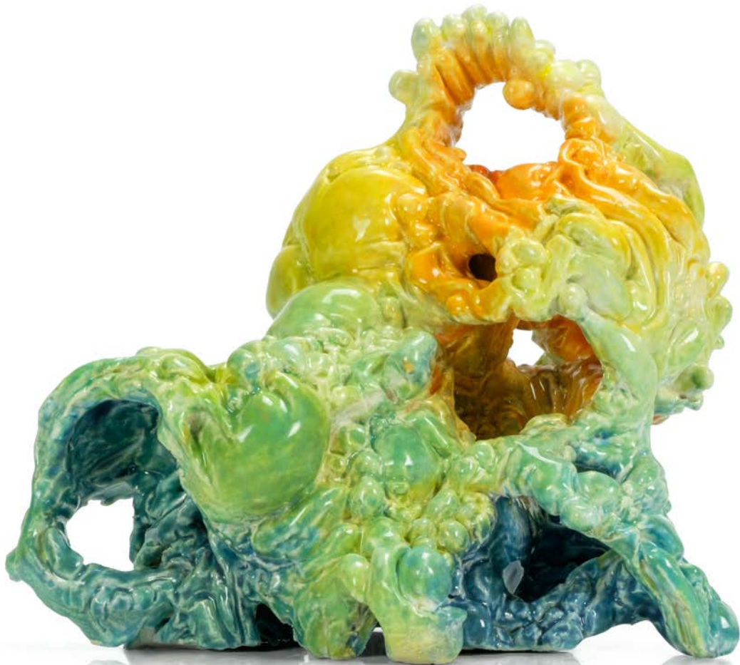
CROBOSLIEM , 2017 - 2018 ceramic 23 x 28 x 19 cm 9.1 x 11 x 7.5 inches