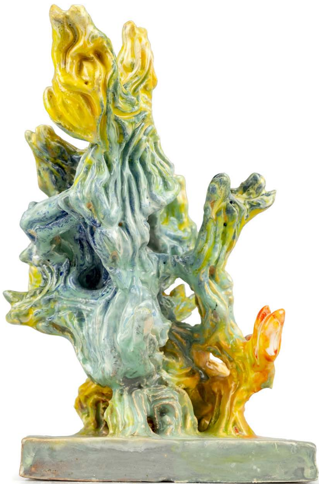
MINOTERIAS, 2023 ceramic 20 x 16 x 14 cm 7.9 x 6.3 x 5.5 inches