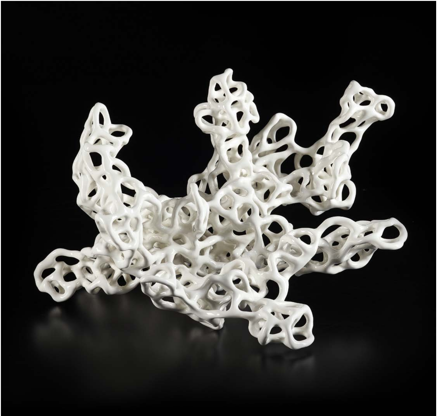
LERACERUM , 2016 ceramic 28 x 43,5 x 43 cm 11 x 17,1 x 16,9 inches