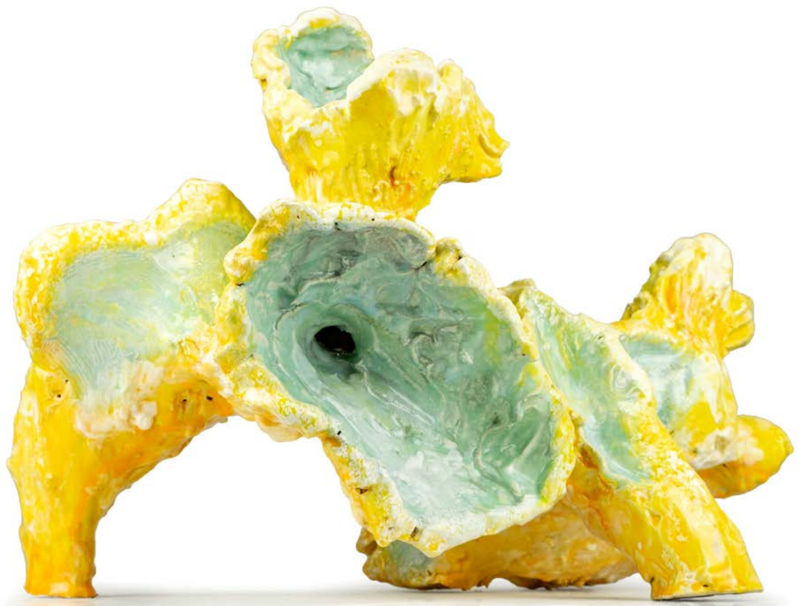
CORECHNIOR , 2023 ceramic 38 x 57 x 36,5 cm 15 x 22.4 x 14.4 inches