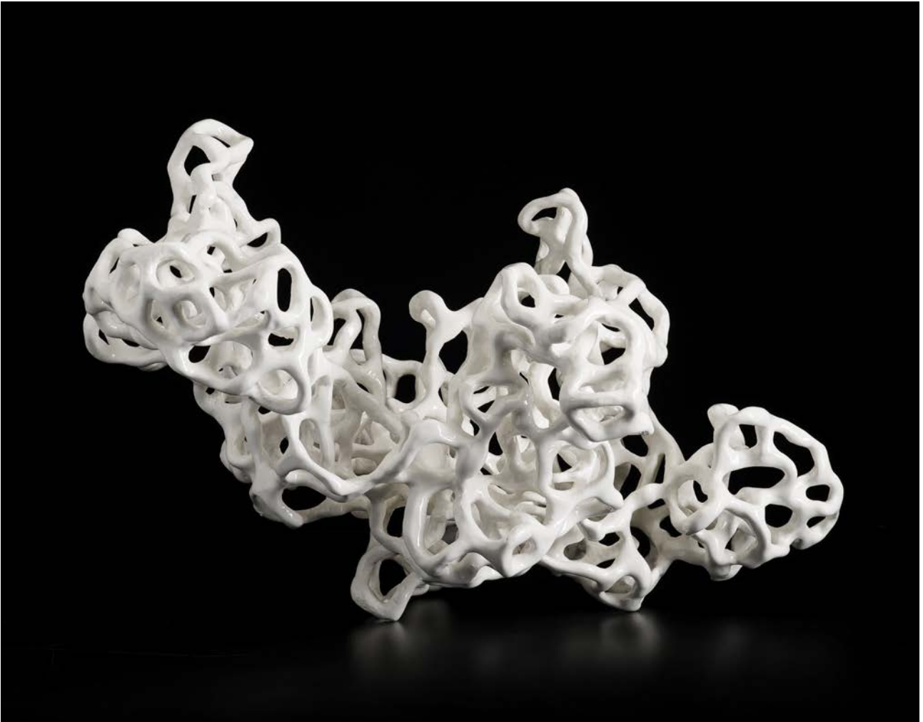
TIEWCERUM, 2016 ceramic 28 x 28 x 43 cm 11 x 11 x 16.9 inches