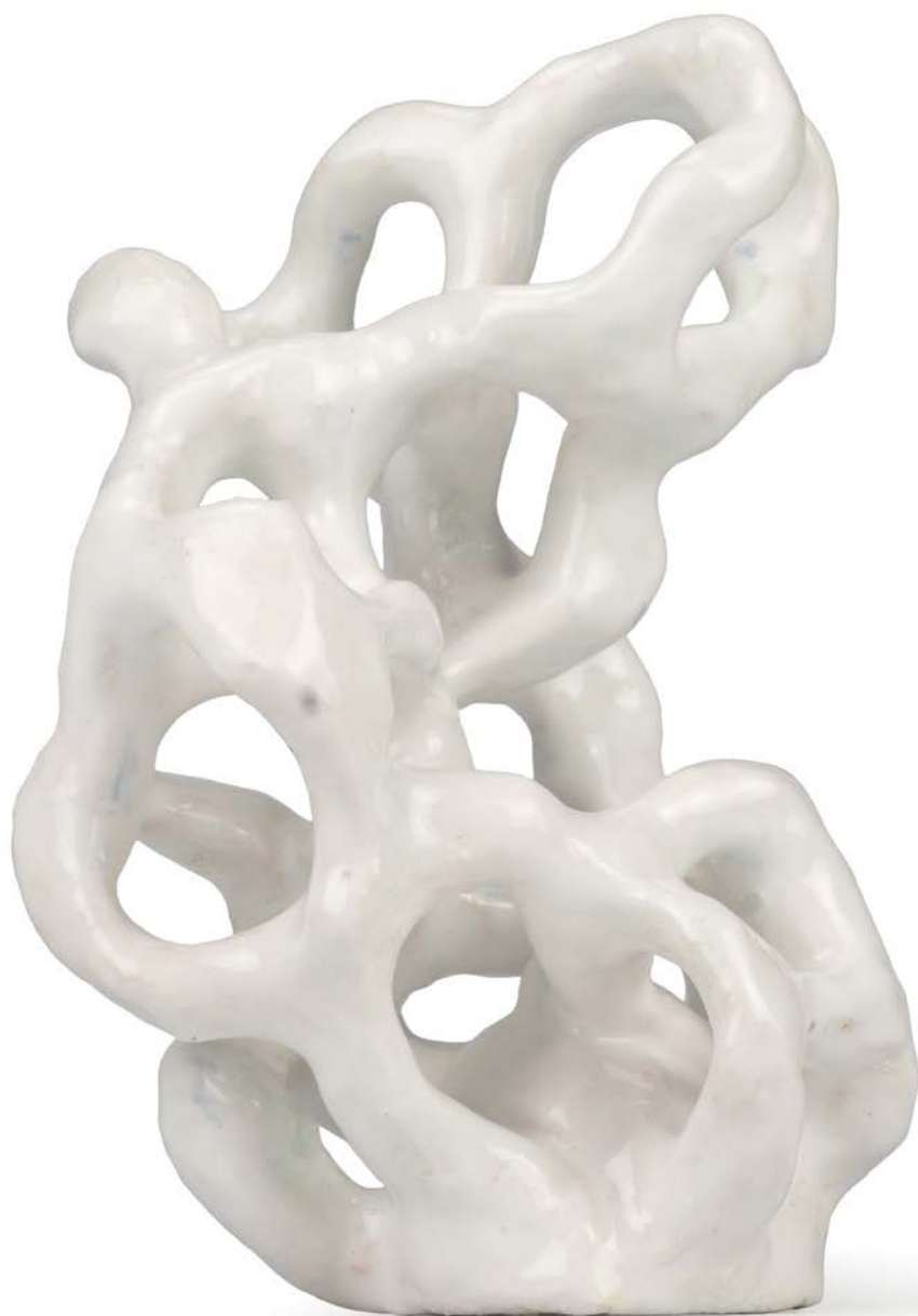
LEGULIACO, 2022 ceramic 14,5 x 8 x 9,5 cm 5.7 x 3 x 3.7 inches