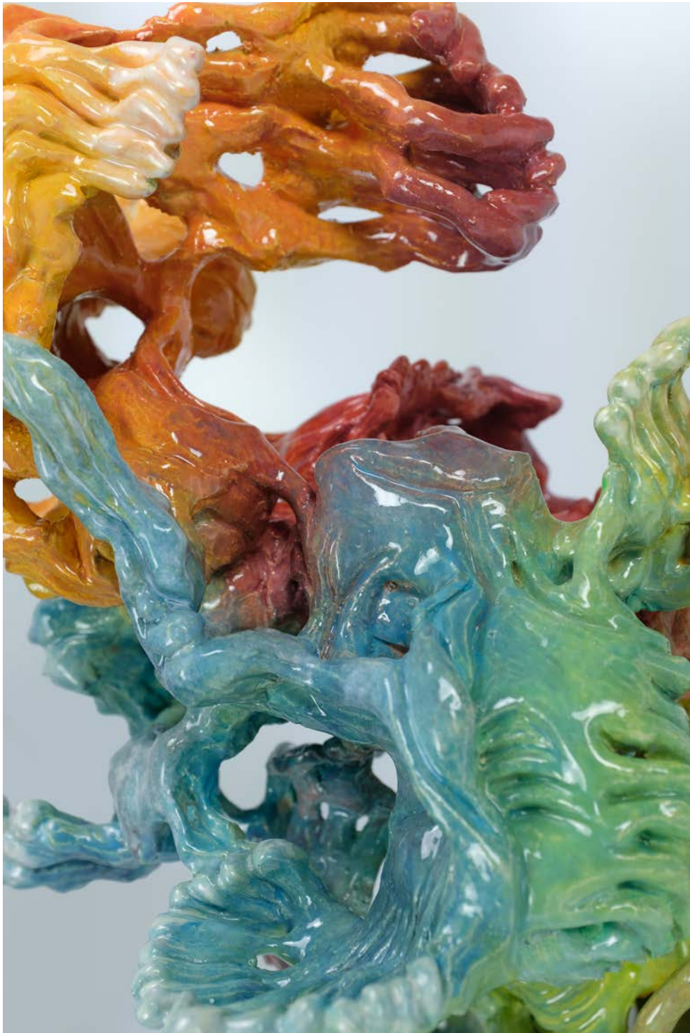
detail BRUNTUSCOLUP , 2018 ceramic 45 x 40 x 38 cm 17.7 x 15.7 x 15 inches