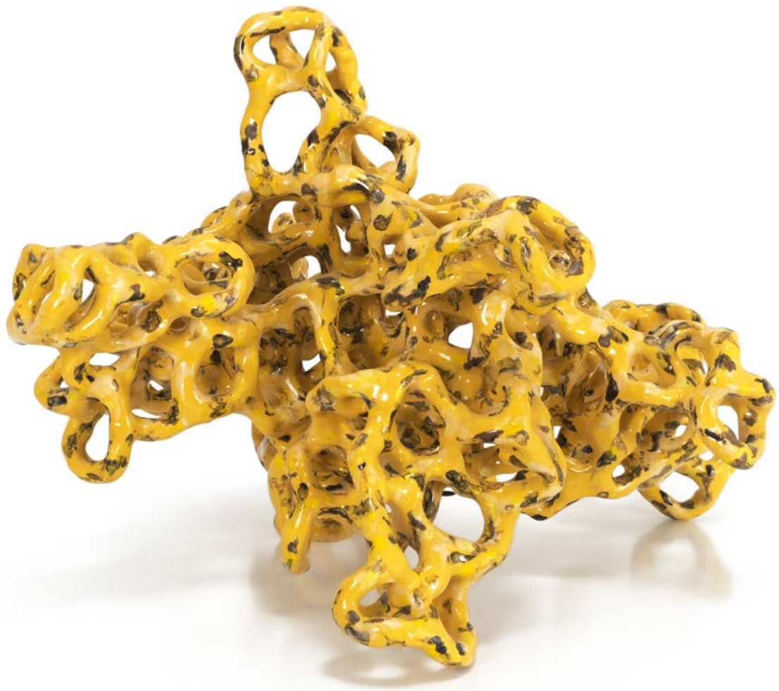
PLETARNUM , 2016 - 2017 ceramic 50 x 60 x 35 cm 23.6 x 19.7 x 13.8 inches