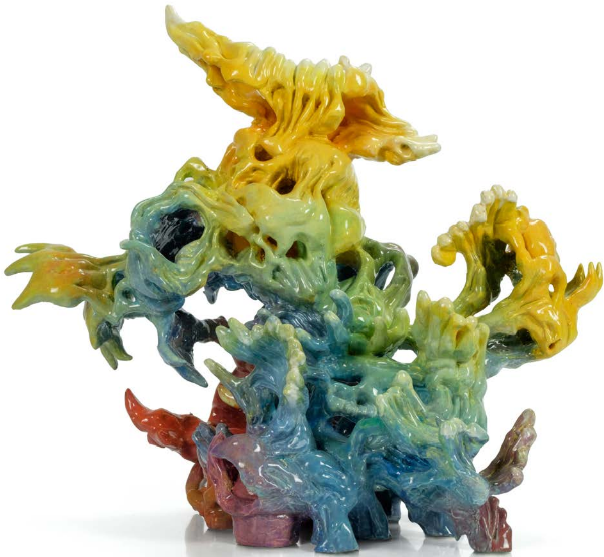
BRUNTUSLI, 2017 - 2018 ceramic 43 x 45 x 30 cm 16.9 x 17.7 x 11.8 inches