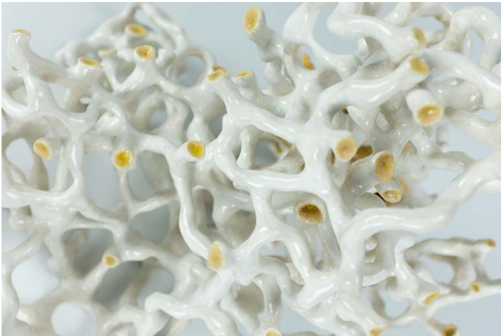
detail REWOLENO , 2014 - 2018 ceramic 40 x 25 x 49 cm 15.7 x 9.8 x 19.3 inches