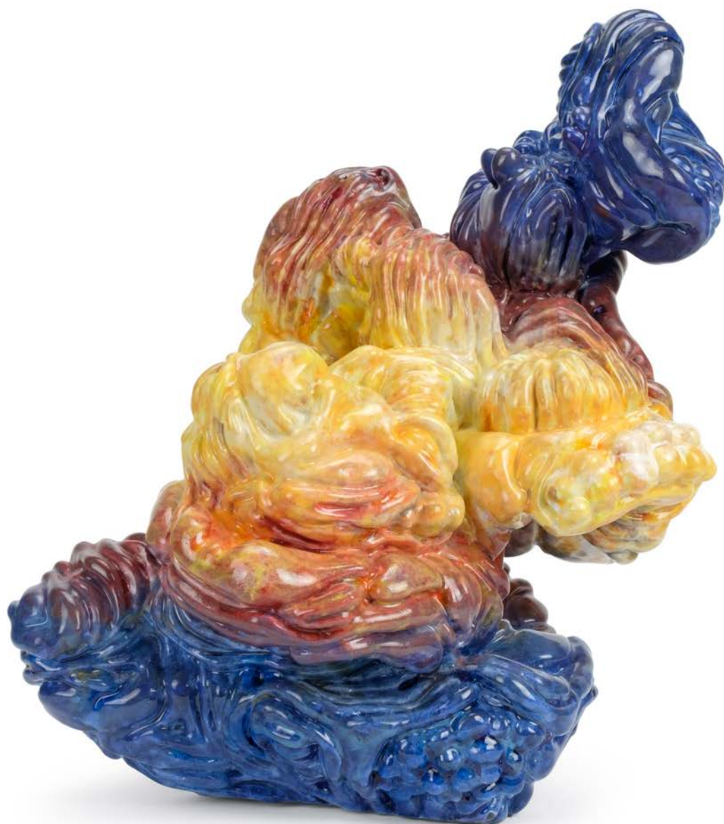
COREWOLA , 2016 ceramic 29 x 22 x 27 cm 11.4 x 8.7 x 10.6 inches