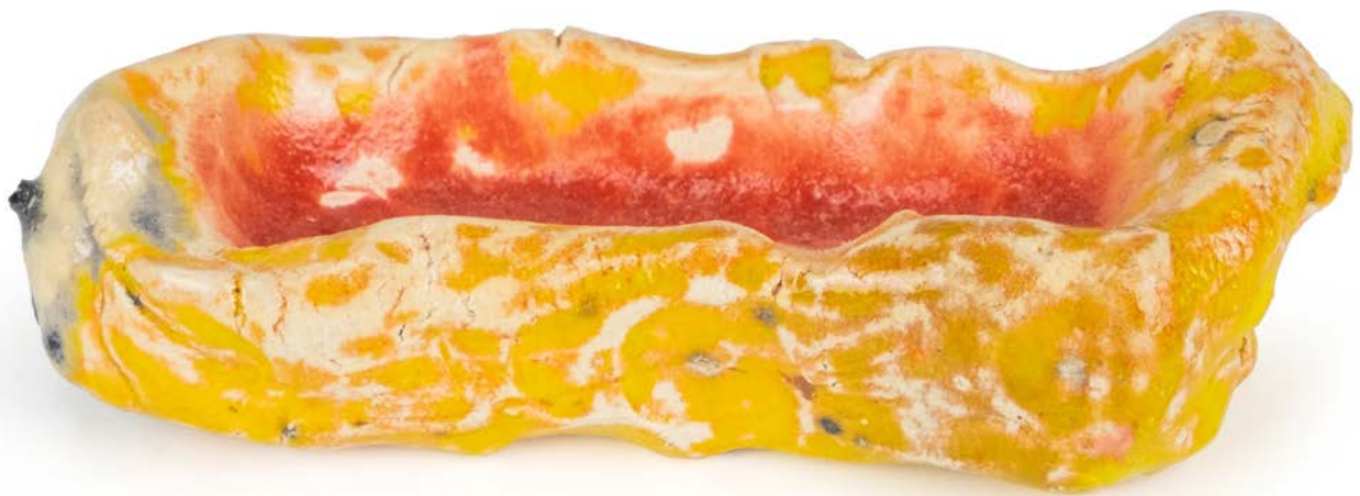
KINORAZORI , 2020 - 2021 Ceramic 3,5 x 13,5 x 5,5 cm 1.4 x 5.3 x 2.2 inches