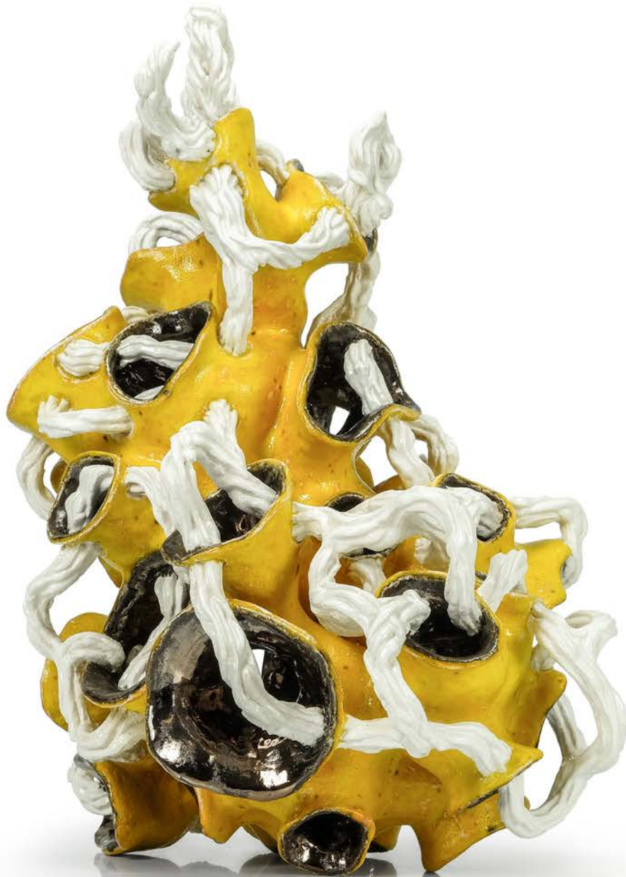
BOBLARAK , 2014 - 2017 ceramic 49 x 34 x 30 cm 19.3 x 13.4 x 11.8 inches