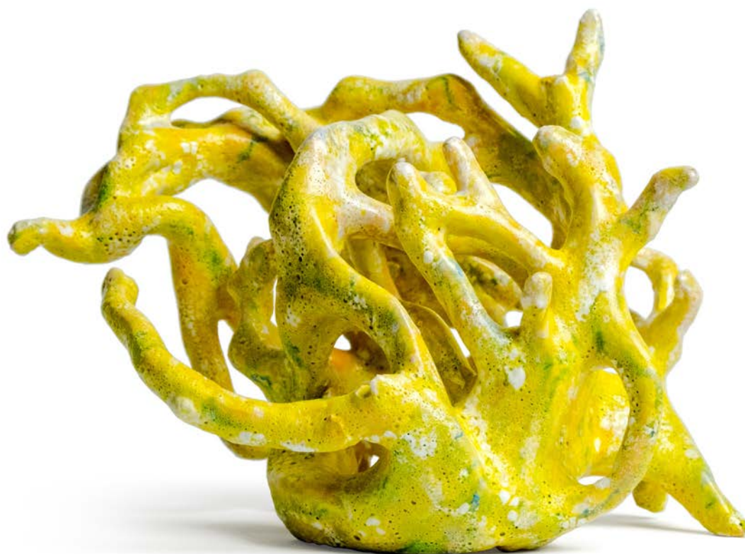
IEBLOCER, 2019 ceramic 20 x 28 x 22 cm 7.9 x 11 x 8.7 inches