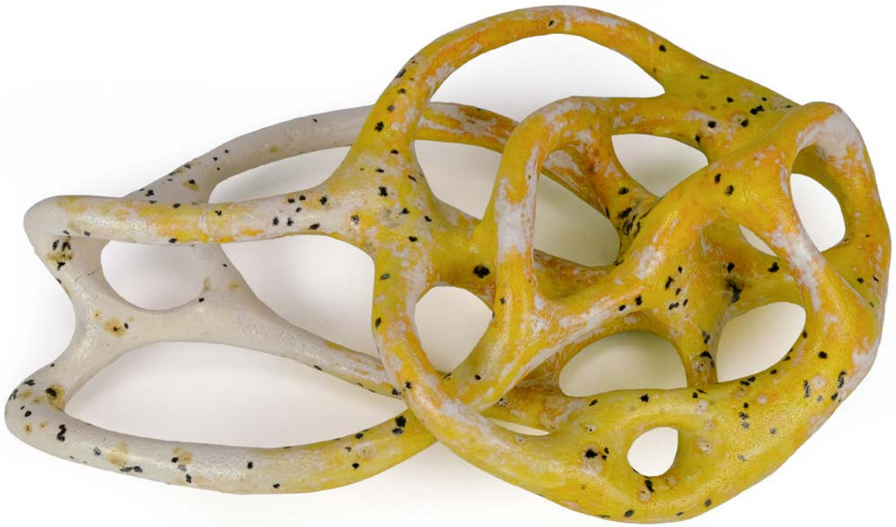
IEBLOCERIAAW , 2020 - 2021 Ceramic 12,5 x 41 x 26 cm 4.9 x 16 x 10.2 inches