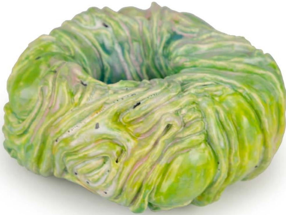
BOARILUS, 2022 ceramic 6,3 x 13 x 13 cm 2.5 x 5.1 x 5.1 inches