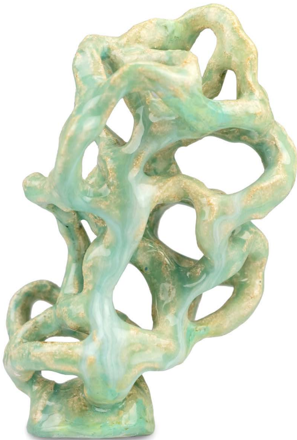
LEGUCAIR, 2022 ceramic 17,5 x 11 x 11 cm 6.9 x 4.3 x 4.3 inches