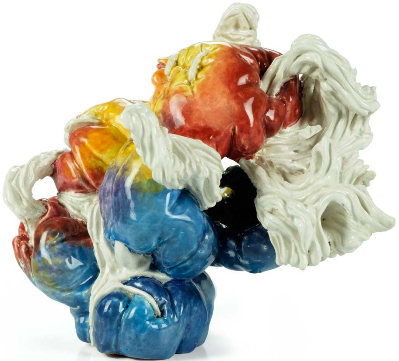
AKRINWRINAP , 2007-2018 ceramic 19 x 23 x 23 cm 7.5 x 9.1 x 9.1 inches