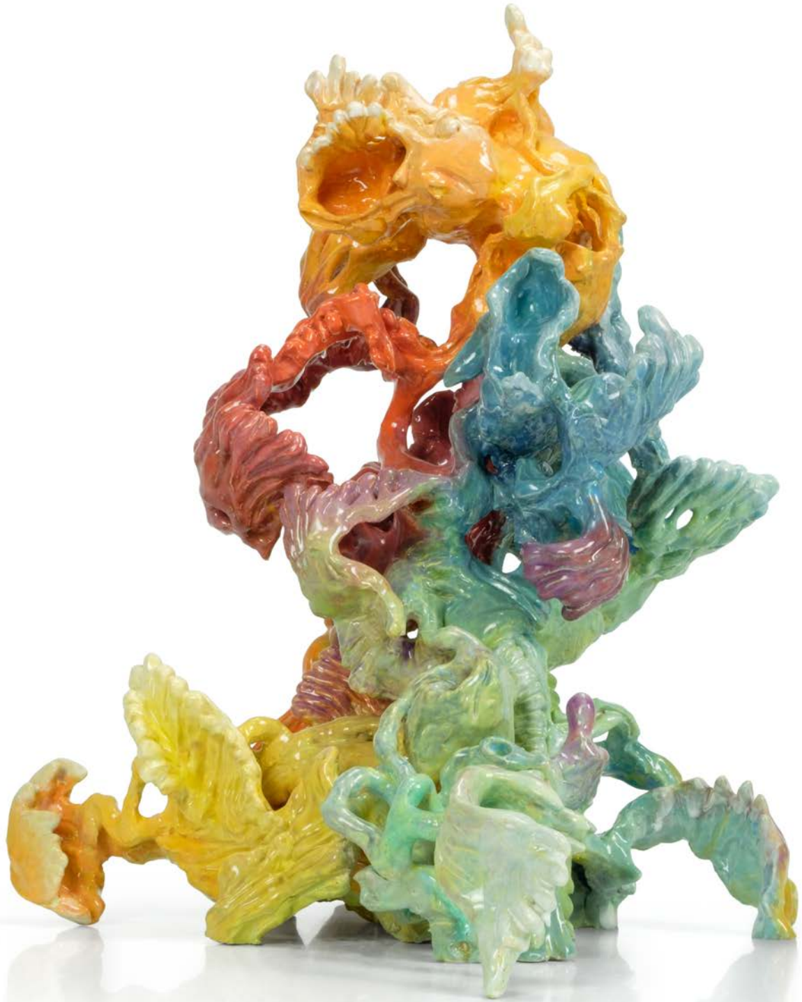
BRUNTUSCOLUP , 2018 ceramic 45 x 40 x 38 cm 17.7 x 15.7 x 15 inches