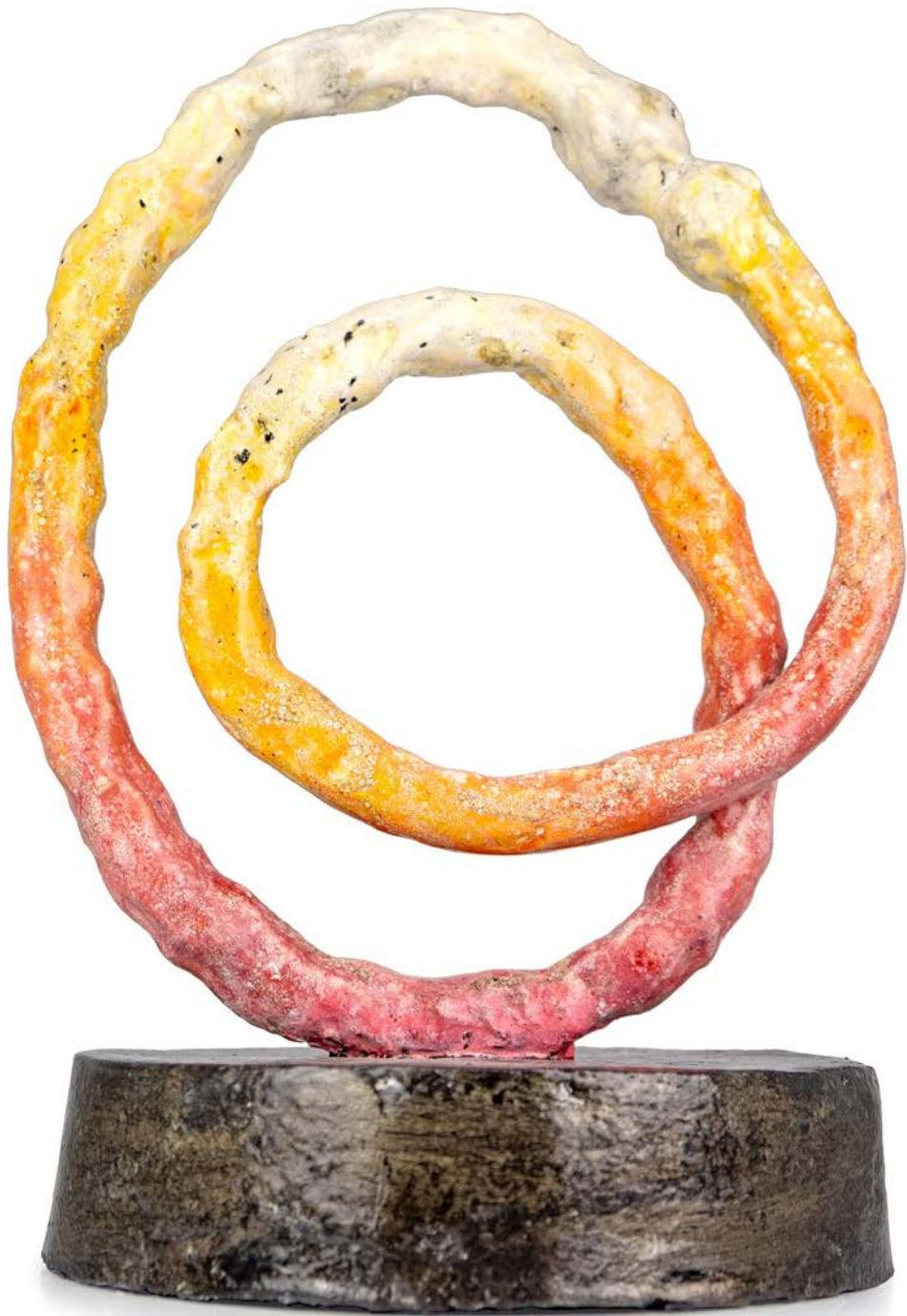
IEBLUATIE , 2022-2023 ceramic 43 x 30 x 26,7 cm 17 x 11.8 x 10.5 inches