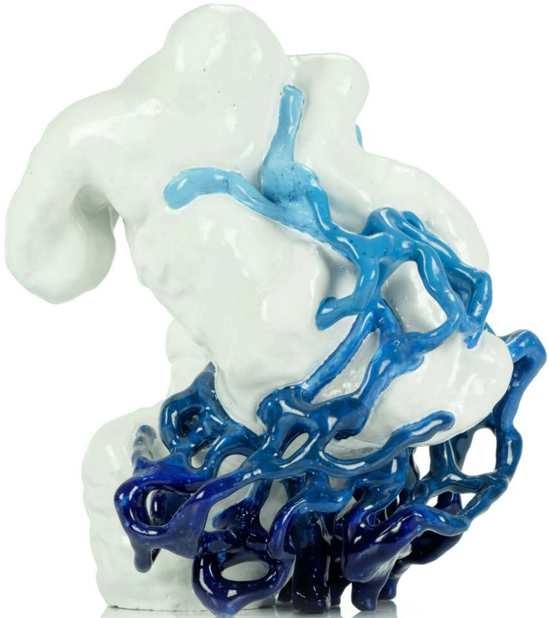
EKSLERE , 2014 - 2017 ceramic 26 x 30 x 37 cm 10.2 x 11.8 x 14.6 inches