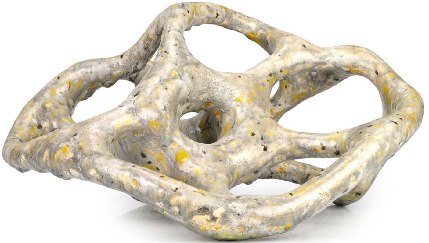
WINOTIORA, 2021 - 2022 ceramic 26,5 x 44,5 x 47,5 cm 10.4 x 17.5 x 18.7 inches