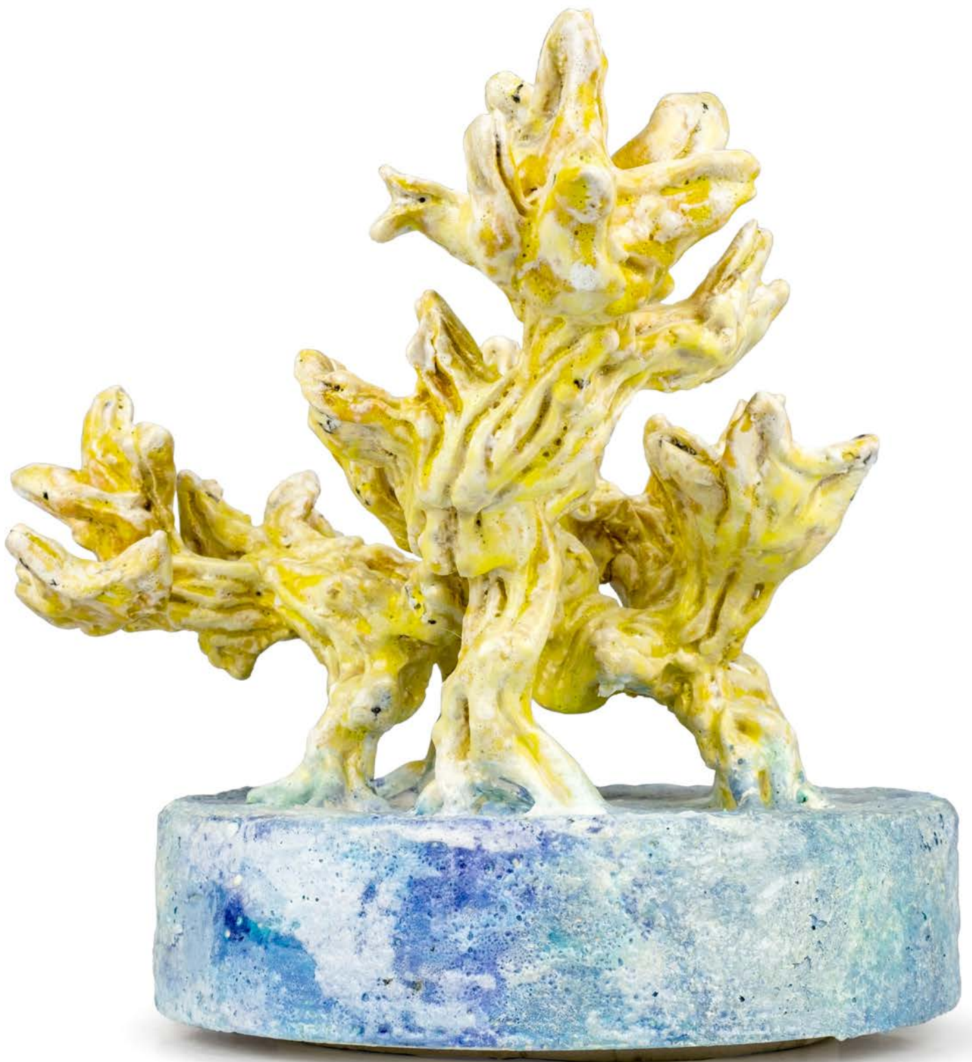
MINOTERSIEMO, 2023 ceramic 29 x 36 x 32 cm 11.4 x 14 x 12.6 inches