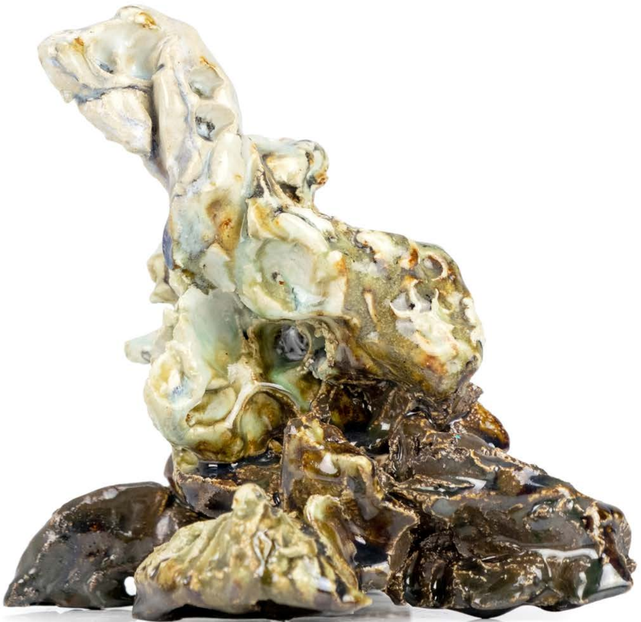
BRUNTUSDO, 2022 ceramic 17,5 x 19,5 x 16,5 cm 6.9 x 7.7 x 6.5 inches