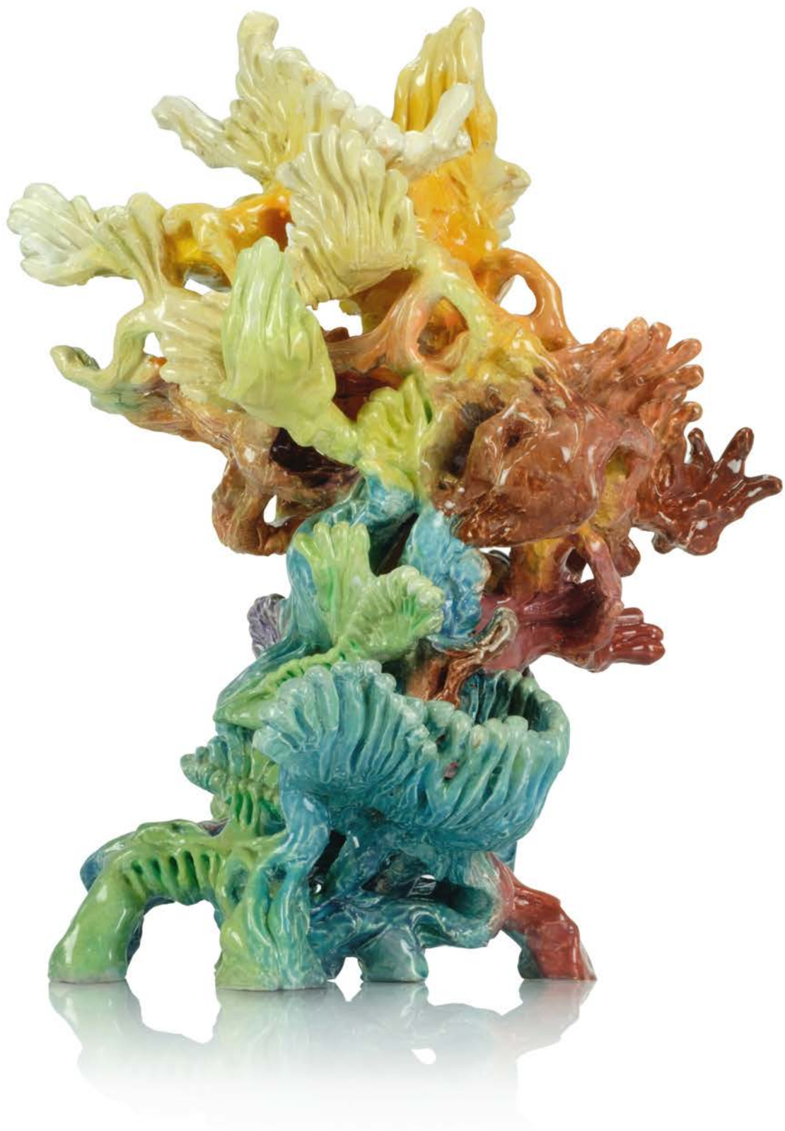
BRUNTUSCOLO, 2018 ceramic 46 x 37 x 37 cm 18.1 x 14.6 x 14.6 inches