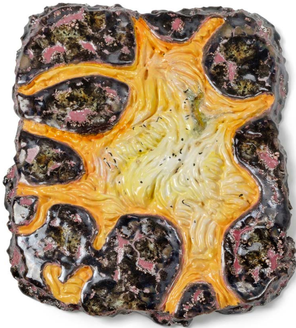
KINOTANUT, 2018 ceramic 3 x 28 x 23 cm 1.2 x 11 x 9.1 inches