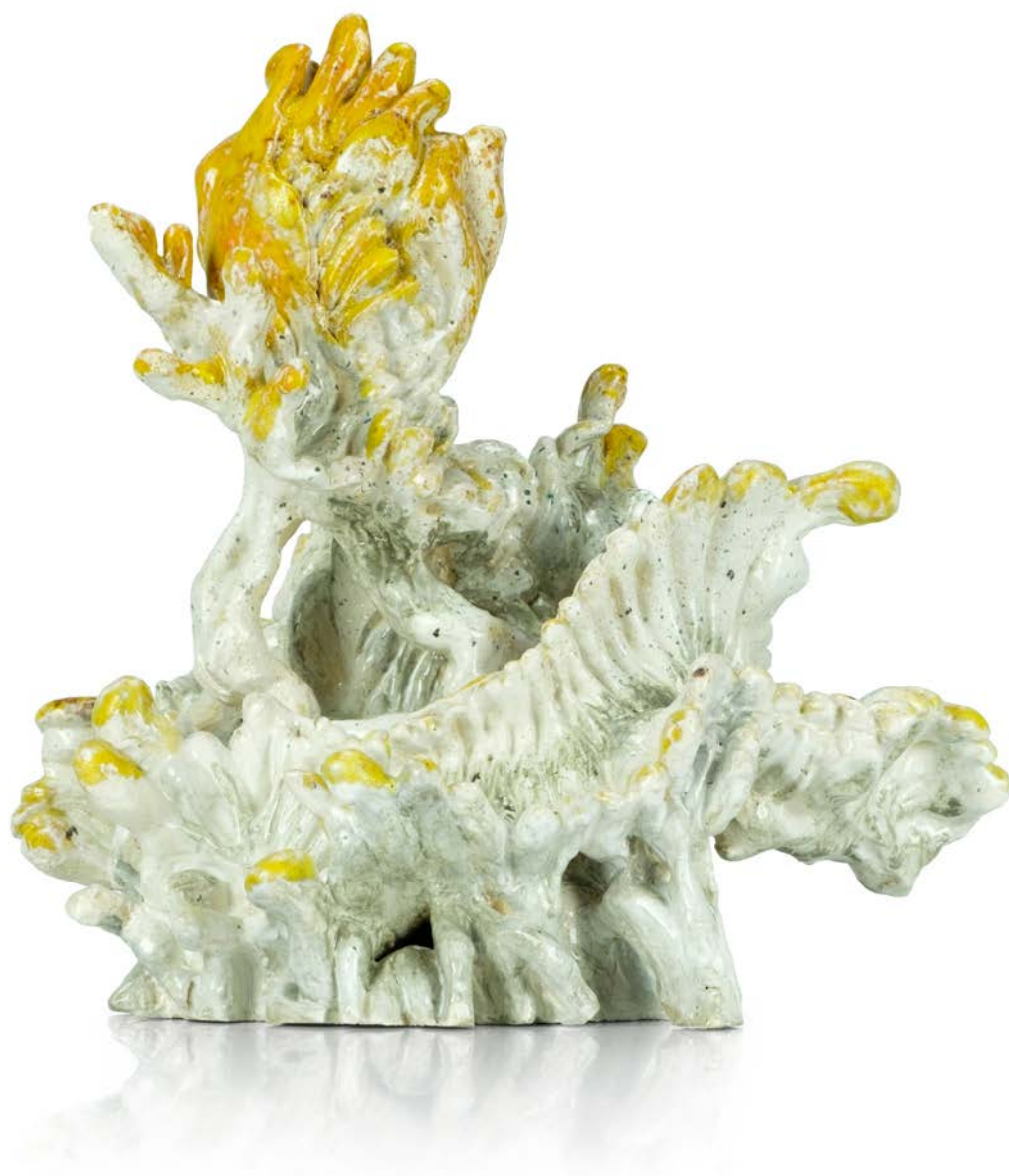
BRUNTISKIE, 2017 - 2018 ceramic 29 x 26 x 30 cm 11.4 x 10.2 x 11.8 inches