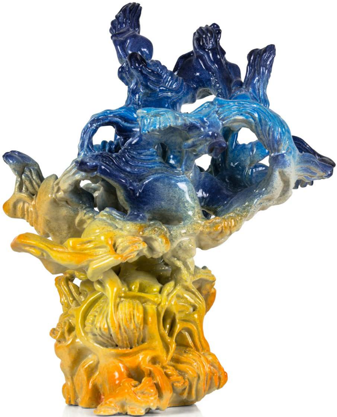
CORBOLIAT, 2015 ceramic 25 x 32 x 38 cm 9.8 x 12.6 x 15 inches