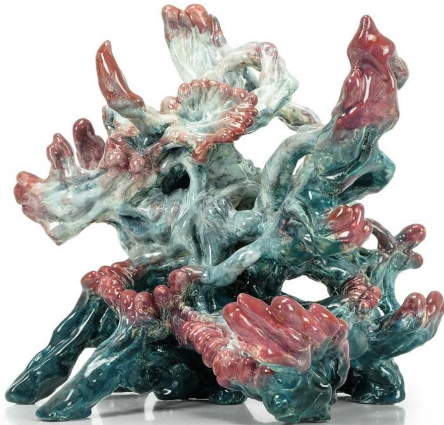
BRUNTUSLA , 2018 ceramic 29 x 31 x 31 cm 11.4 x 12.2 x 12.2 inches