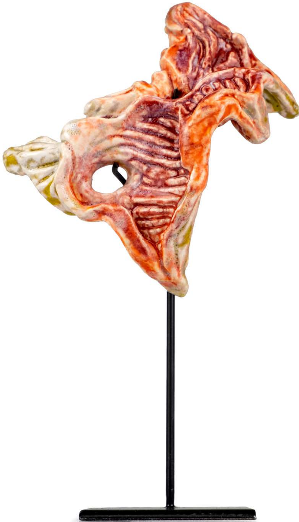
WIGNIRIOS, 2022 ceramic 19,6 x 11,5 x 7,2 cm 7.7 x 4.5 x 2.8 inches