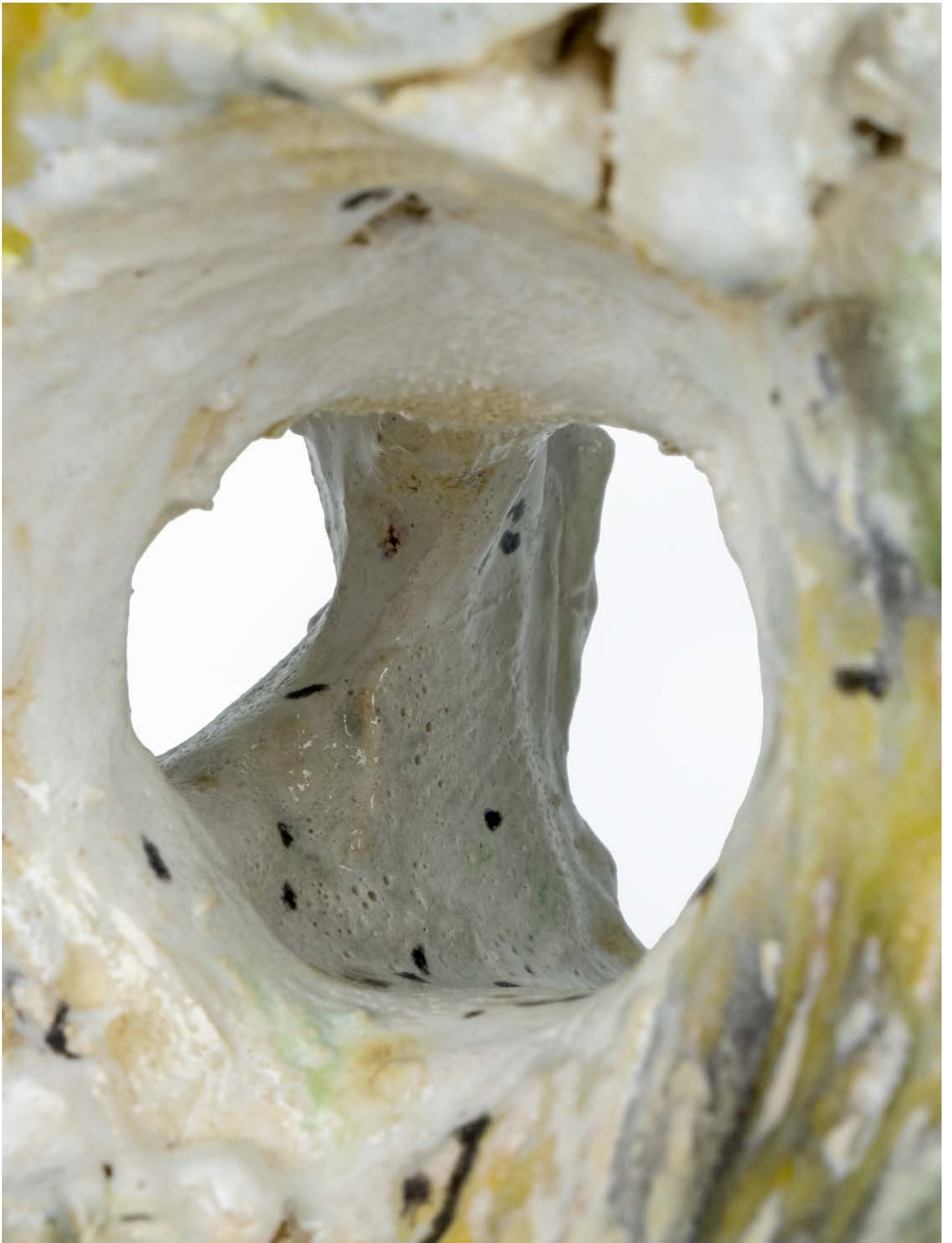
ENOORIOLU, 2021 ceramic 44,5 x 34 x 22,5 cm 17.5 x 13.4 x 8.9 inches