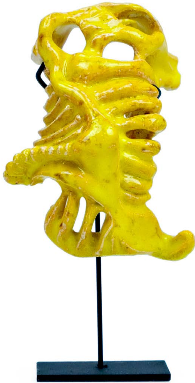
WIGNIRUS , 2018 ceramic 11 x 5 x 7 cm 4.3 x 2 x 2.8 inches