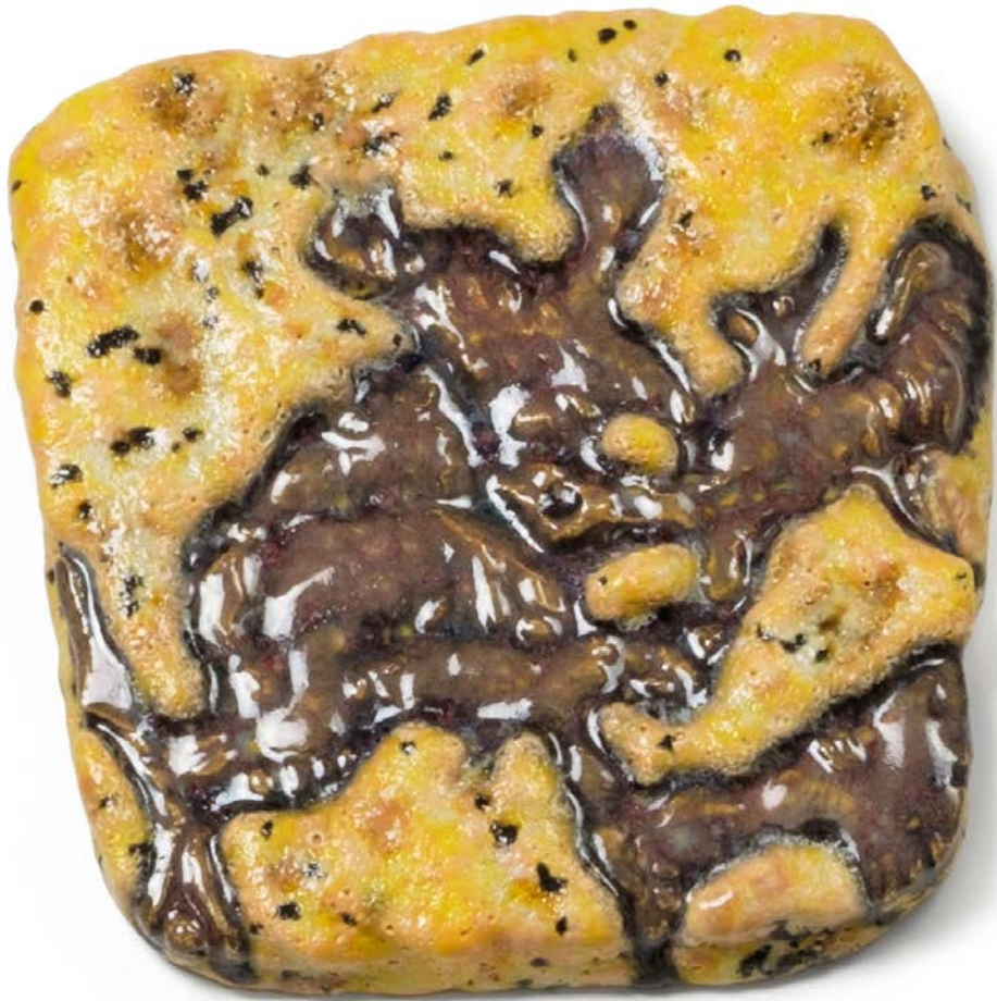
KINOROZOR, 2018 ceramic 15 x 15 x 2 cm 5.9 x 5.9 x 0.8 inches