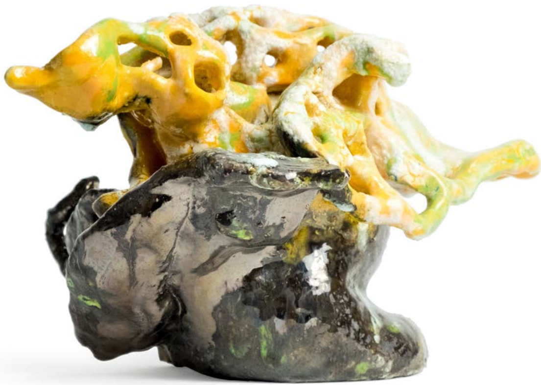
YEREWLUS, 2019 ceramic 16 x 24 x 26 cm 6.3 x 9.4 x 10.2 inches