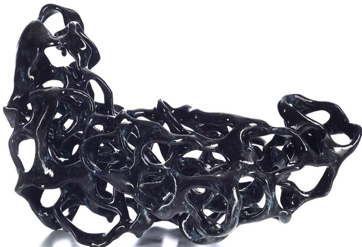
WALUCERUM , 2016 ceramic 31 x 48 x 32 cm 12,2 x 18,9 x 12,6 inches