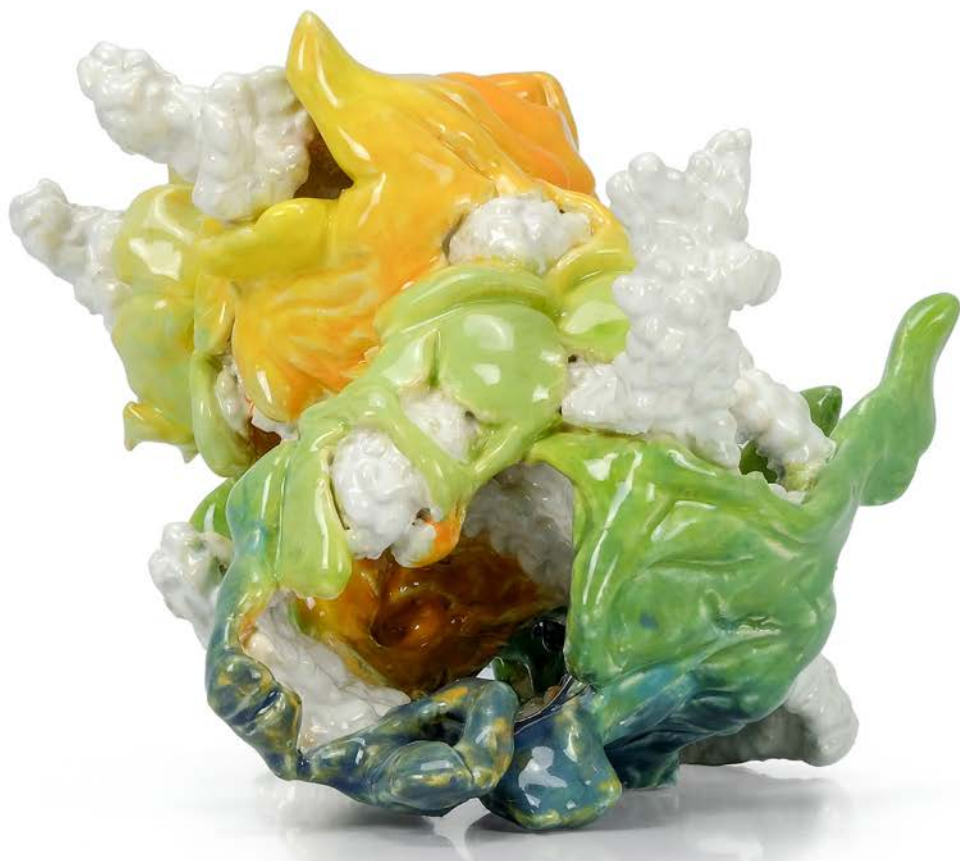
CROBOSLUM , 2017 - 2018