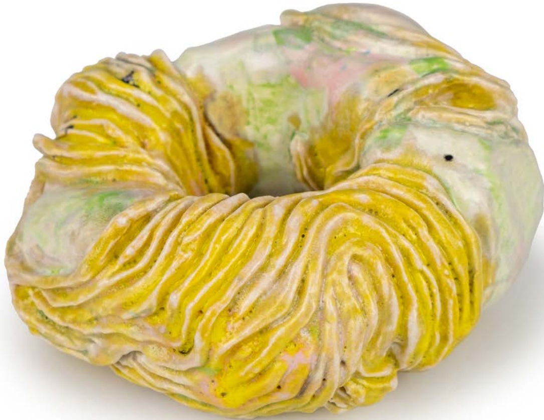
BOARIASO, 2022 ceramic 6,5 x 13,5 x 12 cm 2.6 x 5.3 x 4.7 inches