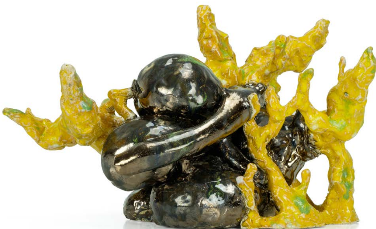
CELAOR , 2017 - 2018 ceramic 29 x 23 x 40 cm 11.4 x 9.1 x 15.7 inches