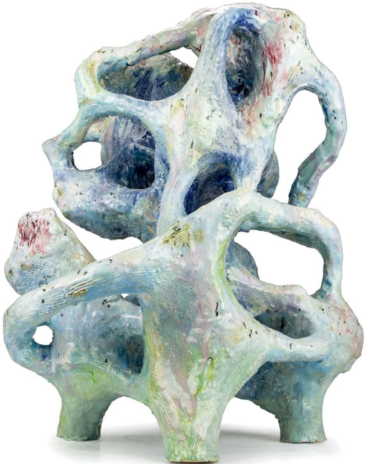
OEBERNASO, 2023 ceramic 59,5 x 45,5 x 39 cm 23.4 x 17.9 x 15.4 inches