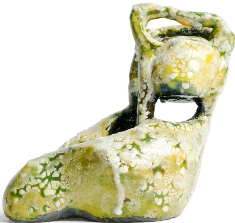
CELATSUR, 2019 ceramic 16 x 20 x 14 cm 6.3 x 7.9 x 5.5 inches