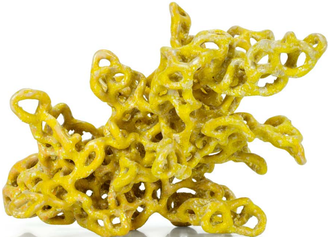
TIEWCEROM , 2017 - 2018 ceramic 22 x 24 x 37 cm 8.7 x 9.4 x 14.6 inches