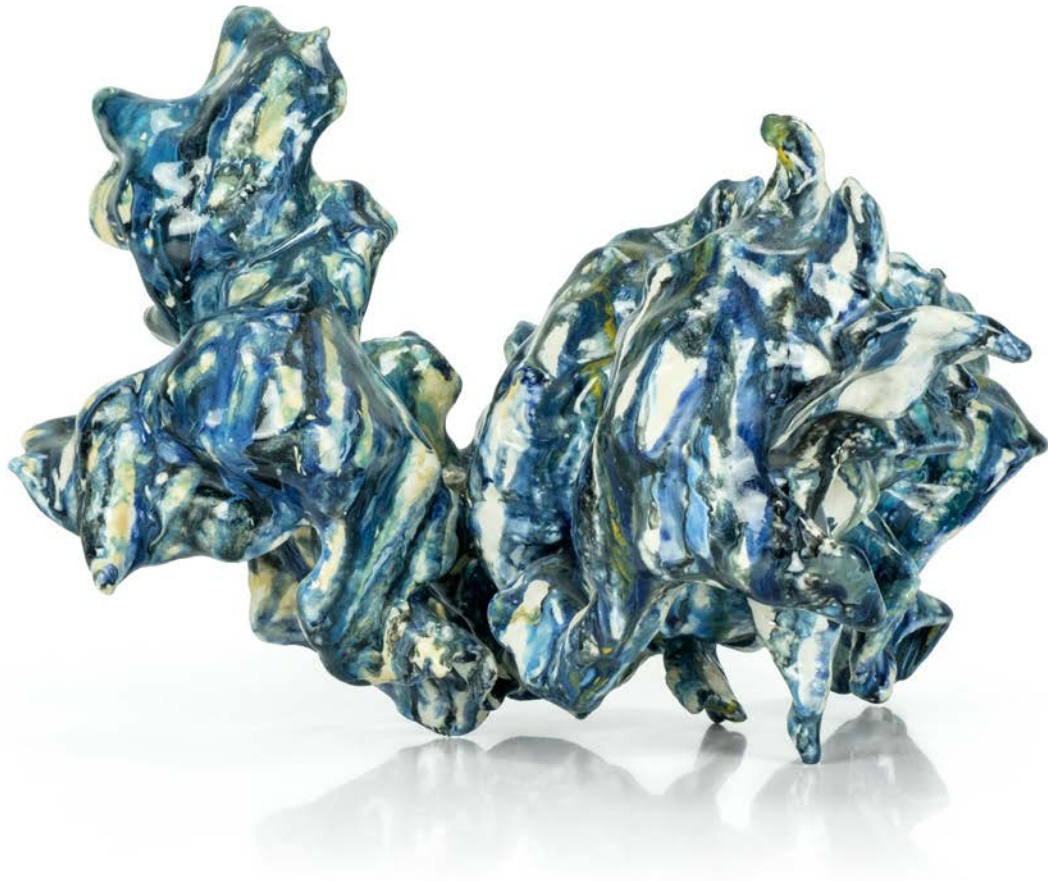
BALBIAAW , 2016 - 2017 ceramic 36 x 25 x 20 cm 14.2 x 9.8 x 7.9 inches