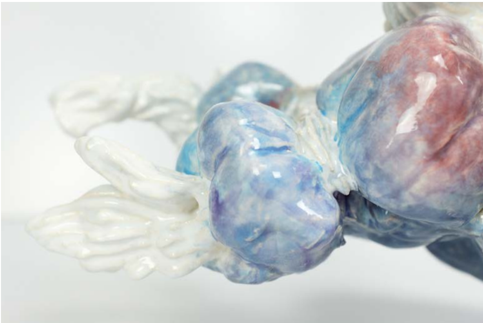
AKRINAP , 2017 - 2018 ceramic 19 x 23 x 23 cm 7.5 x 9.1 x 9.1 inches