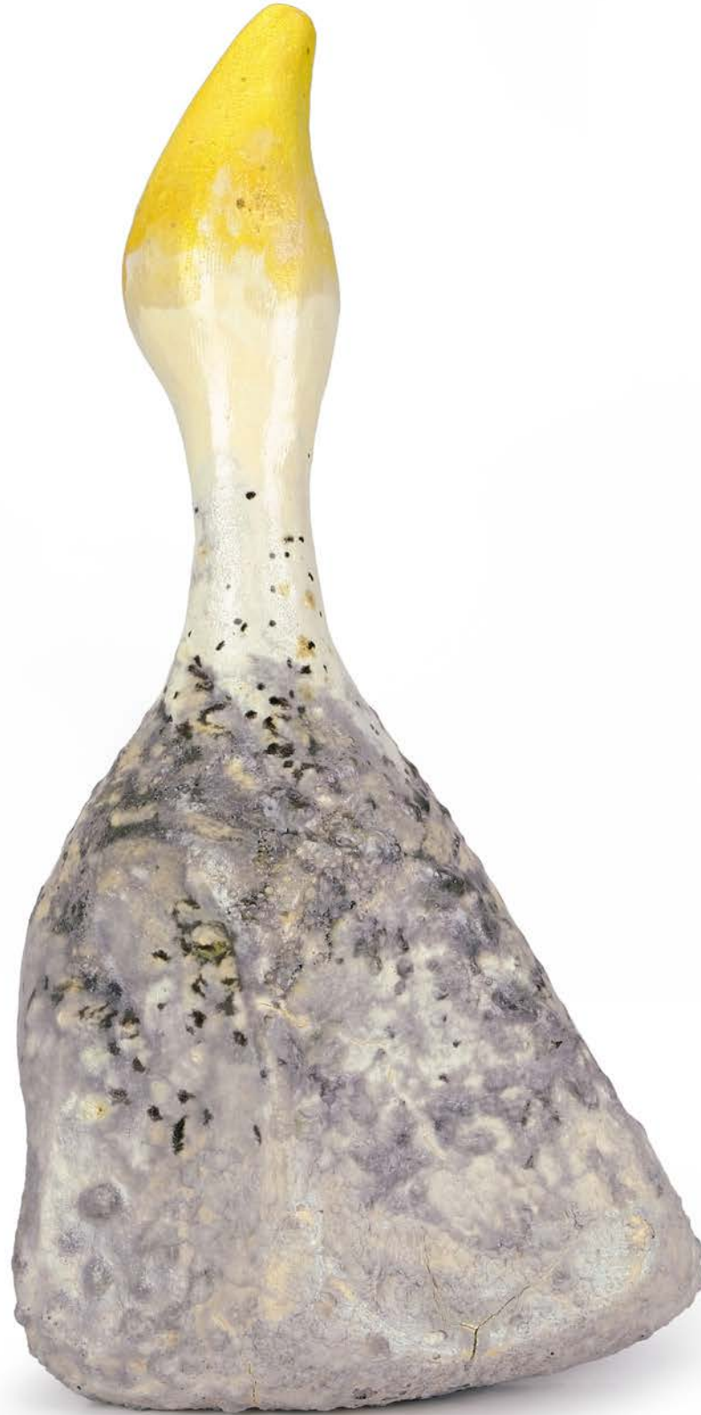
ENOORAYO, 2020 - 2021 Ceramic 64 x 30 x 22 cm 25.2 x 11.8 x 8.7 inches