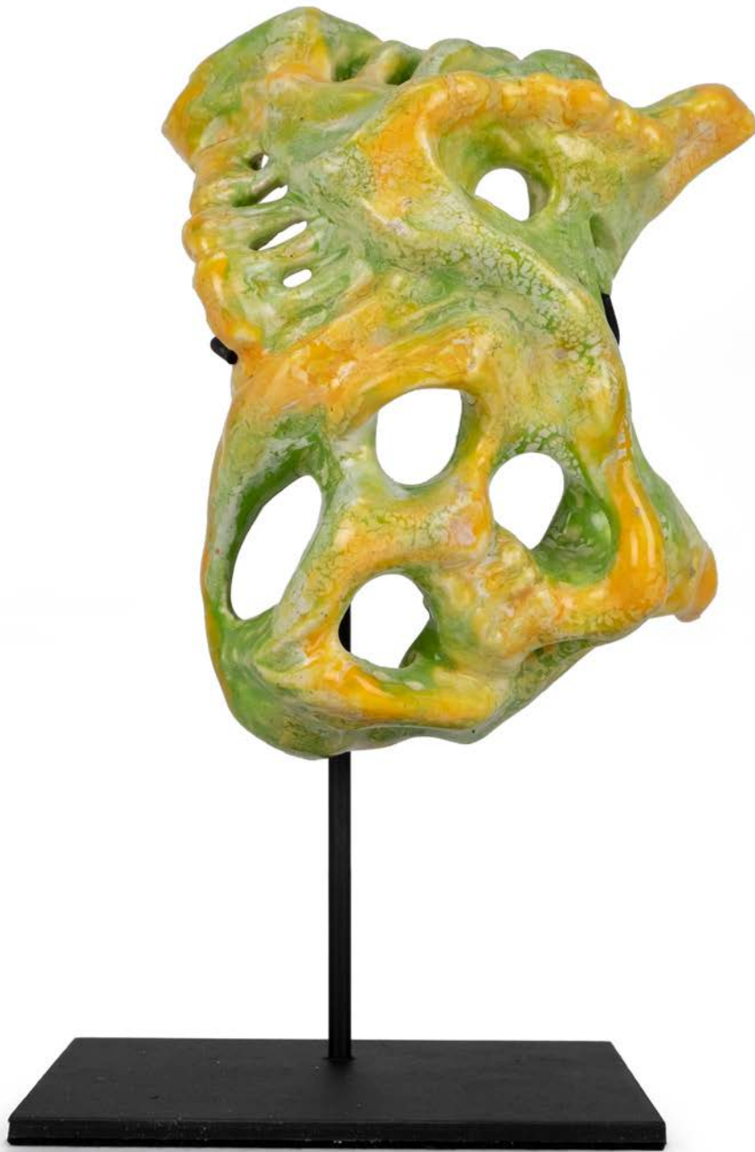
WIGNILAOS , 2020 - 2021 Ceramic 14 x 11 x 7 cm 5.5 x 4.3 x 2.7 inches