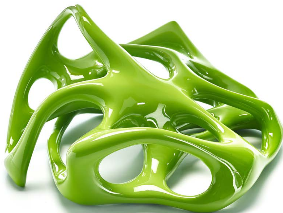
IEBLOCERUM , 2016 ceramic, polyester 16 x 30 x 31 cm 6,3 x 11,8 x 12,2 inches