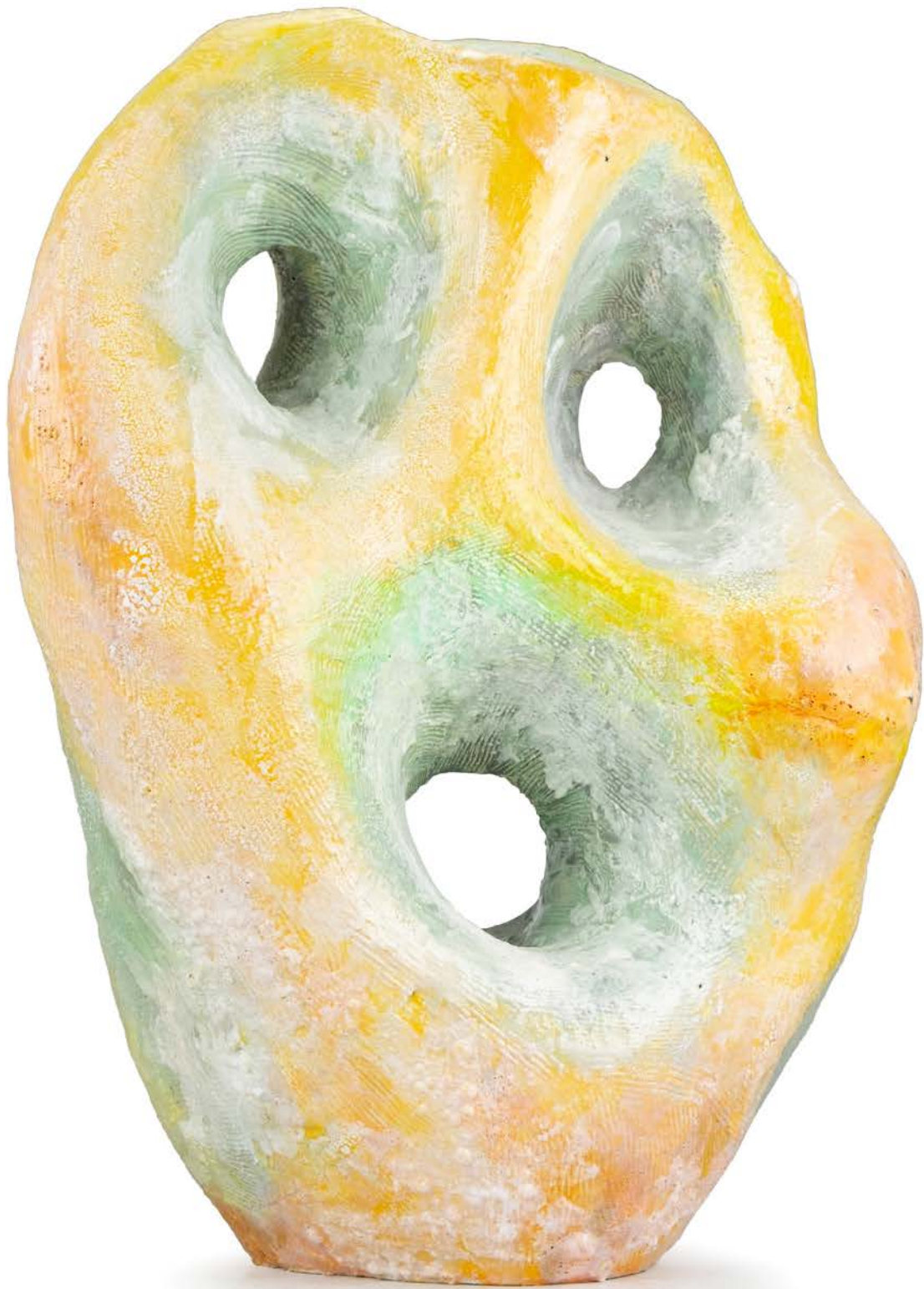
ELLEIVIOS, 2023 ceramic 61 x 44 x 34,5 cm 24 x 17.3 x 13.6 inches