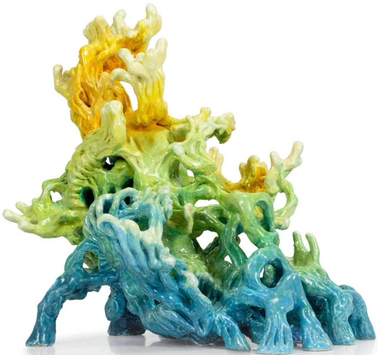
BRUNTISFA , 2017 - 2018 ceramic 38 x 38 x 33 cm 15 x 15 x 13 inches