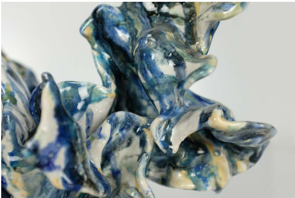
detail BALBIAAW , 2016 - 2017 ceramic 36 x 25 x 20 cm 14.2 x 9.8 x 7.9 inches