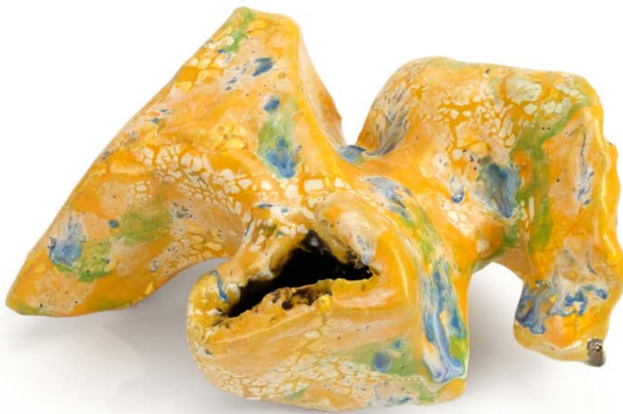
SEJILF , 2017 ceramic 10 x 21 x 15 cm 3.9 x 8.3 x 5.9 inches