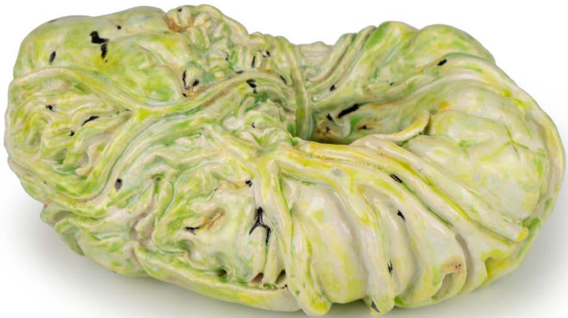
BOARIARI, 2022 ceramic 7,5 x 16 x 9,5 cm 3 x 6.3 x 3.7 inches