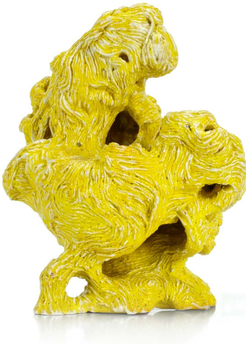
CORBOLEG, 2017 ceramic 24 x 22 x 23 cm 9.4 x 8.7 x 9.1 inches