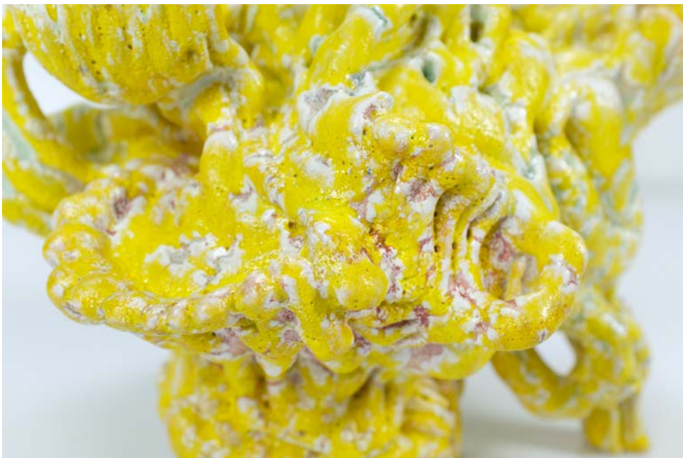
detail BRUNTUSLIE , 2018 ceramic 35 x 35 x 35 cm 13.8 x 13.8 x 13.8 inches