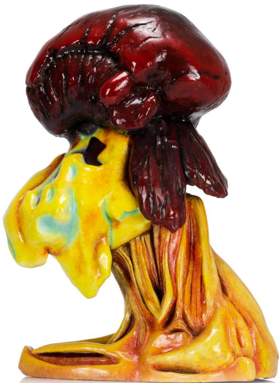
WEHIARB , 2015 - 2016 ceramic 30 x 18 x 42 cm 11.8 x 7.1 x 16.5 inches