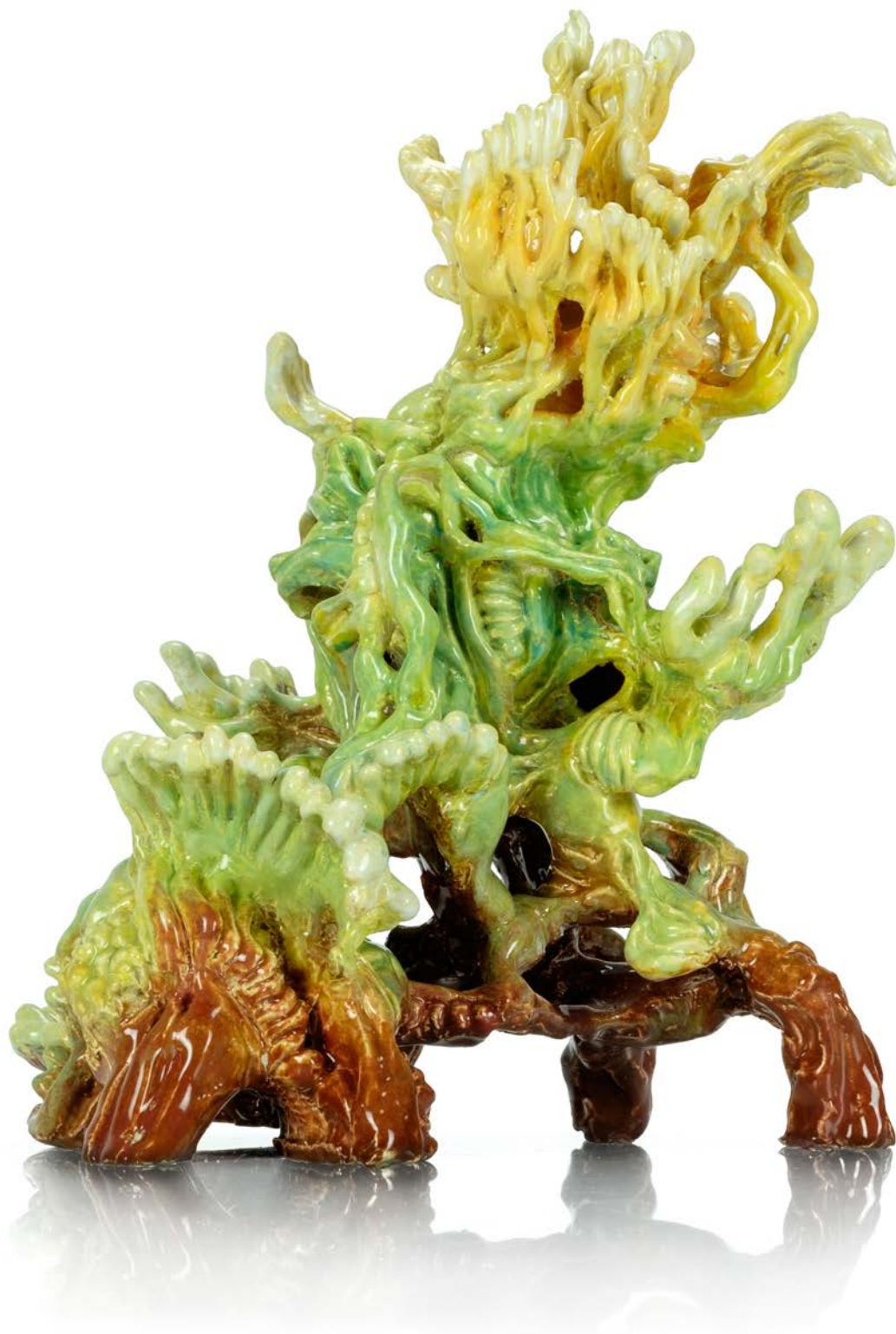
BRUNTUSKI, 2017 - 2018 ceramic 39 x 35 x 32 cm 15.4 x 13.8 x 12.6 inches