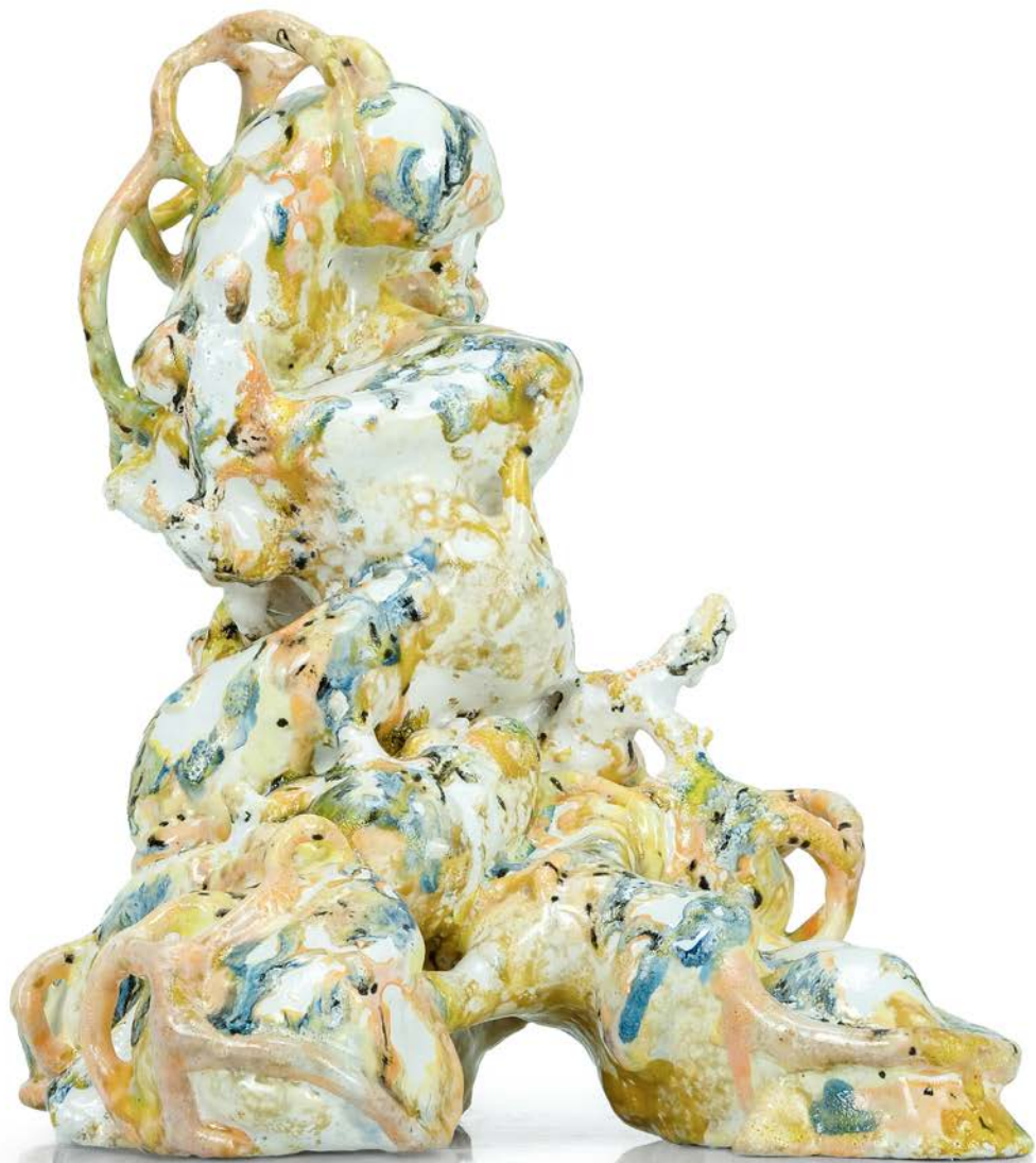
BOBNARAK , 2016 - 2017 ceramic 33 x 27 x 25 cm 13 x 10.6 x 9.8 inches