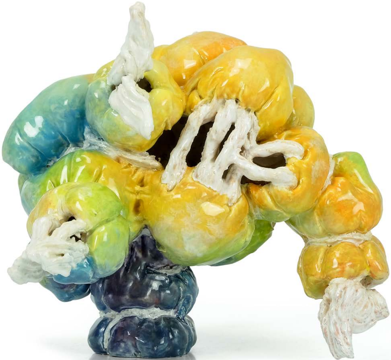
AKRIMUT, 2017 ceramic 25 x 23 x 25 cm 9.8 x 9.1 x 9.8 inches