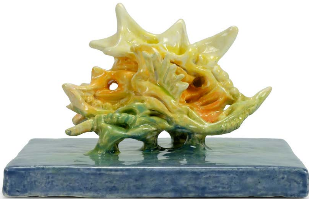
MINOTERKER , 2017 ceramic 15 x 12.5 x 9 cm 5.9 x 4.9 x 3.5 inches