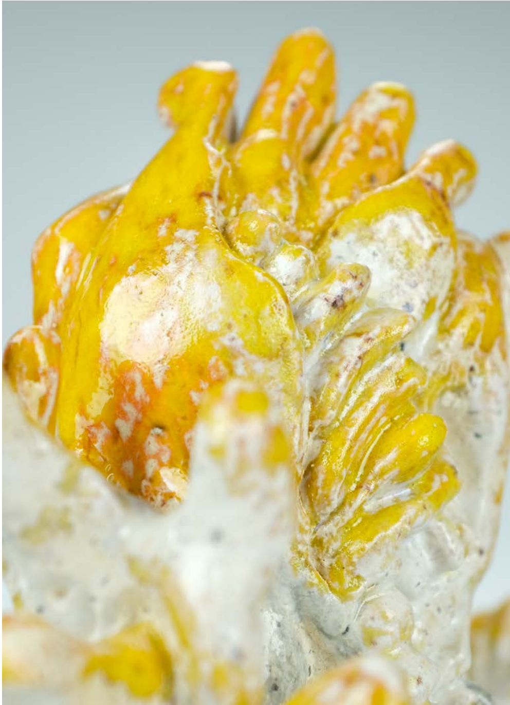
detail BRUNTISKIE , 2017 - 2018 ceramic 29 x 26 x 30 cm 11.4 x 10.2 x 11.8 inches