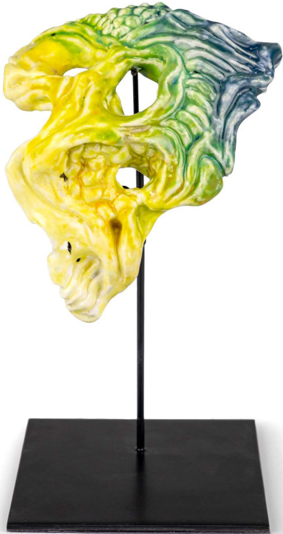
WIGNISOROM, 2022 ceramic 19 x 11,5 x 10 cm 7.4 x 4.5 x 3.9 inches