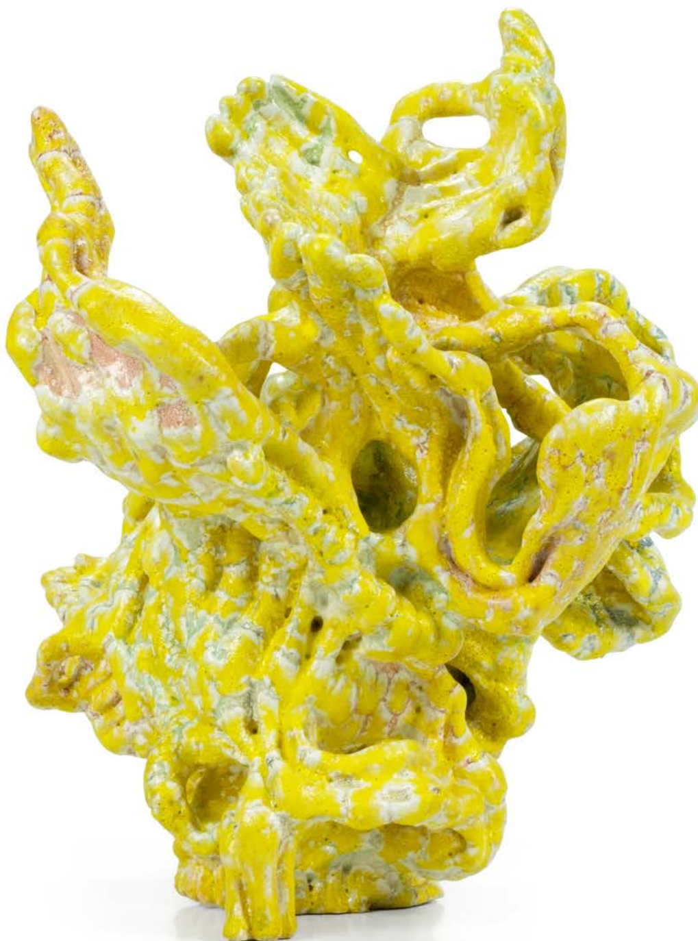
BRUNTUSLIE , 2018 ceramic 35 x 35 x 35 cm 13.8 x 13.8 x 13.8 inches