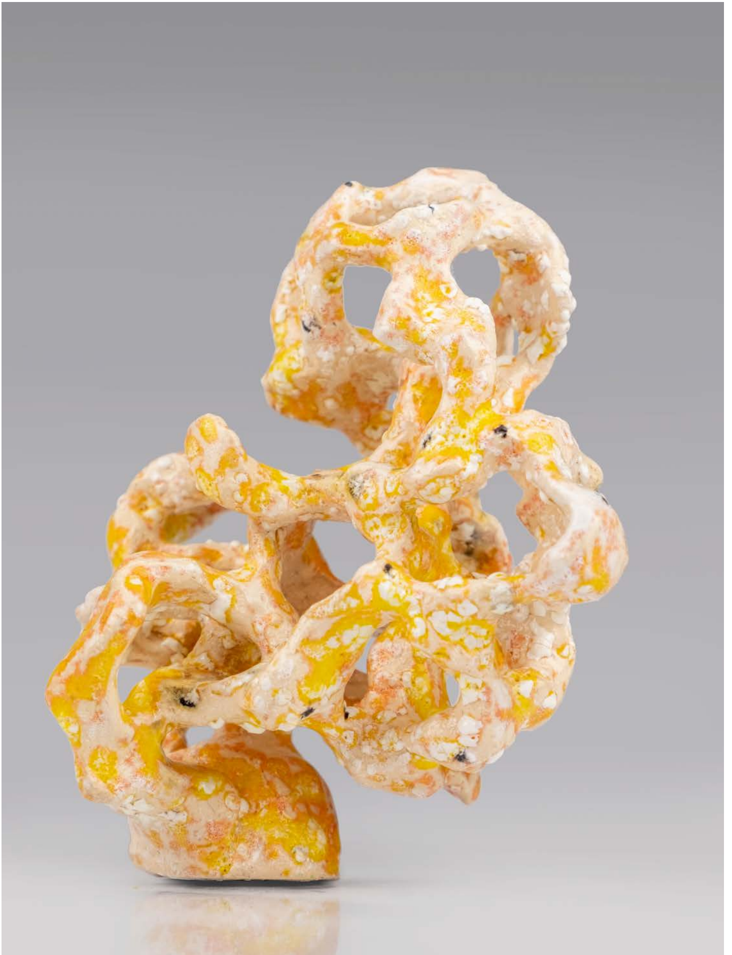
LEGUCIOUS, 2022 ceramic 17,5 x 13 x 10,5 cm 6.9 x 5 x 4 inches