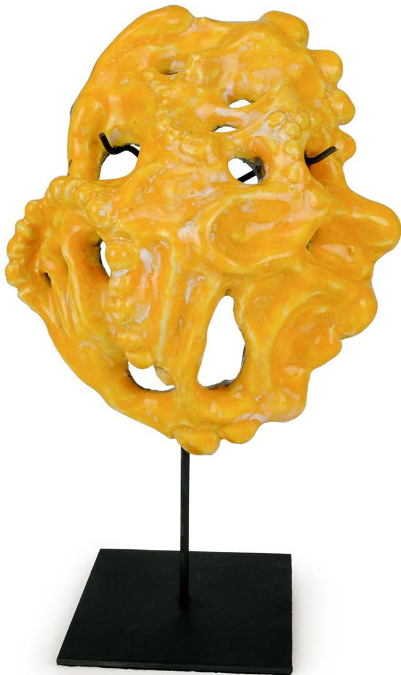
WIGNIRAPS , 2020 - 2021 Ceramic 18,5 x 16,5 x 11 cm 7.3 x 6.5 x 4.3 inches