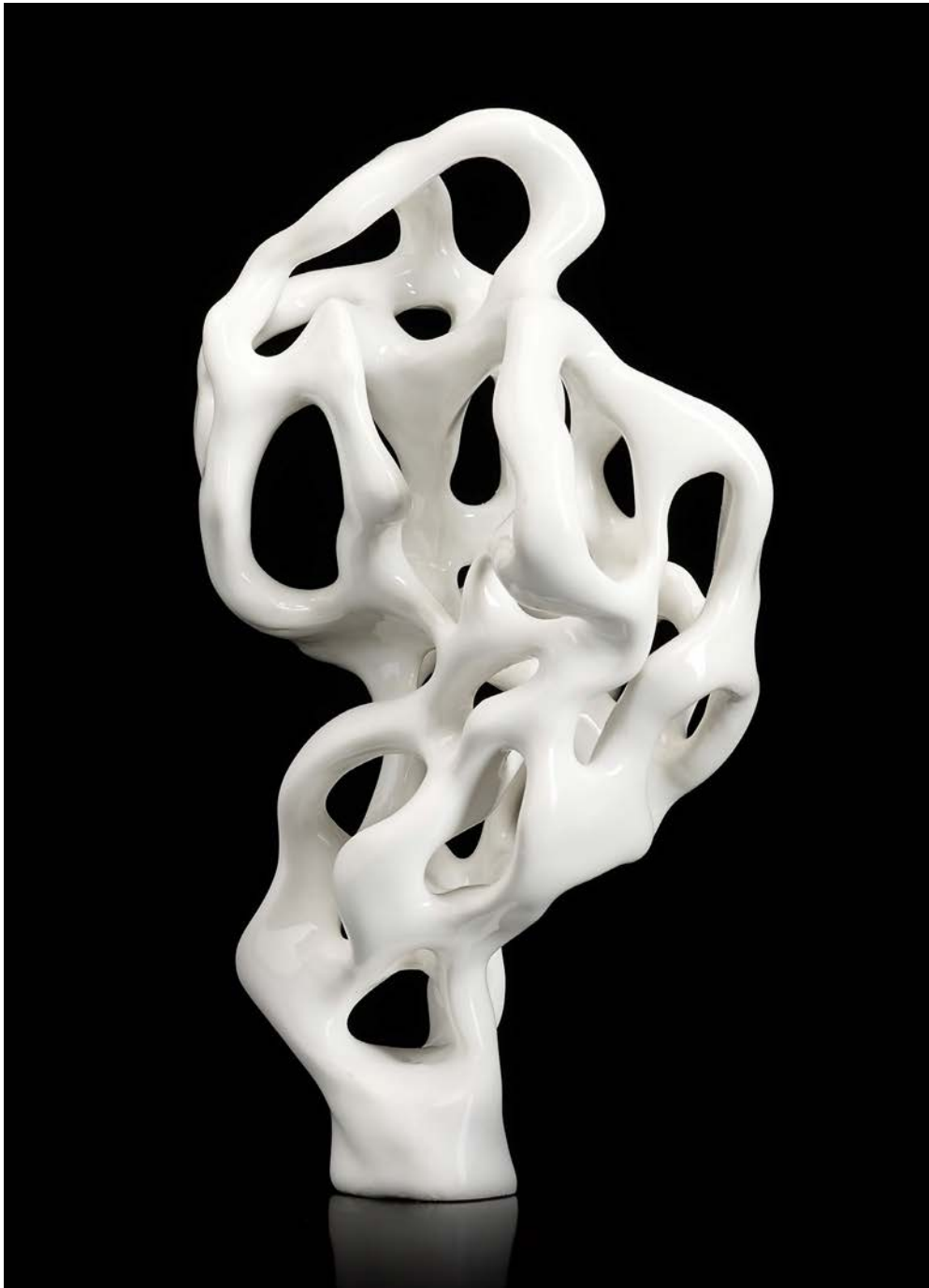
LEGUCERI, 2016 ceramic 20 x 12 x 9 cm 7.9 x 4.7 x 3.5 inches