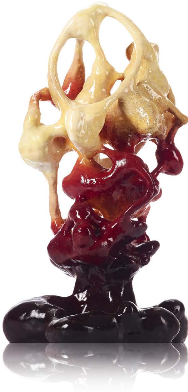
ENOPIH , 2016 ceramic 53 x 32 x 26 cm 20.9 x 12.6 x 10.2 inches