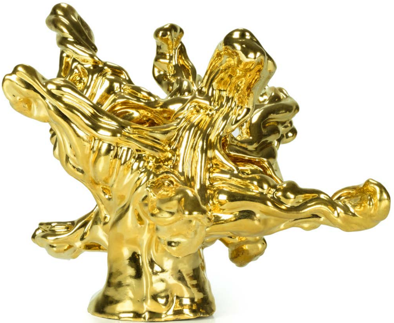
CORLUPIAN , 2016 - 2018 ceramic 27 x 35 x 32 cm 10.6 x 13.8 x 12.6 inches