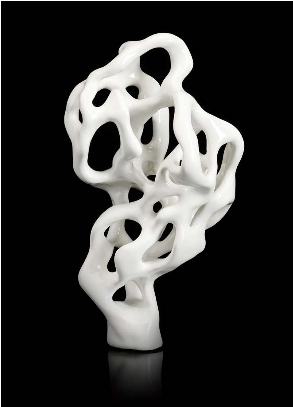
LEGUCERI, 2016 ceramic 20 x 12 x 9 cm 7,9 x 4,7 x 3,5 inches