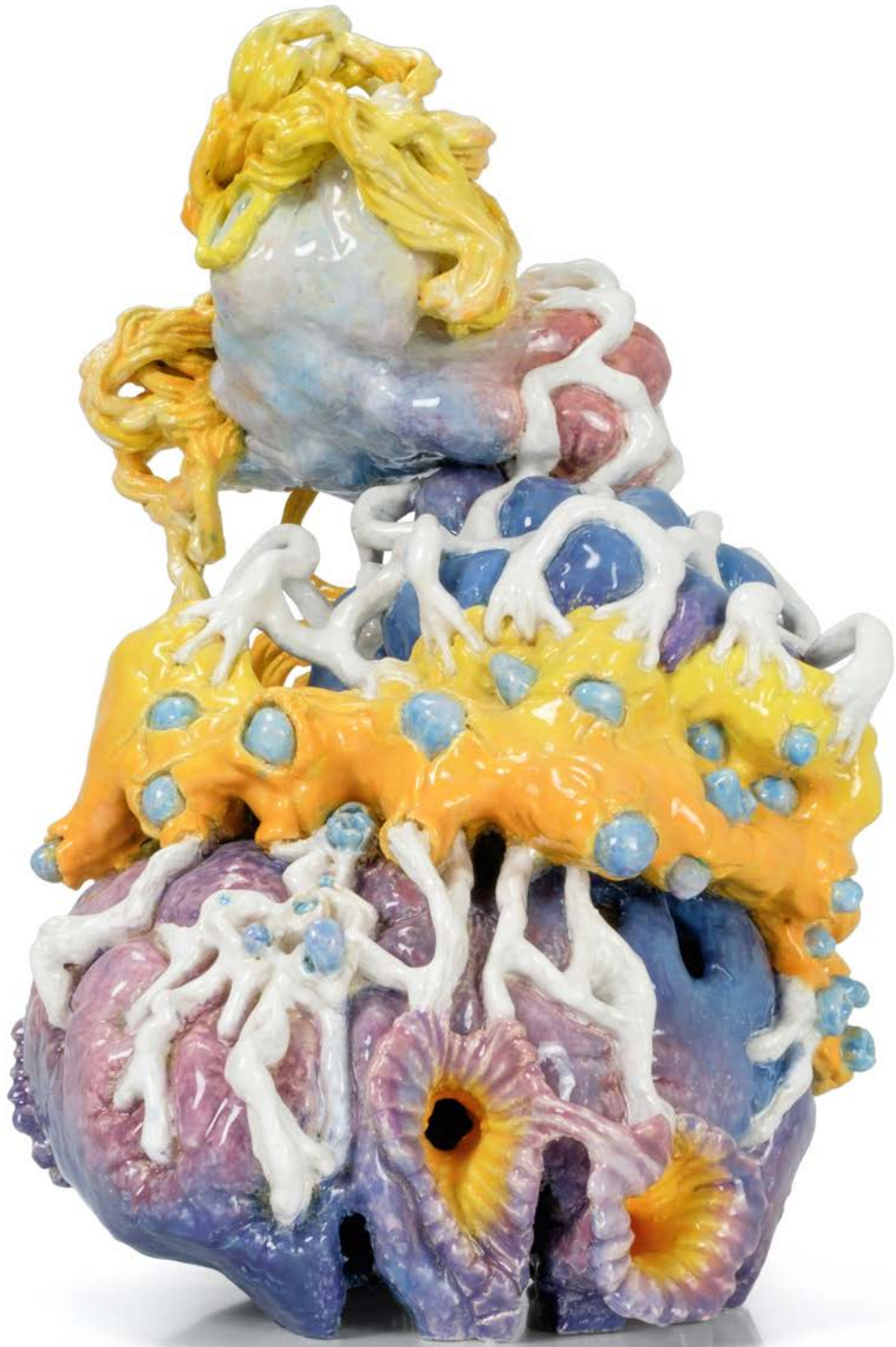
AKRITANET , 2017 - 2018 ceramic 49 x 38 x 30 cm 19.3 x 15 x 11.8 inches