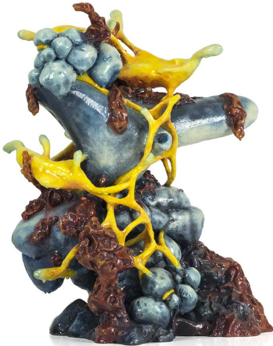
RAKNETOW , 2016 - 2017 ceramic 45 x 30 x 54 cm 17.7 x 11.8 x 21.3 inches