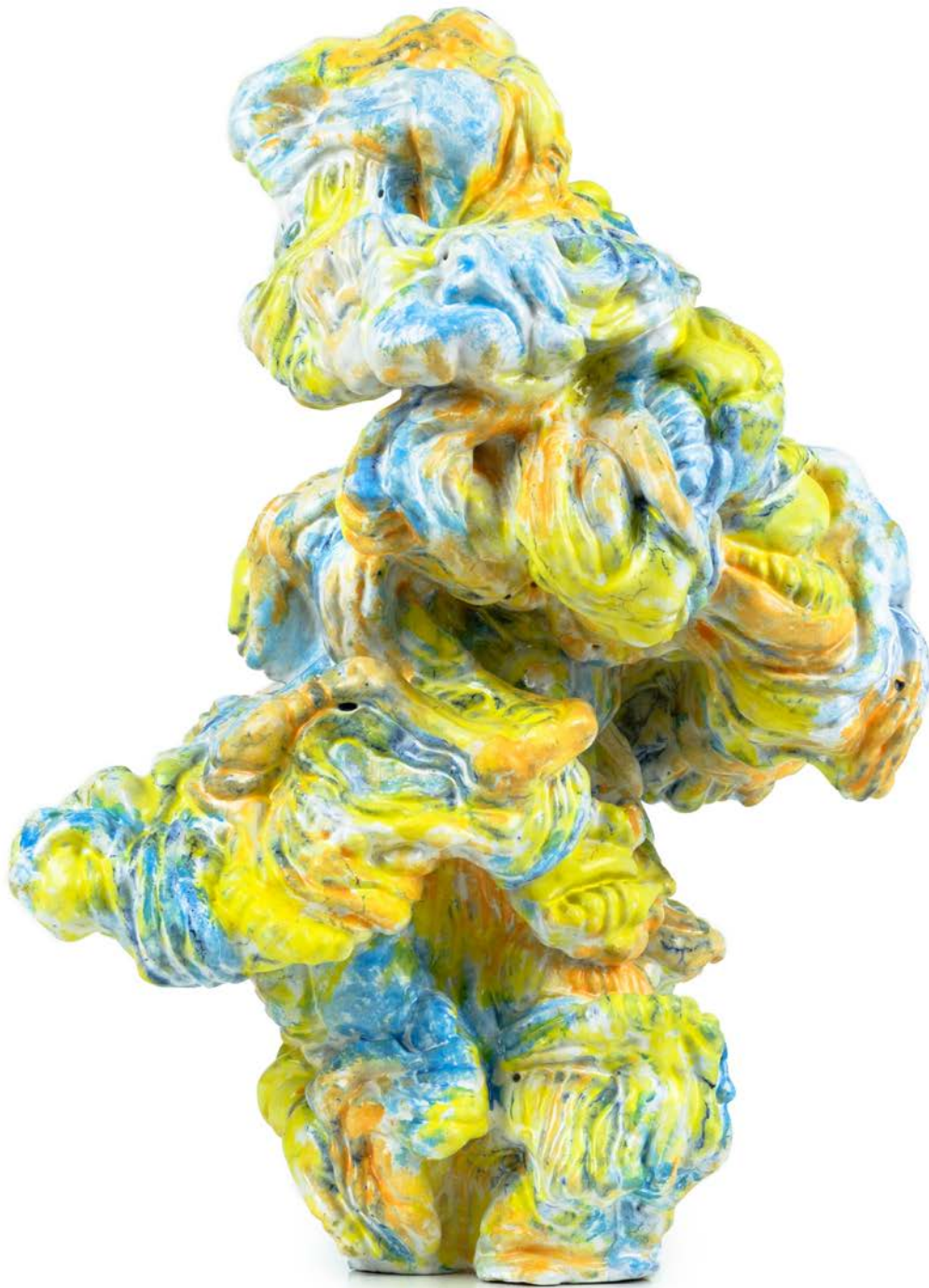
COREWOLU , 2015 - 2017 ceramic 41 x 25 x 28 cm 16.1 x 9.8 x 11 inches