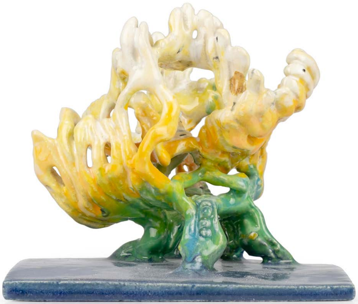
MINOTERSARIO, 2022 ceramic 13,7 x 15,5 x 12 cm 5.4 x 6 x 4.7 inches