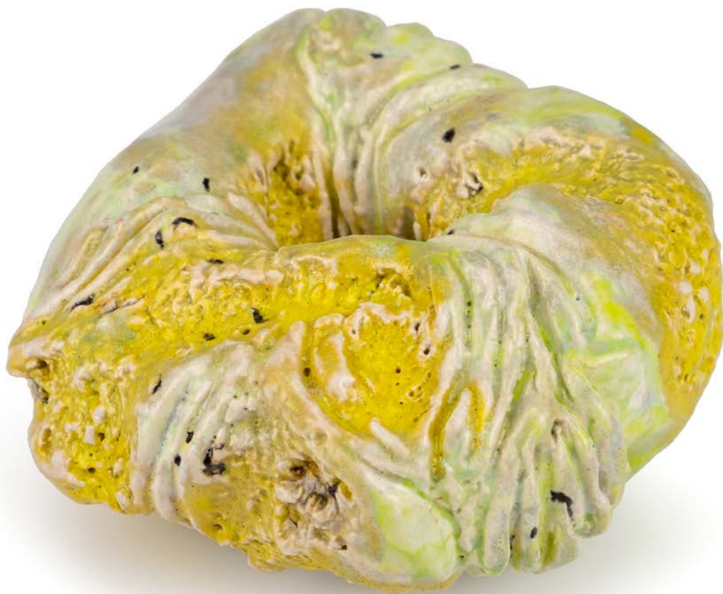
BOARIUSA, 2022 ceramic 7 x 13 x 12 cm 2.7 x 5.1 x 4.7 inches