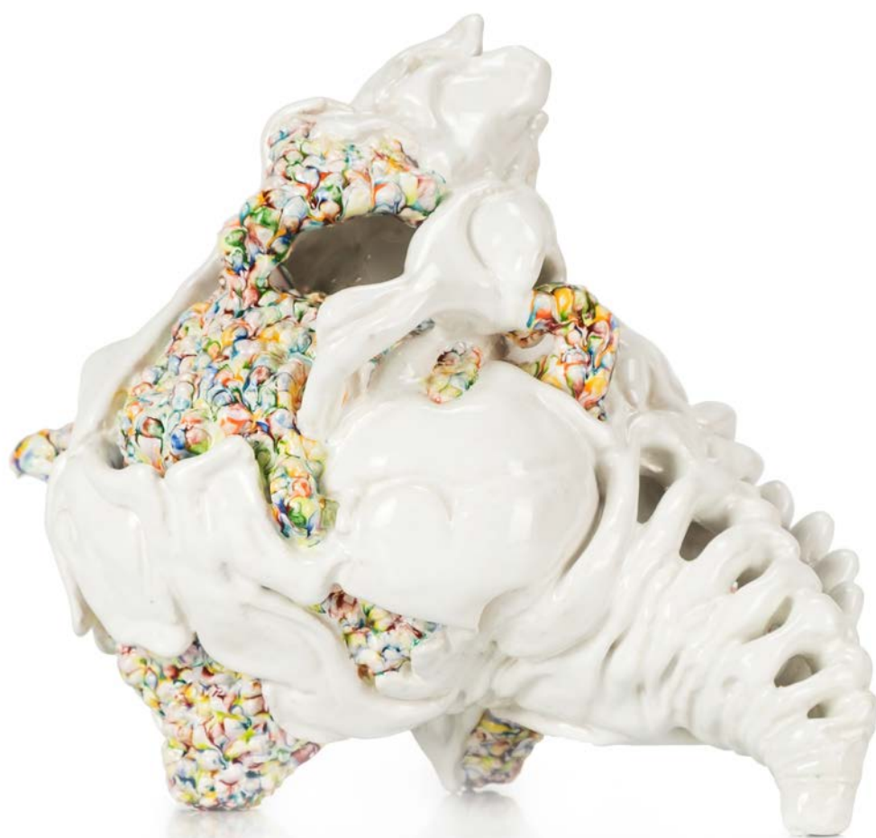
ENTUNAP , 2017 ceramic, 28 x 20 x 21 cm 11 x 7,9 x 8,3 inches