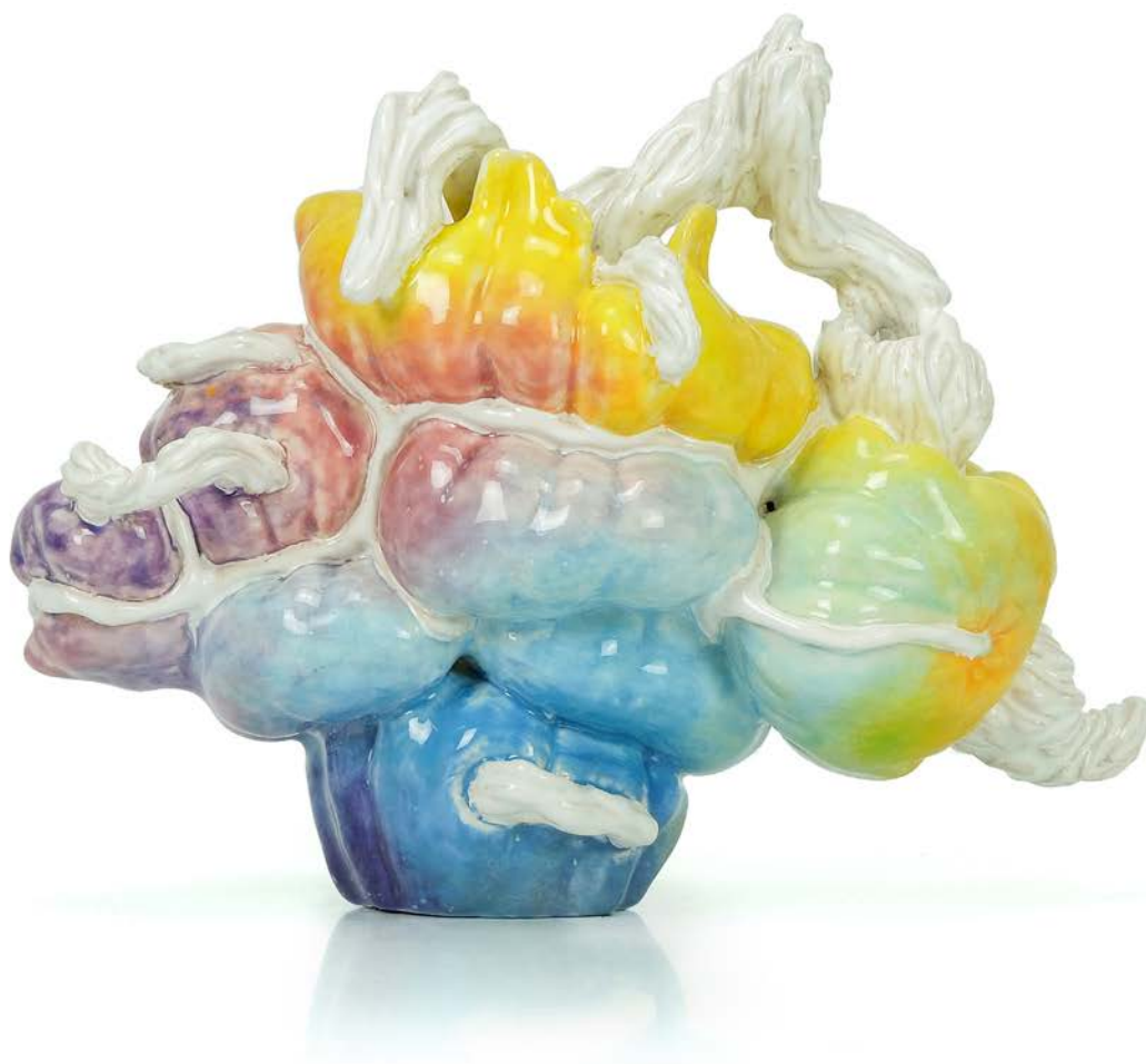
AKRIAMOTA , 2015 ceramic 16 x 13 x 21 cm 6.3 x 5.1 x 8.3 inches