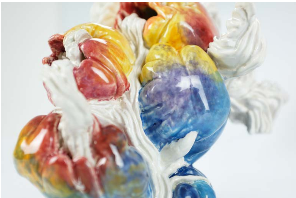
detail AKRINAP , 2017 - 2018 ceramic 19 x 23 x 23 cm 7.5 x 9.1 x 9.1 inches