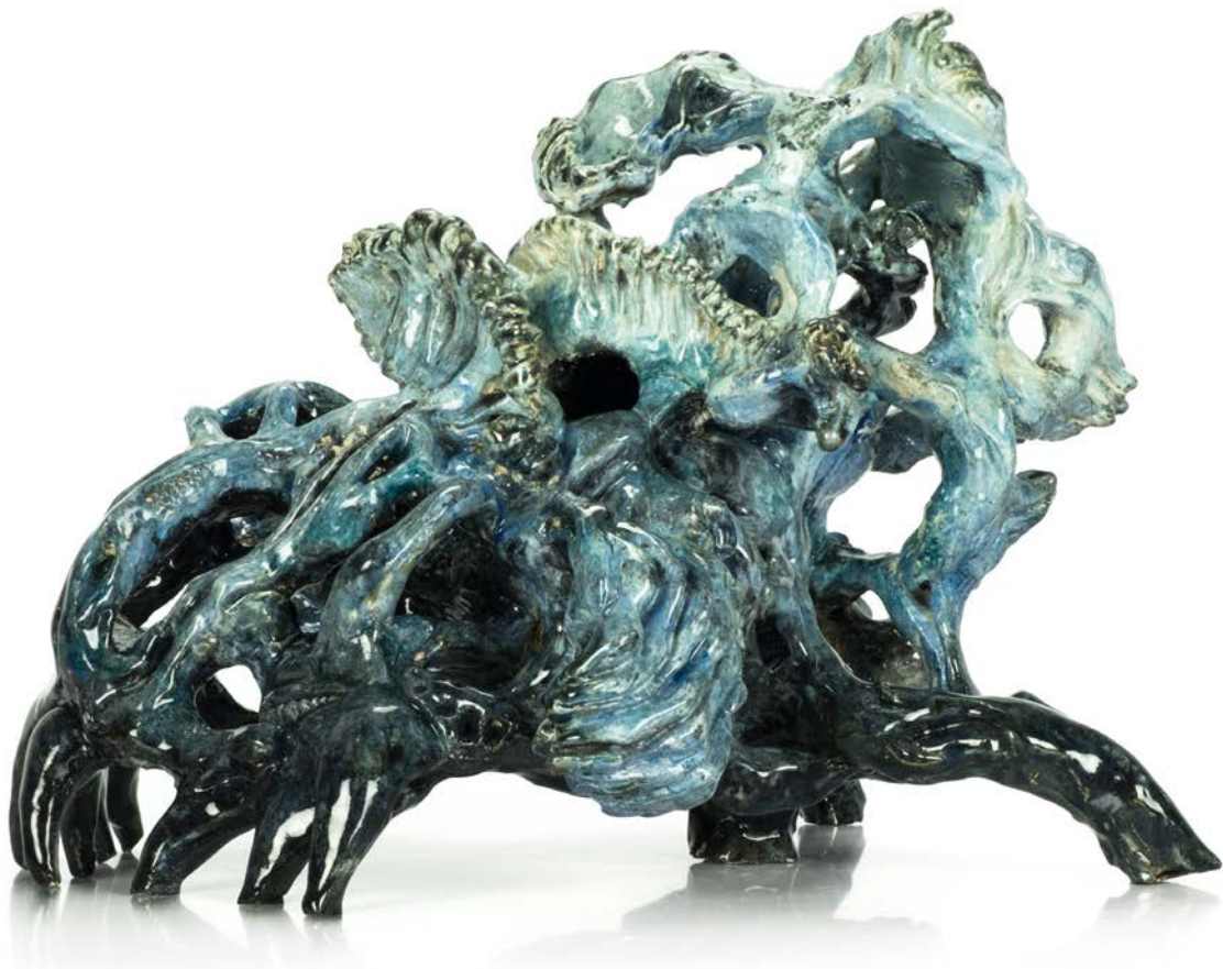
BRUNTUSKE, 2017 - 2018 ceramic 27 x 35 x 29 cm 10.6 x 13.8 x 11.4 inches