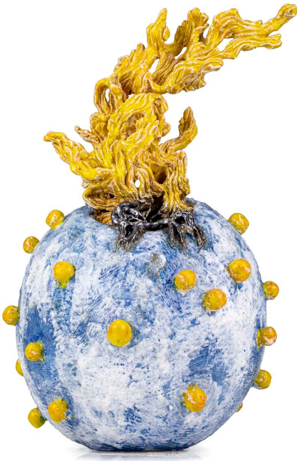
CROBOSLAES , 2022-2023 ceramic 45,5 x 29 x 28,5 cm 18 x 11.4 x 11.2 inches