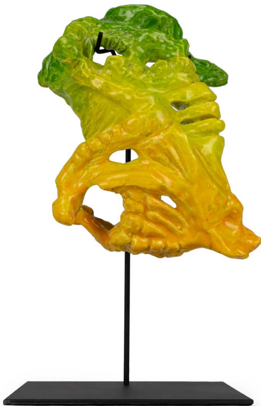
WIGNIRIAS , 2020 - 2021 Ceramic 20,5 x 15 x 13 cm 8 x 6 x 5 inches