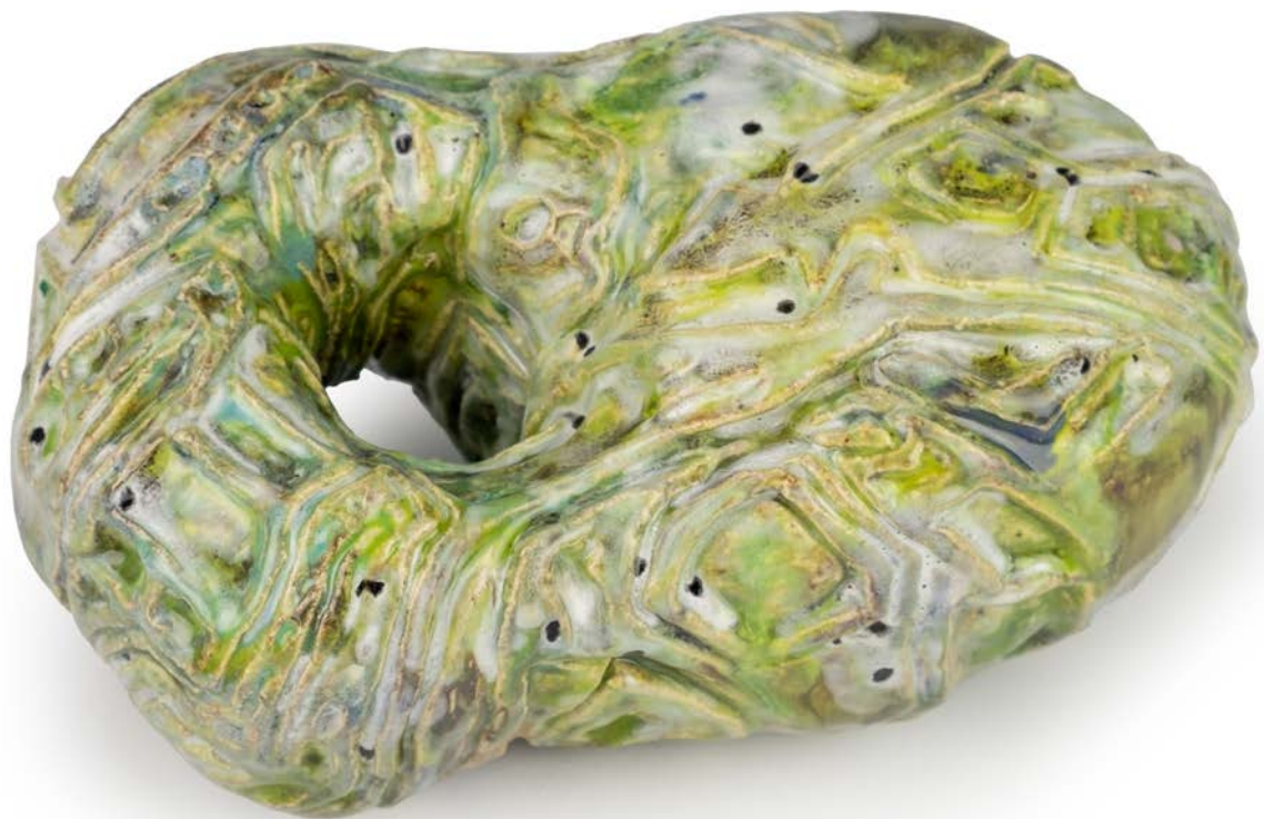
BOARIAKO, 2022 ceramic 9 x 17,2 x 11 cm 3.5 x 6.8 x 4.3 inches