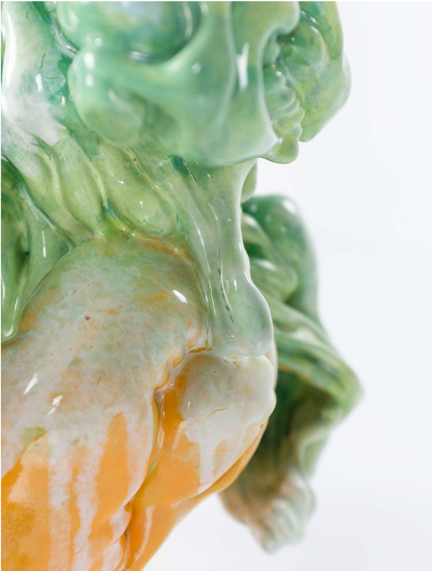
detail COREWOLI , 2016 - 2018 ceramic 31 x 25 x 28 cm 12.2 x 9.8 x 11 inches