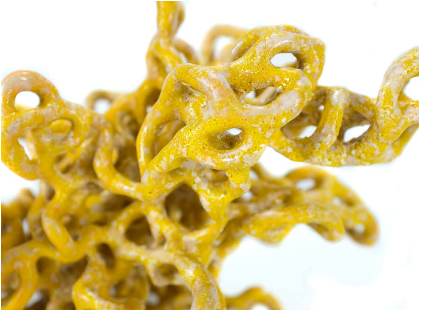
detail TIEWCEROM , 2017 - 2018 ceramic 22 x 24 x 37 cm 8.7 x 9.4 x 14.6 inches