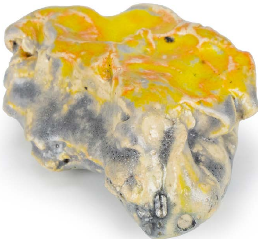
KINOTANARI , 2020 - 2021 Ceramic 4 x 10,5 x 8 cm 1.6 x 4.1 x 3.1 inches