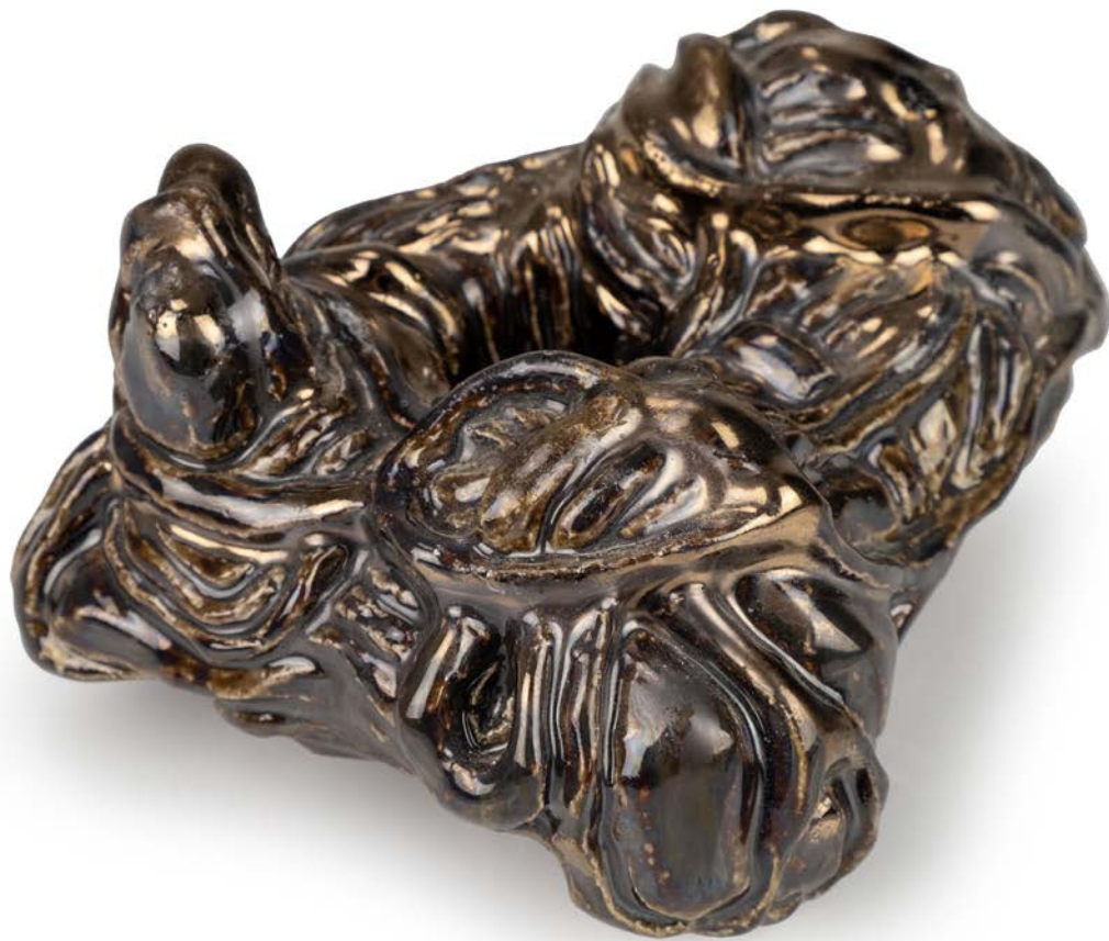
BOARIATERKS, 2022 ceramic 8 x 14,5 x 13 cm 3.1 x 5.7 x 5.1 inches