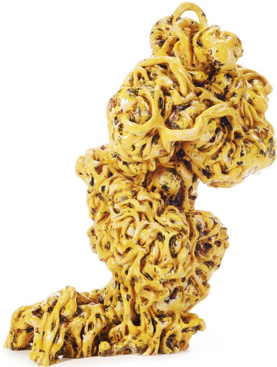
ENKANSOR, 2016 Ceramic 57 x 40 x 34 cm 22,4 x 15,7 x 13,4 inches