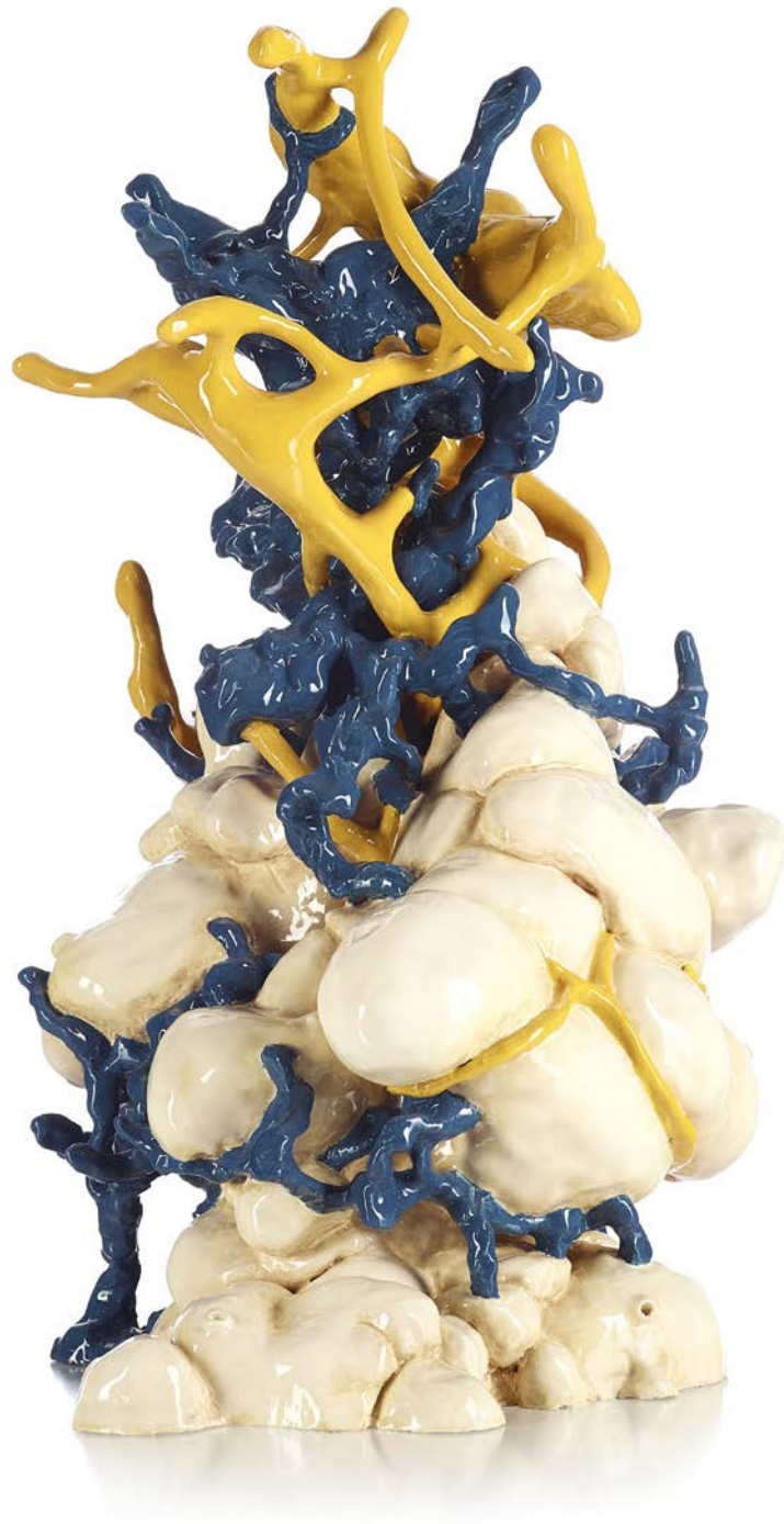
MANOWTID , 2016 Ceramic 50 x 30 x 35 cm 19,7 x 11,8 x 13,8 inches