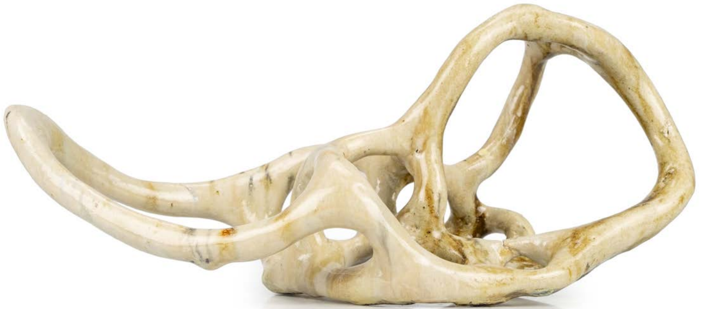
IEBLOCERIOCA, 2022 ceramic 15,5 x 35 x 15 cm 6 x 13.8 x 5.9 inches