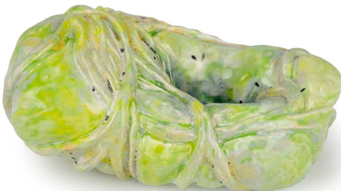
BOARIOS, 2022 ceramic 7,5 x 16,5 x 10 cm 3 x 6.5 x 3.9 inches