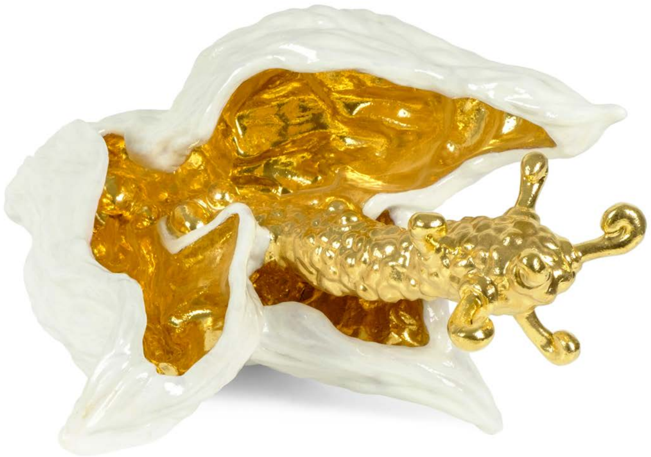
NABOACOR , 2016 - 2017 ceramic 45 x 35 x 25 cm 17.7 x 13.8 x 9.8 inches