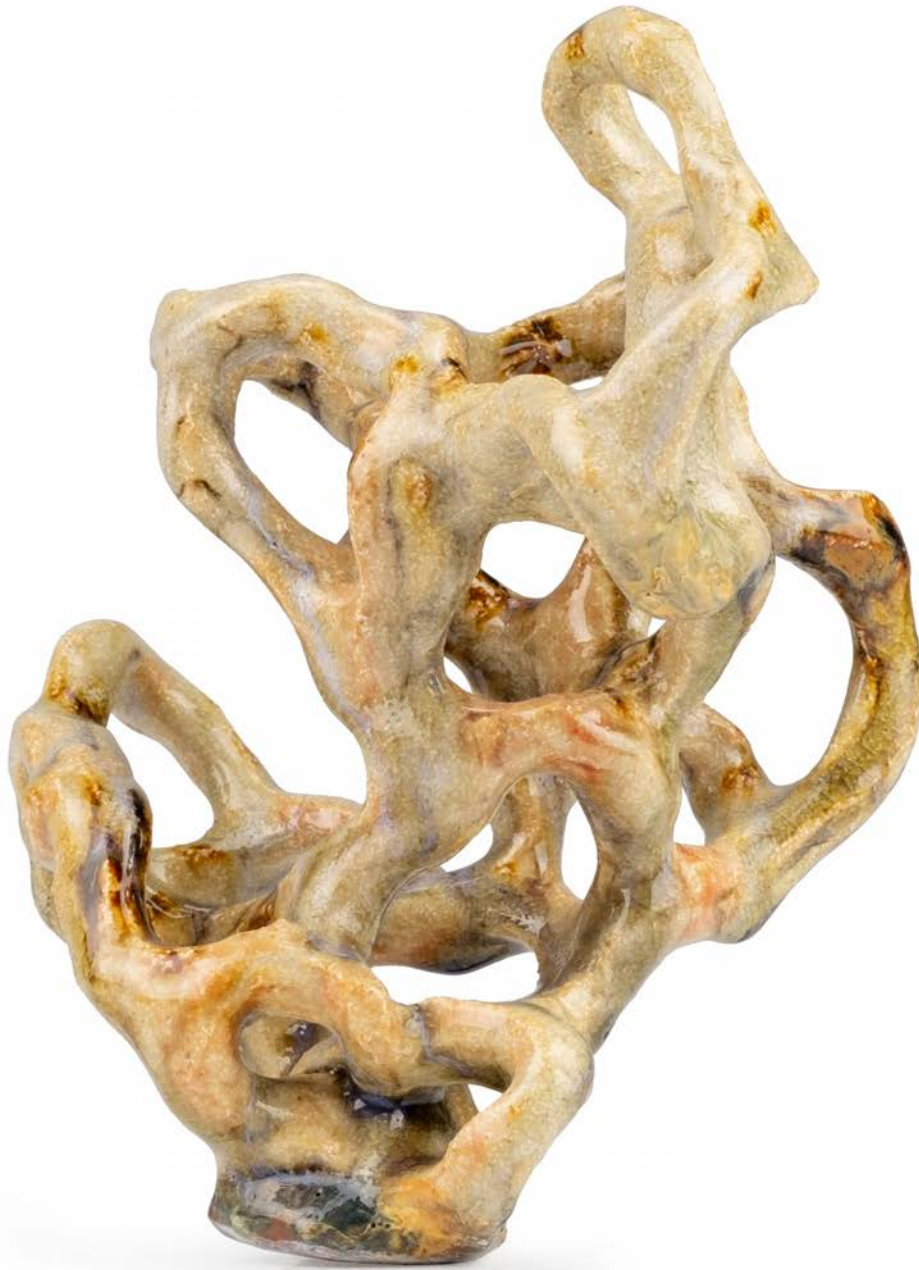
LEGUCIARU, 2022 ceramic 16 x 15,5 x 10,5 cm 6.3 x 6 x 4 inches