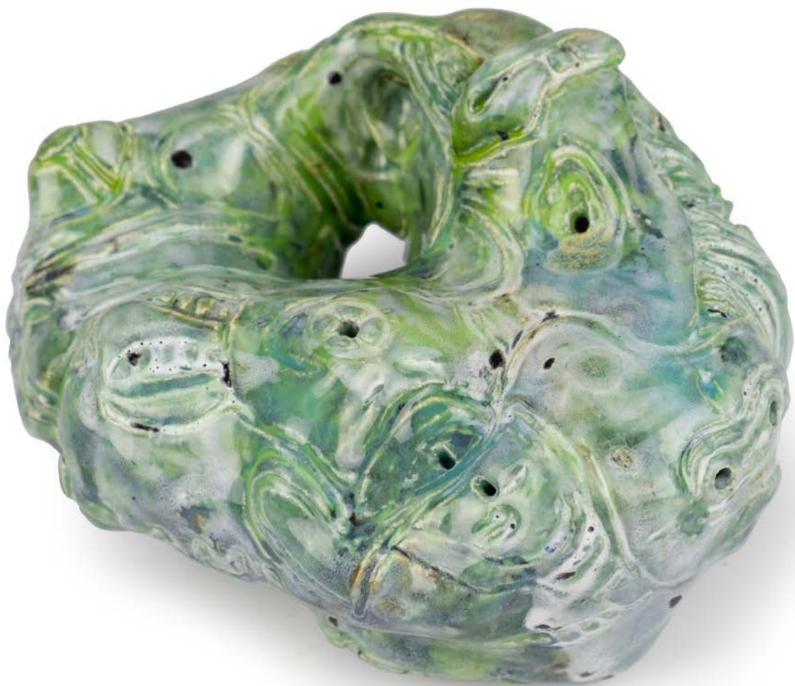
BOARIASAM, 2022 ceramic 9 x 15 x 12,5 cm 3.5 x 5.9 x 4.9 inches