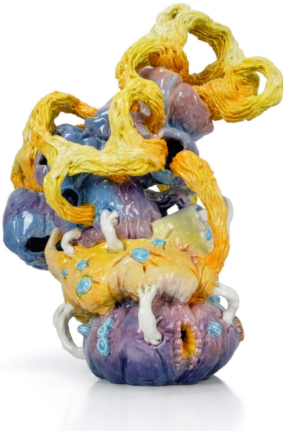
AKRITANOT , 2018 ceramic 65 x 55 x 45 cm 25.6 x 21.7 x 17.7 inches