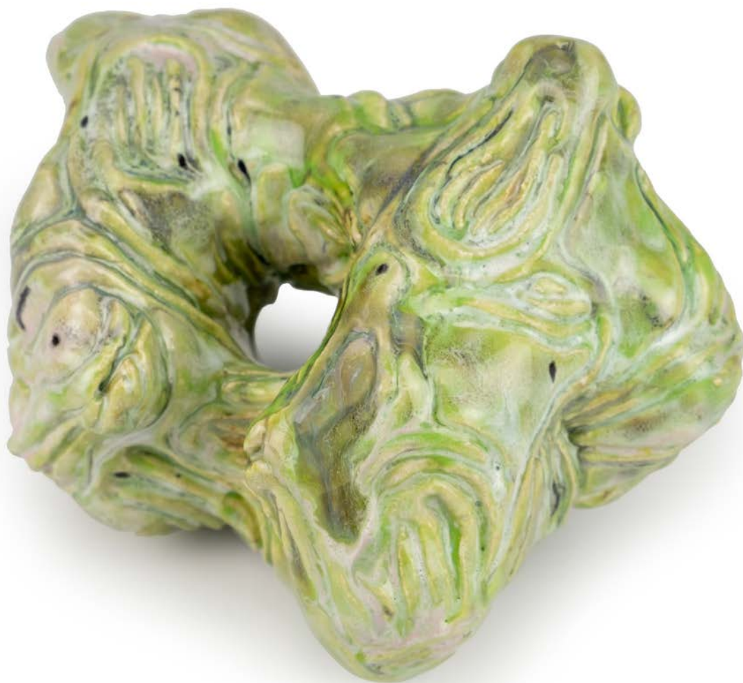
BOARITER, 2022 ceramic 10,5 x 16,5 x 10 cm 4 x 6.5 x 3.9 inches