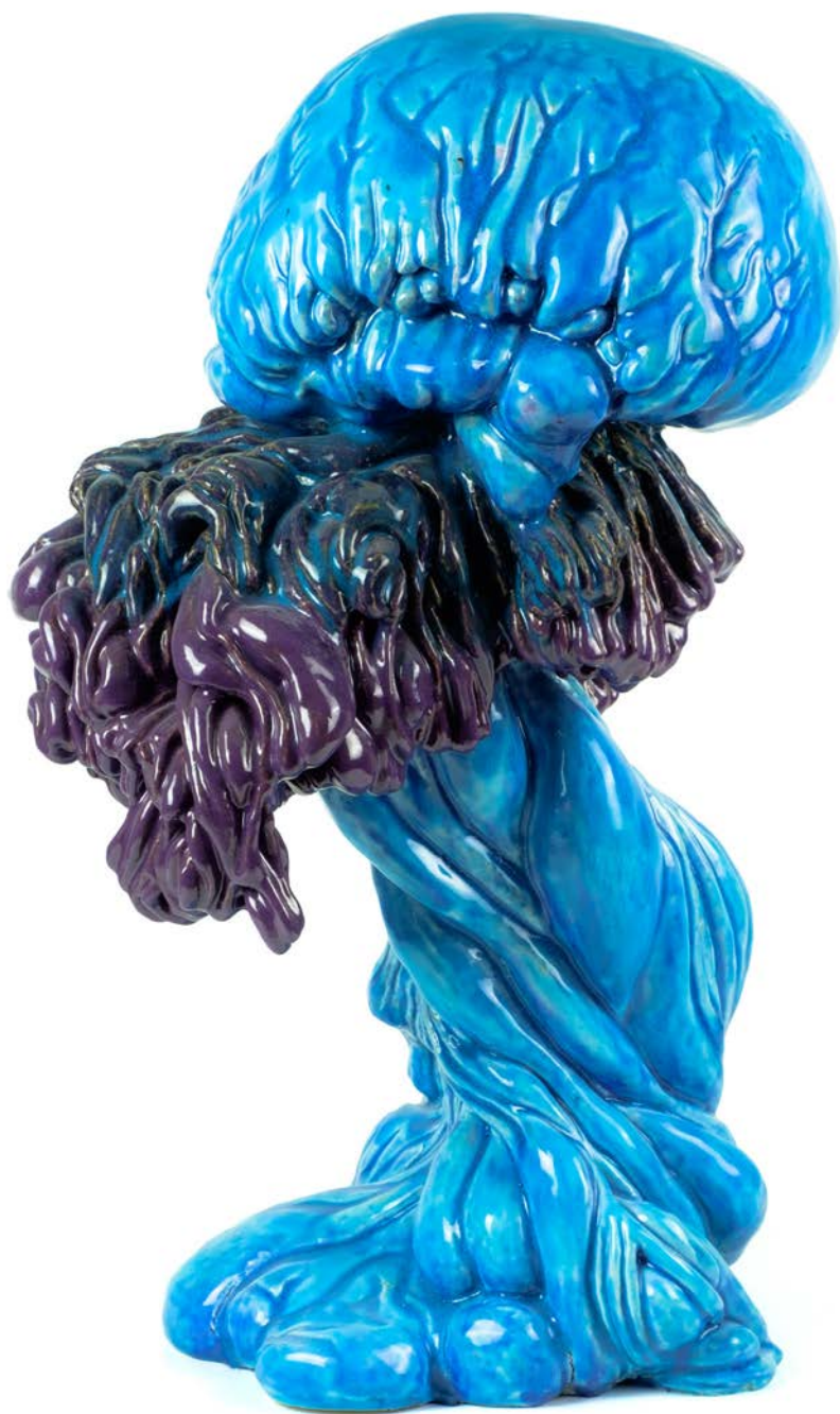
DAPIAB , 2016 - 2017 ceramic 24 x 37 x 59 cm 9.5 x 14.6 x 23.2 inches