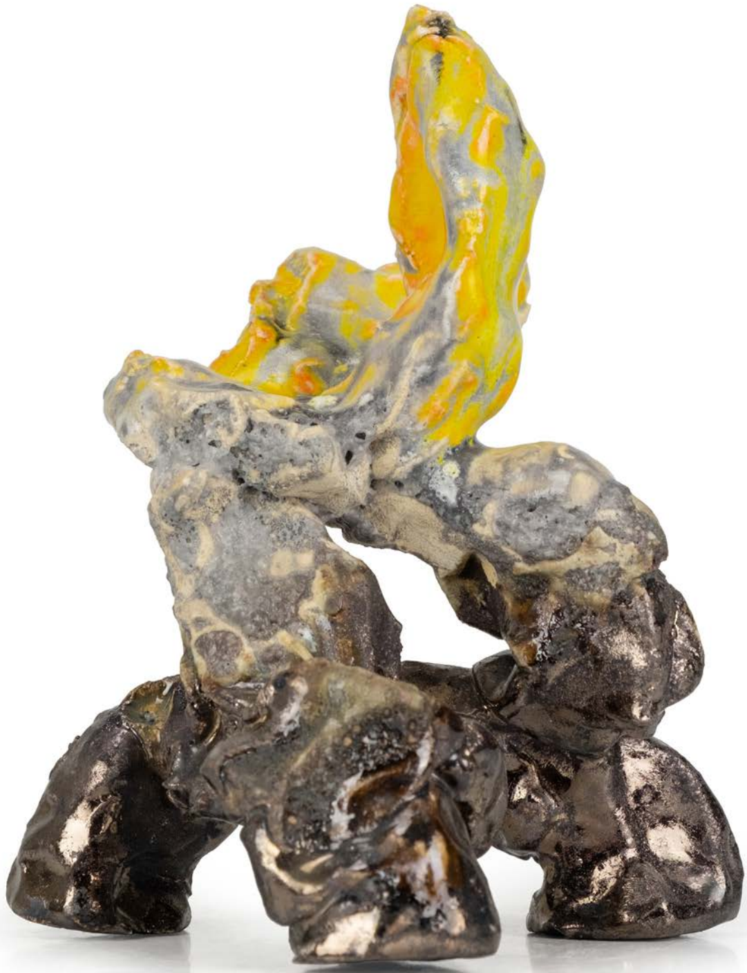
CELAOSIRA , 2020 - 2021 Ceramic 17,5 x 14 x 13 cm 6.9 x 5.5 x 5.1 inches