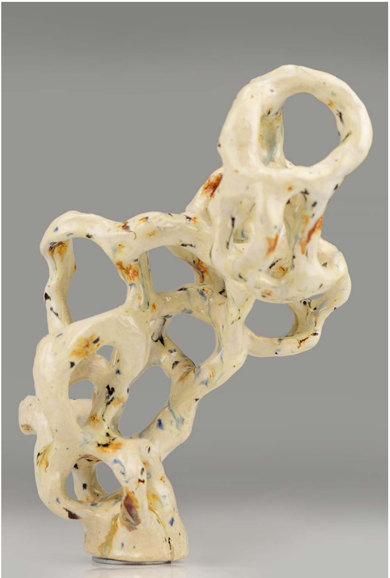
LEGUCIORI, 2022 ceramic 20,5 x 15 x 10,5 cm 8 x 7 x 4 inches