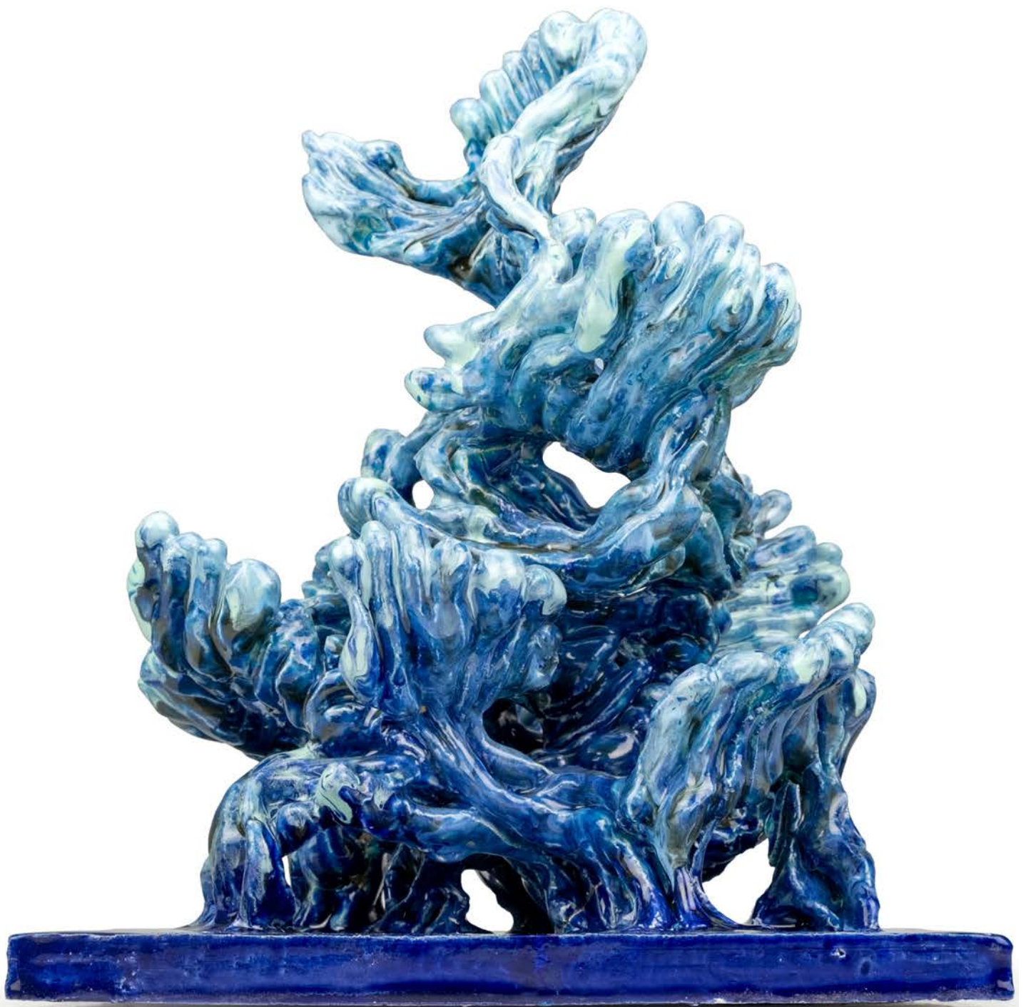
MINOTERZION, 2023 ceramic 27,5 x 23,5 x 20,5 cm 10.8 x 9.3 x 8 inches