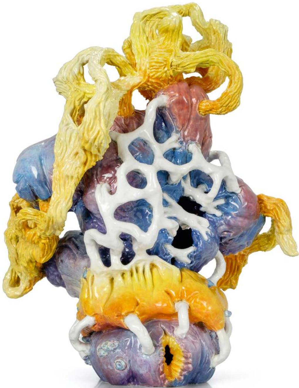
AKRITANUT, 2018 ceramic 60 x 45 x 40 cm 23.6 x 17.7 x 15.7 inches