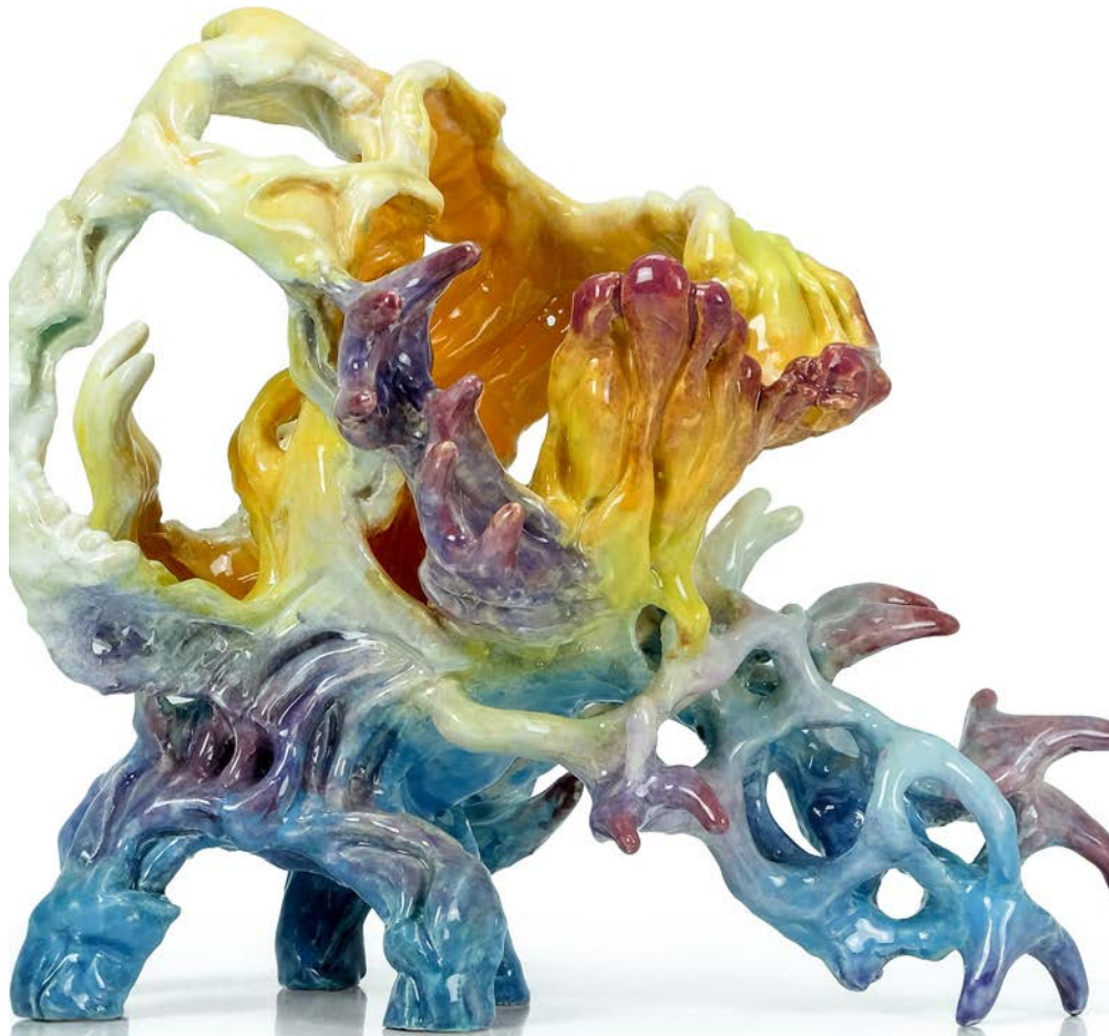
BRUNTUSLE, 2018 ceramic 31 x 36 x 36 cm 12.2 x 14.2 x 14.2 inches