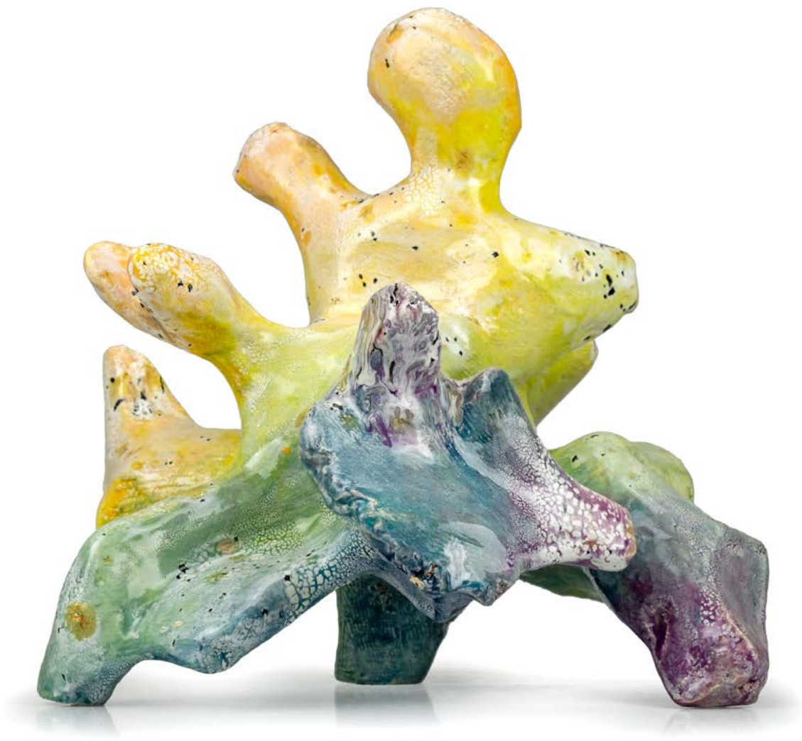
OEBERLISKAR, 2023 ceramic 29,5 x 28,5 x 31 cm 11.6 x 11 x 12 inches