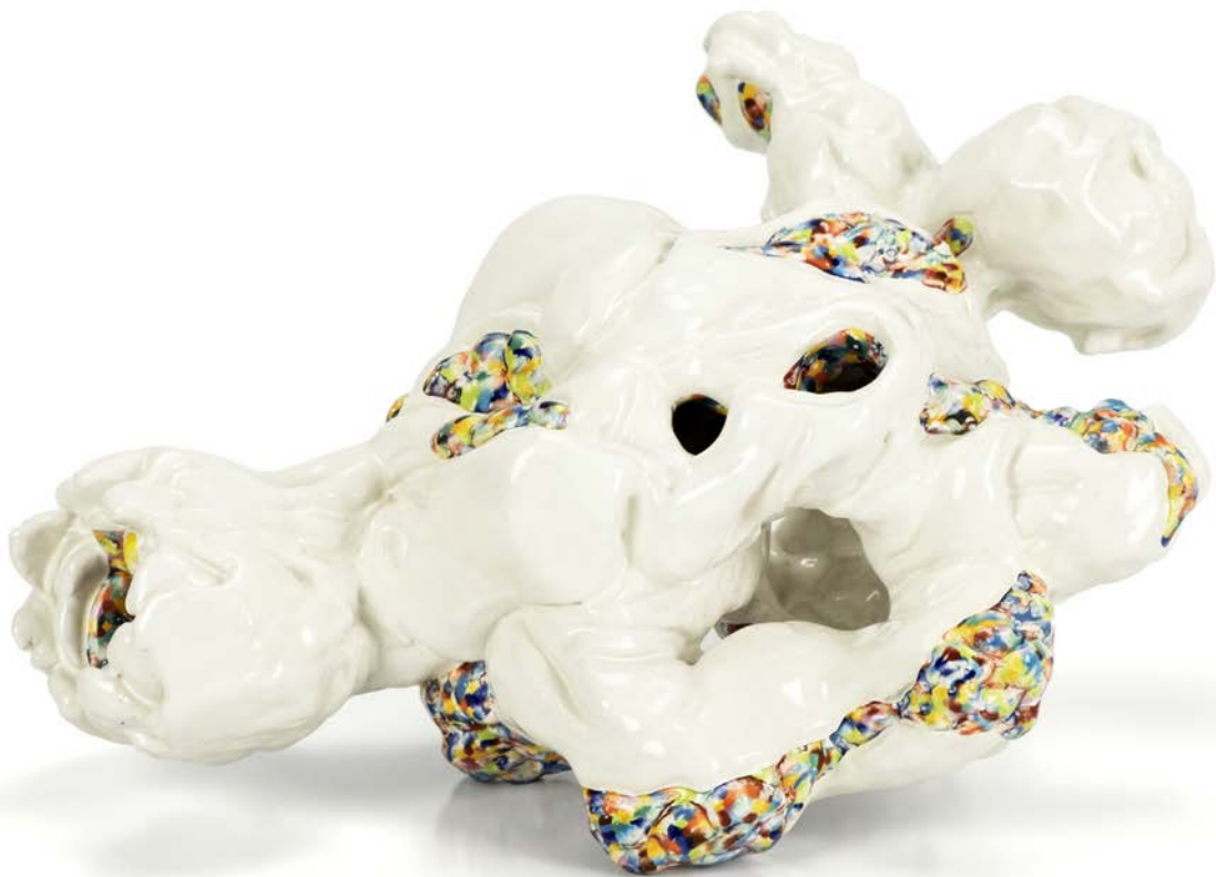
ORNOPIAT , 2016 - 2017 ceramic, 20 x 26 x 30 cm 7,8 x 10,3 x 11,8 inches