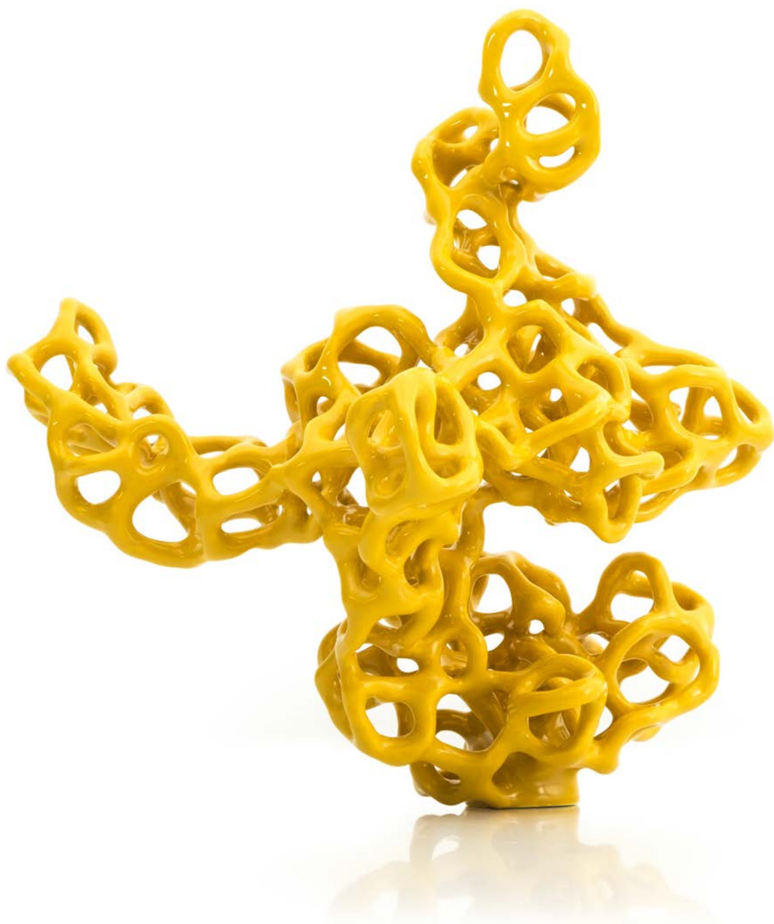
TIEWKIOW , 2016 - 2017 ceramic 25 x 25 x 30 cm 9,8 x 9,8 x 11,8 inches