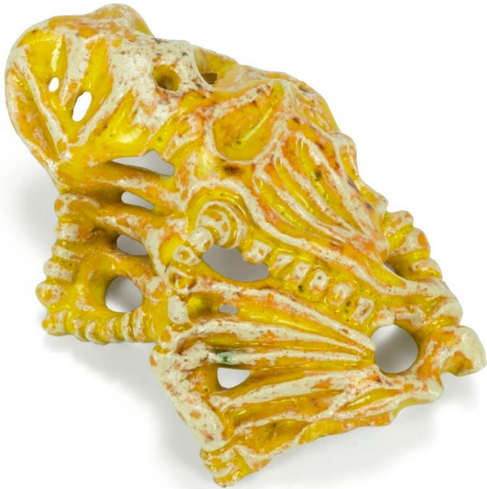
WIGNIOPS , 2018 ceramic 11 x 8 x 4 cm 4.3 x 3.1 x 1.6 inches