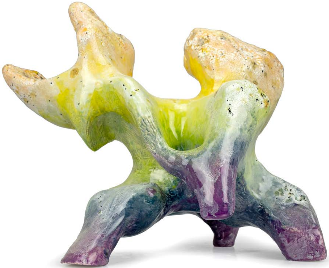
OEBEROLUX, 2023 ceramic 31 x 38,5 x 31,5 cm 12 x 15 x 12.4 inches