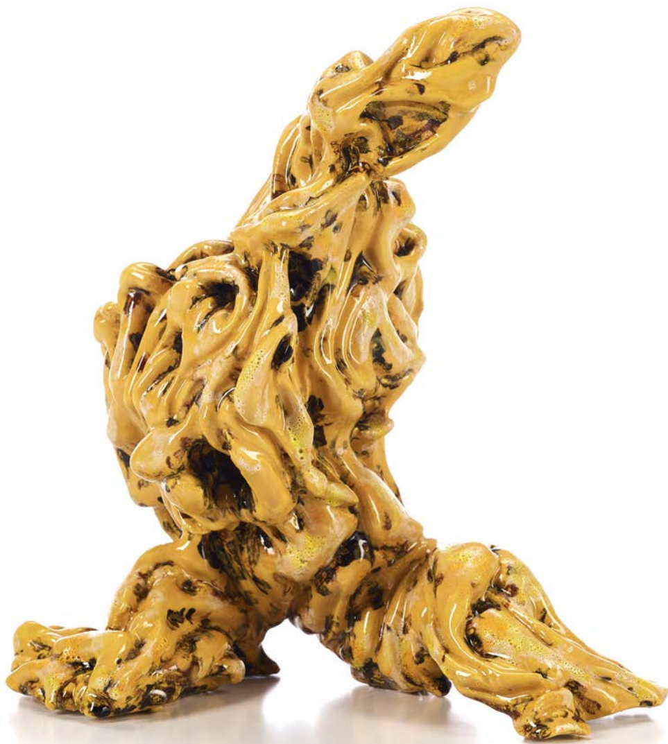
CORTURAP , 2016 Ceramic 22 x 22 x 18 cm 8,7 x 8,7 x 7,1 inches