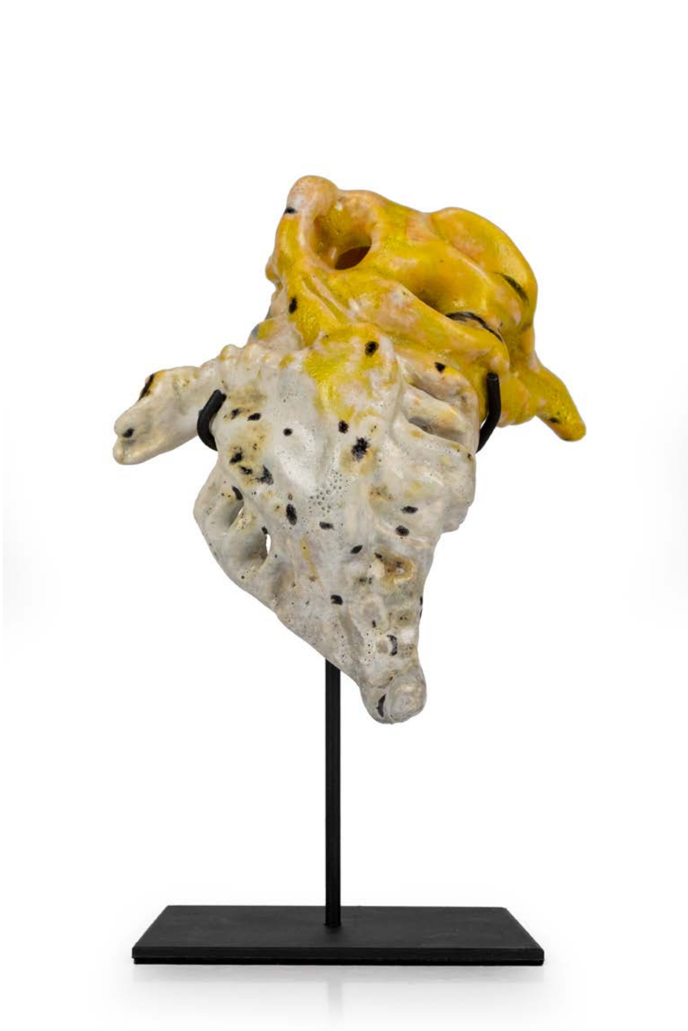
WIGNIRUPS , 2020 - 2021 Ceramic 15 x 13,5 x 12 cm 5.9 x 5.3 x 4.7 inches