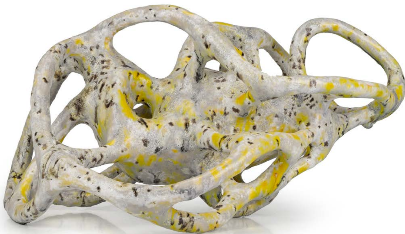
IEBLTIEW , 2020 - 2021 Ceramic 32 x 34,5 x 56 cm 12.6 x 13.6 x 22 inches