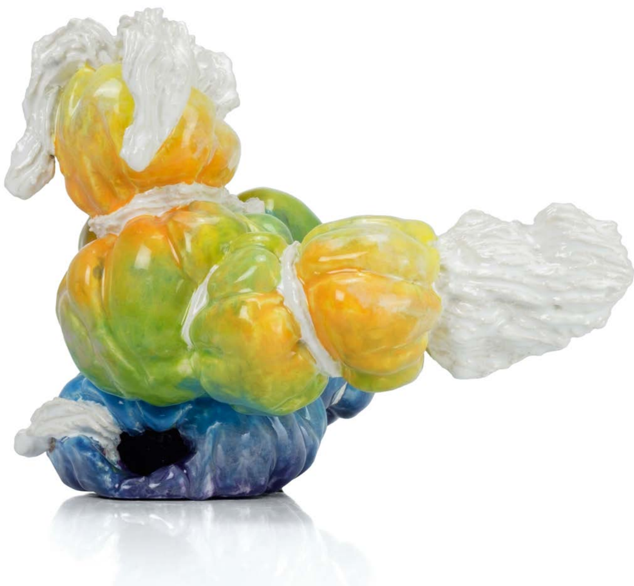
AKRINOPS, 2017 ceramic 19 x 17 x 24 cm 7.5 x 6.7 x 9.4 inches