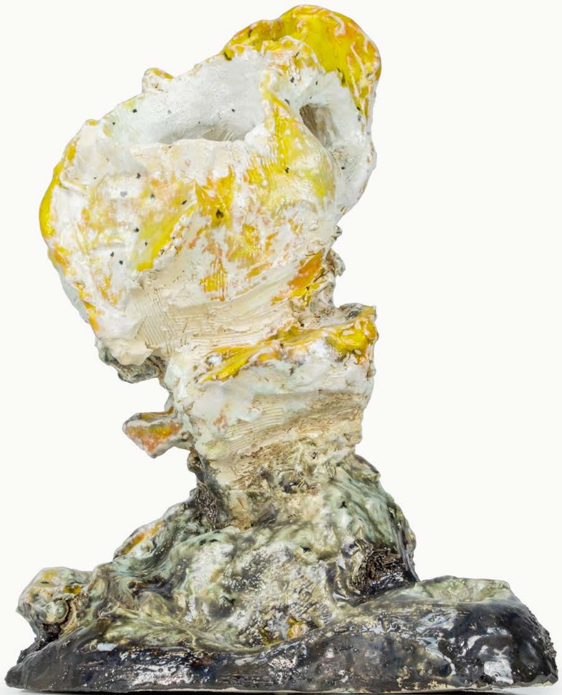
ENOORIOLU , 2021 ceramic 44,5 x 34 x 22,5 cm 17.5 x 13.4 x 8.9 inches