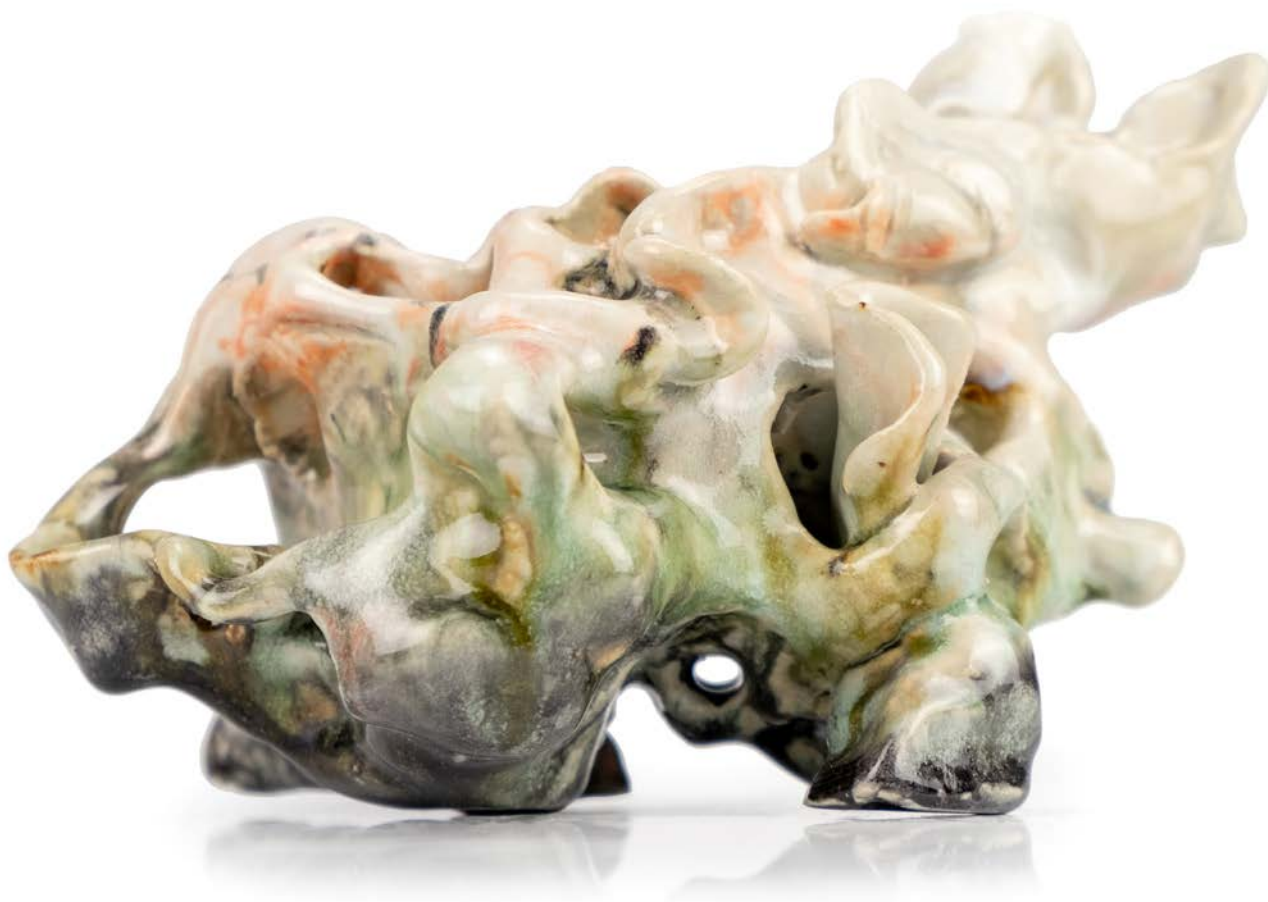
CROBOSLUCIA, 2022 ceramic 12 x 18,5 x 13 cm 4.7 x 7.3 x 5 inches