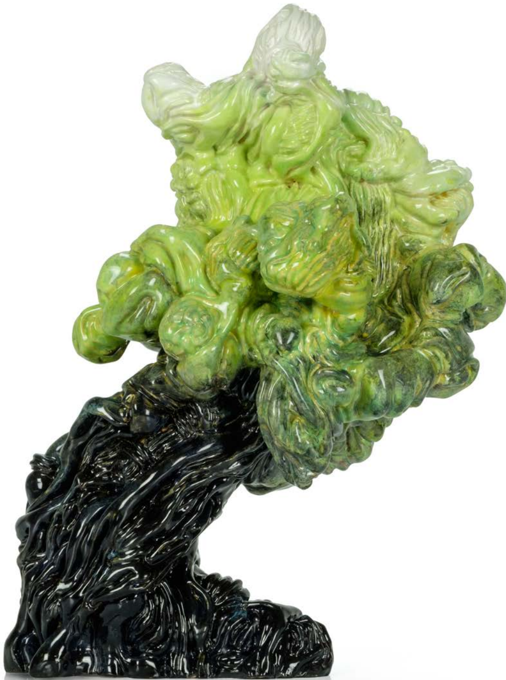
COREWOLY , 2016 - 2018 ceramic 41 x 30 x 26 cm 16.1 x 11.8 x 10.2 inches