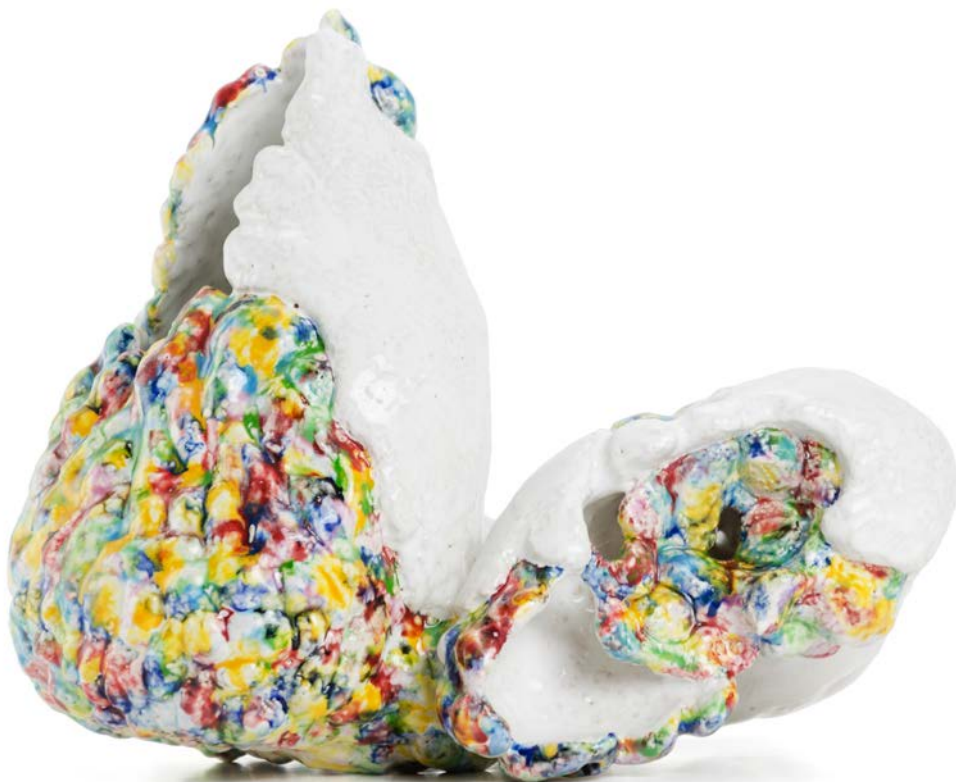
EDGNEM , 2016 ceramic, 20 x 25 x 14 cm 7,9 x 9,8 x 5,5 inches