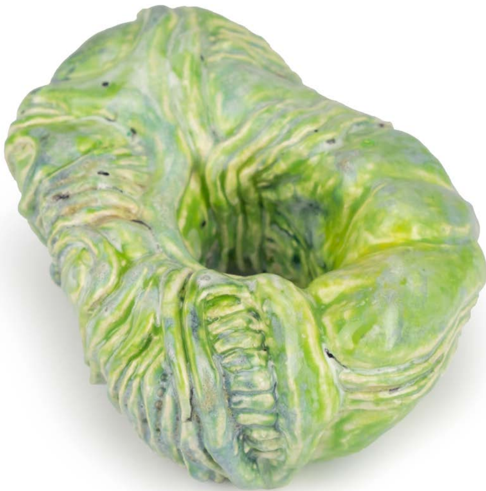
BOARIASUMA, 2022 ceramic 7,5 x 16 x 11,5 cm 3 x 6.3 x 4.5 inches