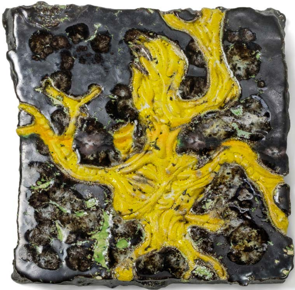
KINOTERZA , 2018 ceramic 2,5 x 21 x 33 cm 1 x 8.3 x 13 inches