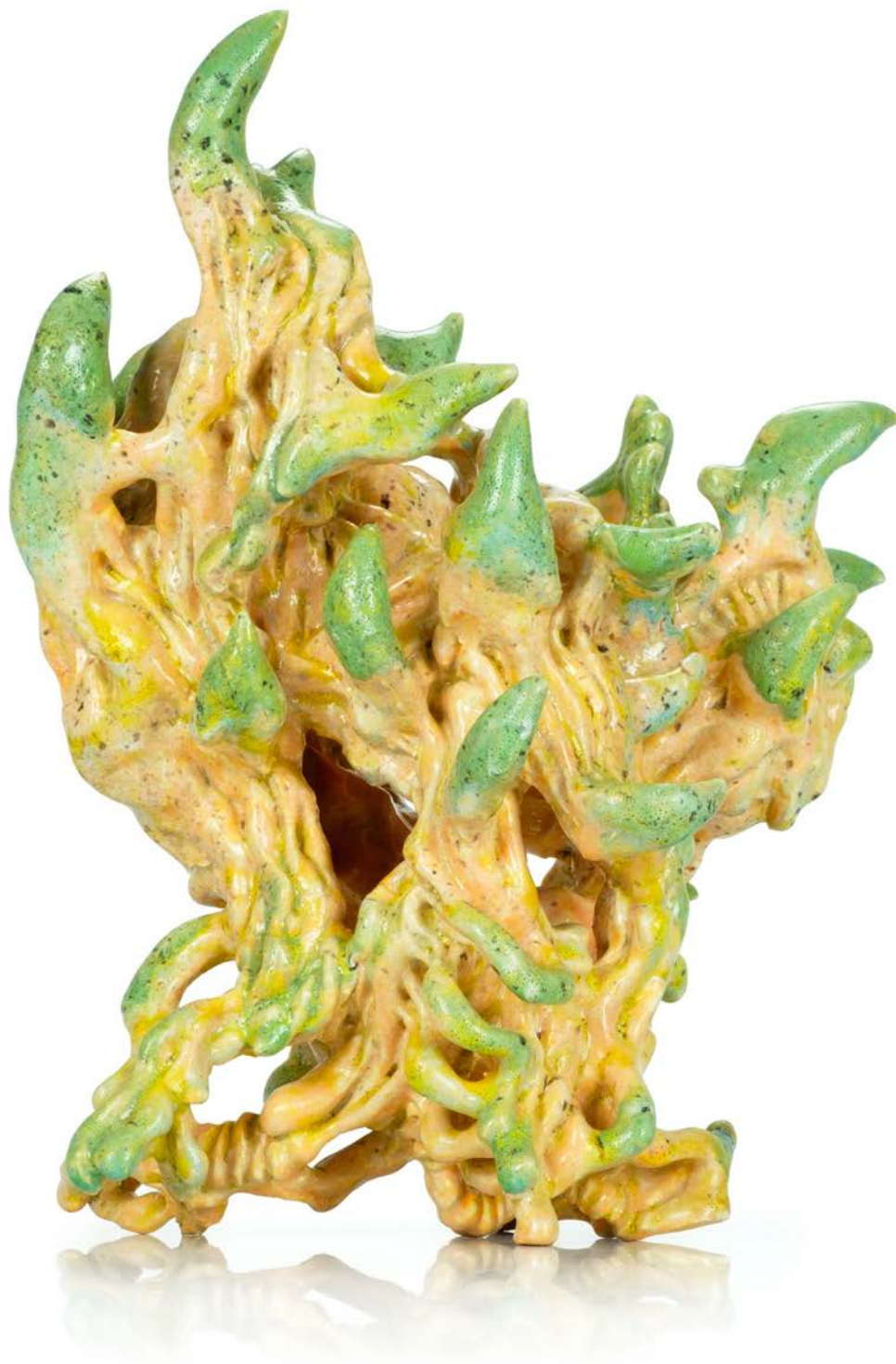
BRUNTUSLO, 2017 - 2018 ceramic 37 x 30 x 24 cm 14.6 x 11.8 x 9.4 inches