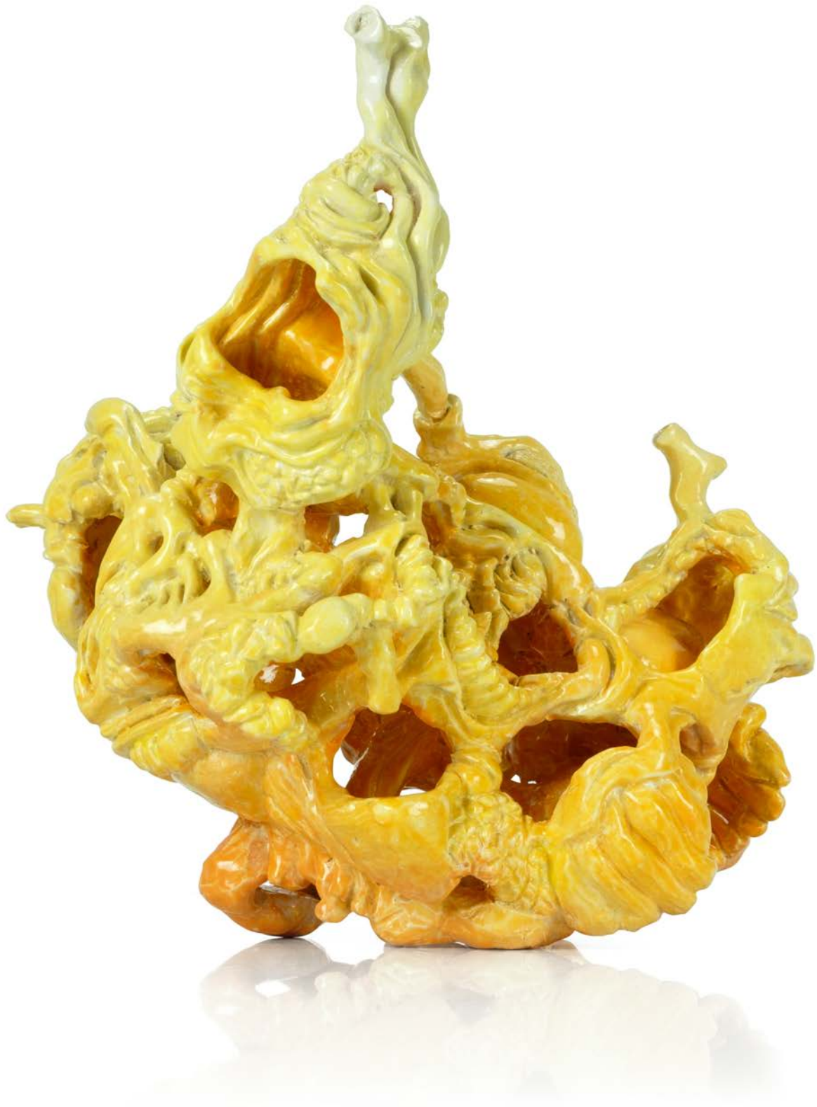
CROBOSLIO , 2017 - 2018 ceramic 34H x 30 x 36 cm 13.4H x 11.8 x 14.2 inches