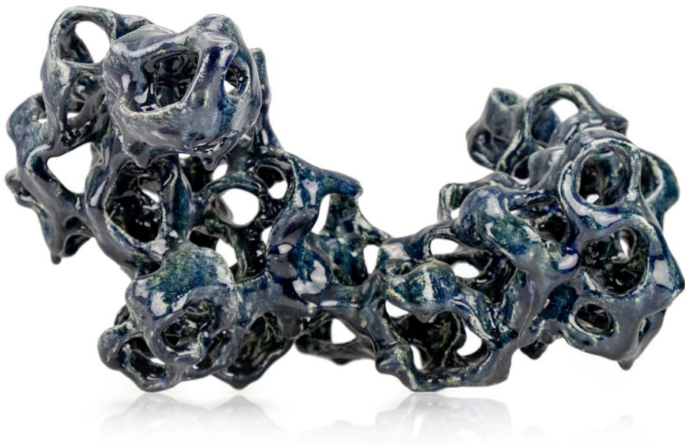
WALUCERIO, 2022 ceramic 23 x 44,5 x 27,5 cm 9 x 17.5 x 10.8 inches