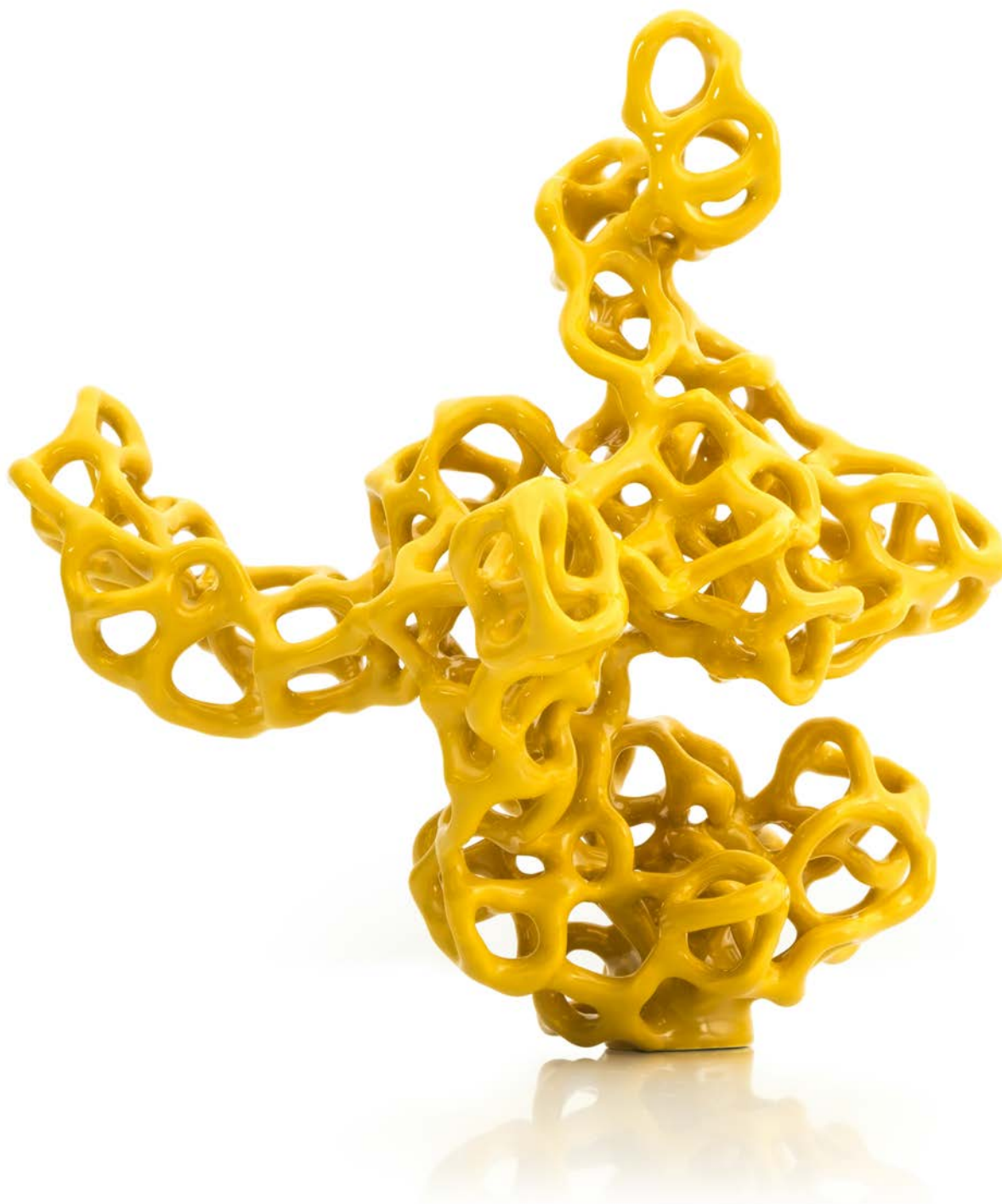
TIEWKIOW, 2016 ceramic 25 x 25 x 30 cm 9.8 x 9.8 x 11.8 inches