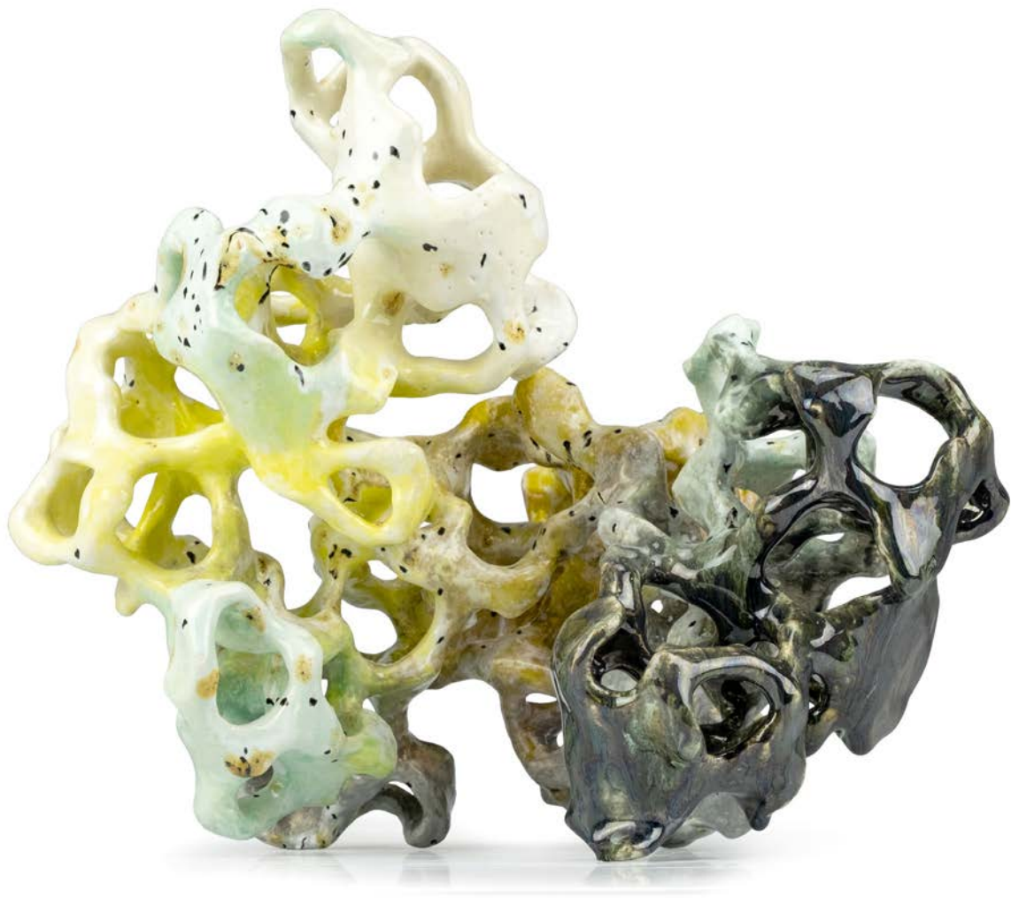
WALUCERIAS, 2023 ceramic 28 x 34,5 x 28,5 cm 11 x 13.6 x 11.2 inches