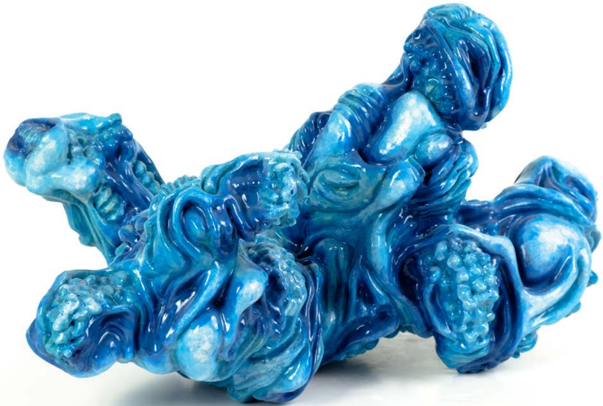
CORECHNAP , 2016 - 2017 ceramic 25 x 39 x 22 cm 9.8 x 15.4 x 8.7 inches