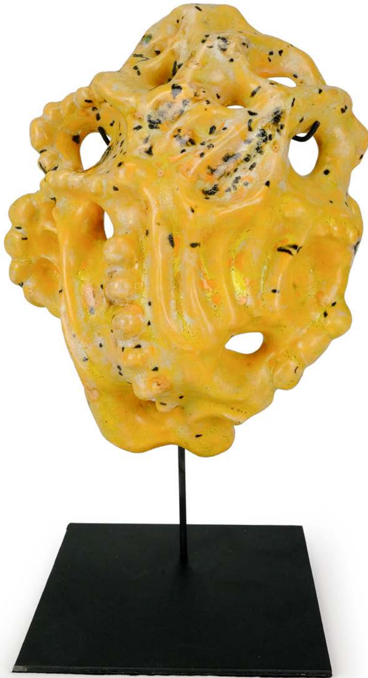
WIGNISOPS , 2020 - 2021 Ceramic 24,5 x 18,5 x 10,5 cm 9.4 x 7.3 x 4 inches