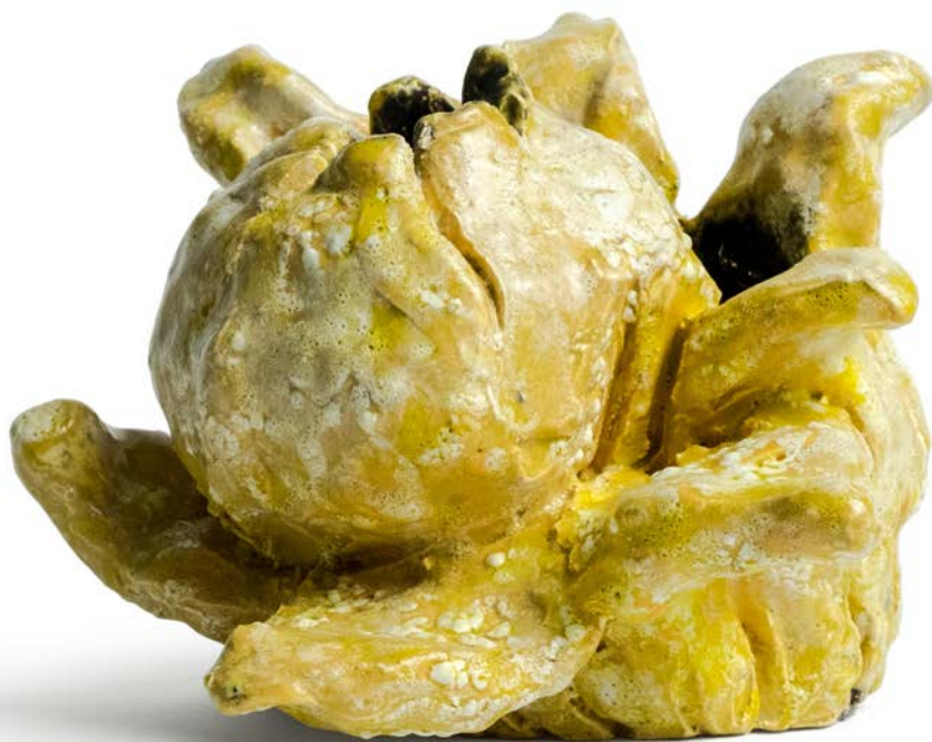
MEOBLO , 2019 ceramic 13.5 x 22 x 20 cm 5.3 x 8.7 x 7.9 inches