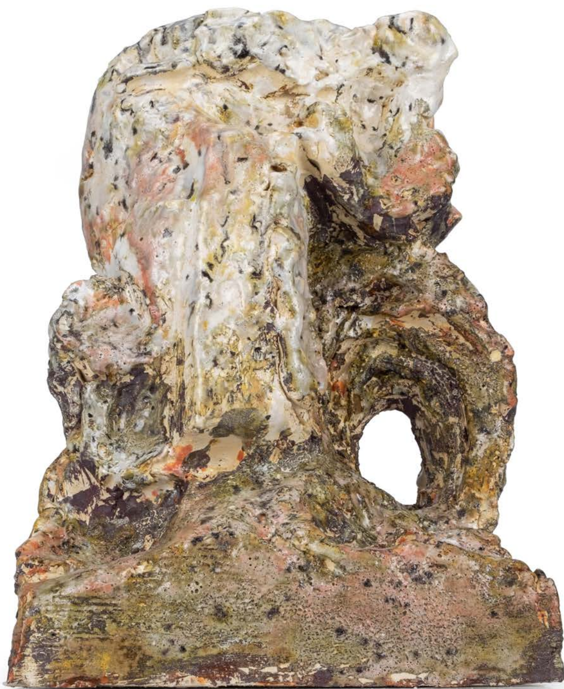
ENOOREATO, 2021 ceramic 44 x 27,5 x 27 cm 17.3 x 10.8 x 10.6 inches