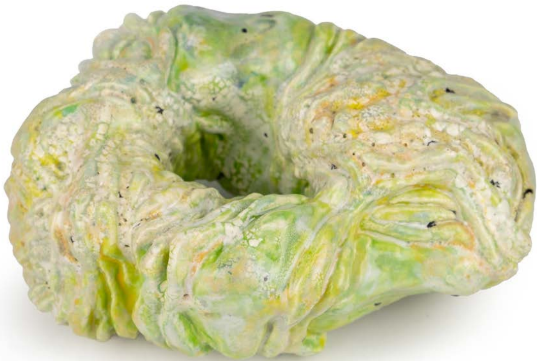
BOARIOSAM, 2022 ceramic 7 x 15 x 10,5 cm 2.7 x 5.9 x 4.1 inches