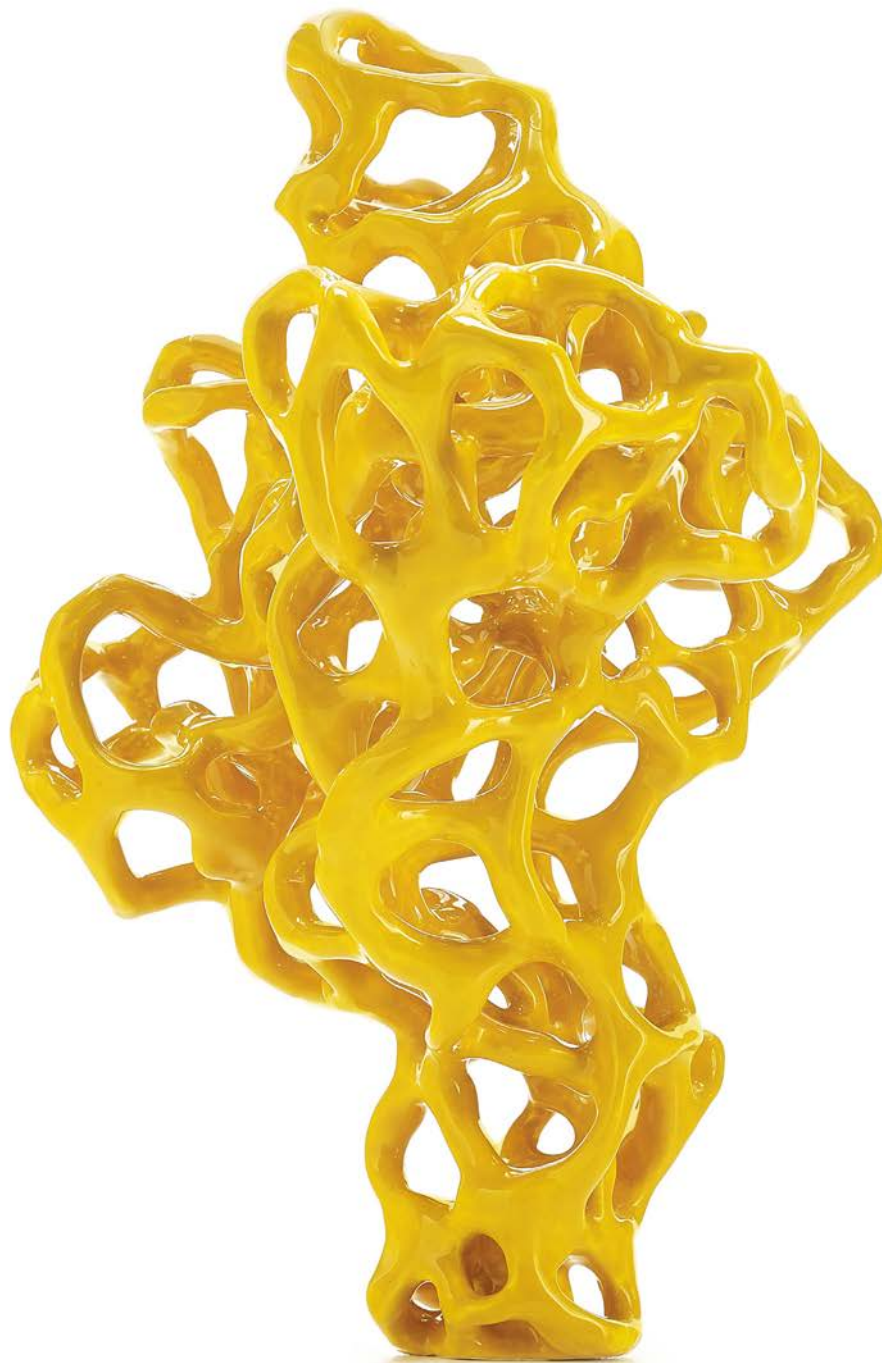
LEGUCERUM , 2016 ceramic 32 x 21.5 x 21 cm 12.6 x 84.6 x 8.3 inches