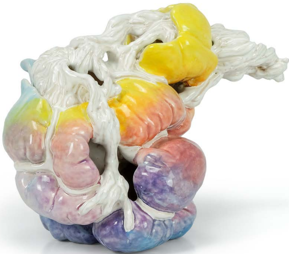
AKRIAMOTI, 2017 - 2018 ceramic 25 x 27 x 16 cm 9.8 x 10.6 x 6.3 inches