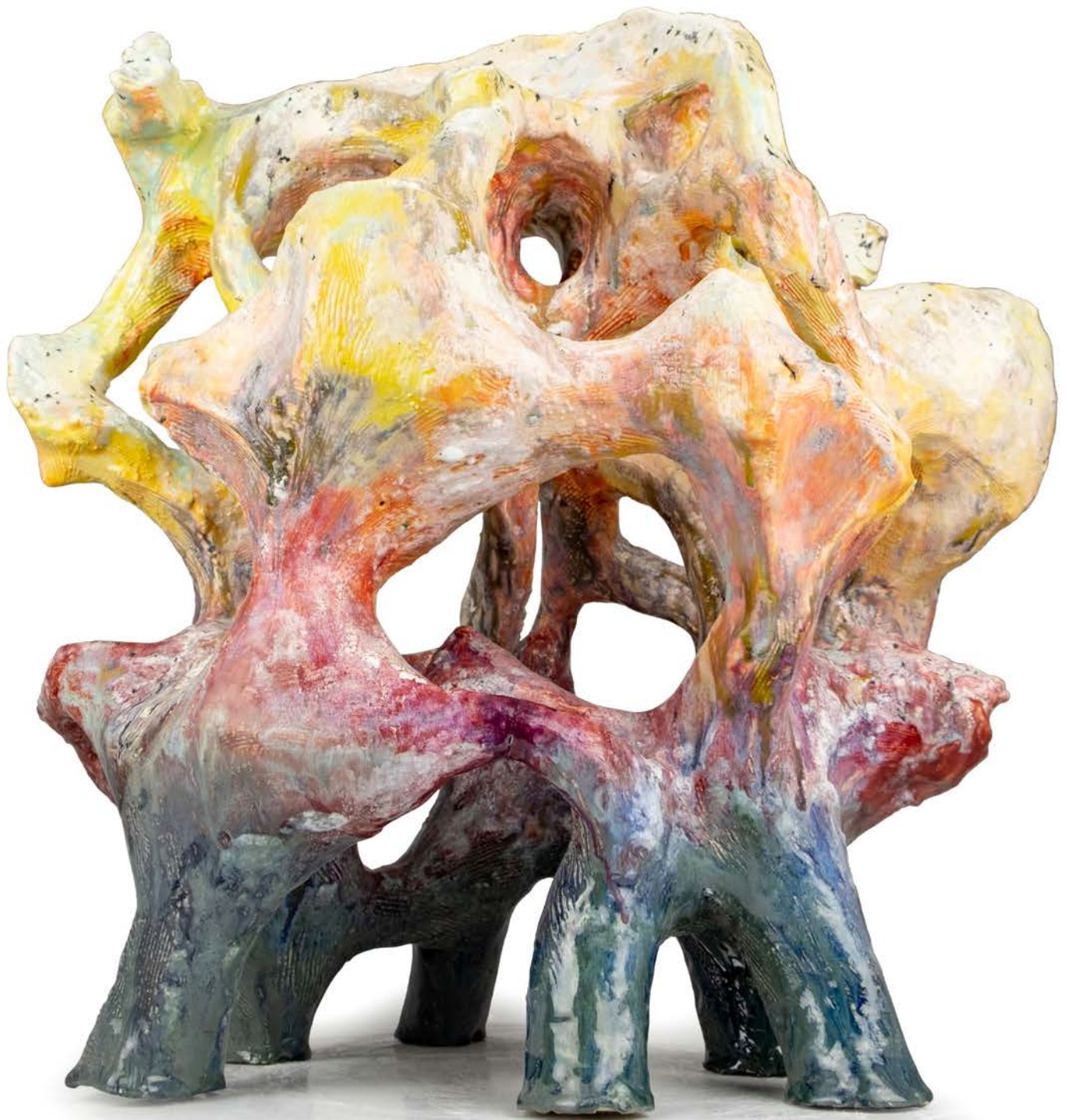
OBERIOSA , 2023 ceramic 58,5 x 57,5 x 40 cm 23 x 22.6 x 15.7 inches