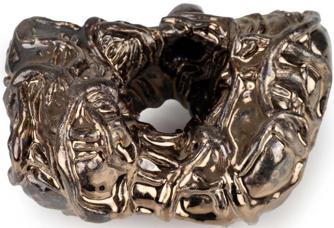
BOARIATIO, 2022 ceramic 8,5 x 15 x 12,5 cm 3.3 x 5.9 x 4.9 inches