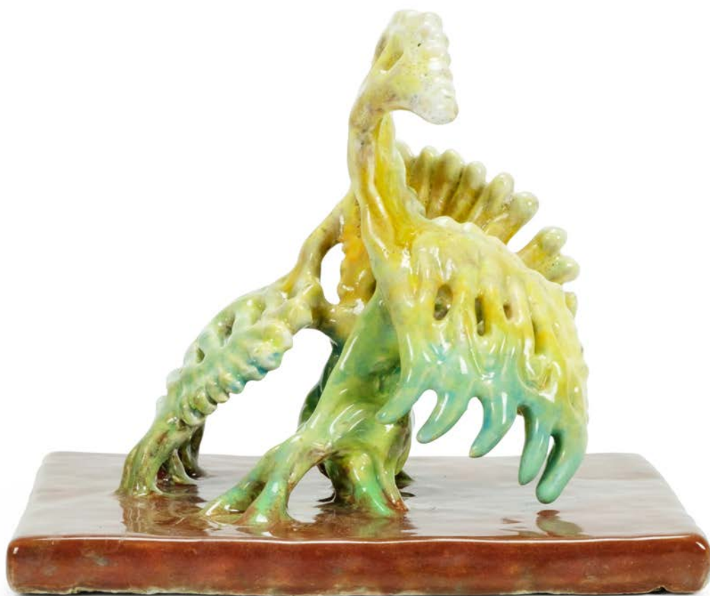
MINOTERCERU, 2017 ceramic 17 x 14 x 14 cm 6.7 x 5.5 x 5.5 inches