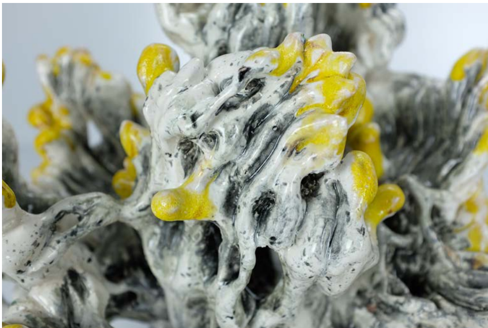
detail BRUNTISKO , 2017 - 2018 ceramic 33 x 30 x 30 cm 13 x 11.8 x 11.8 inches