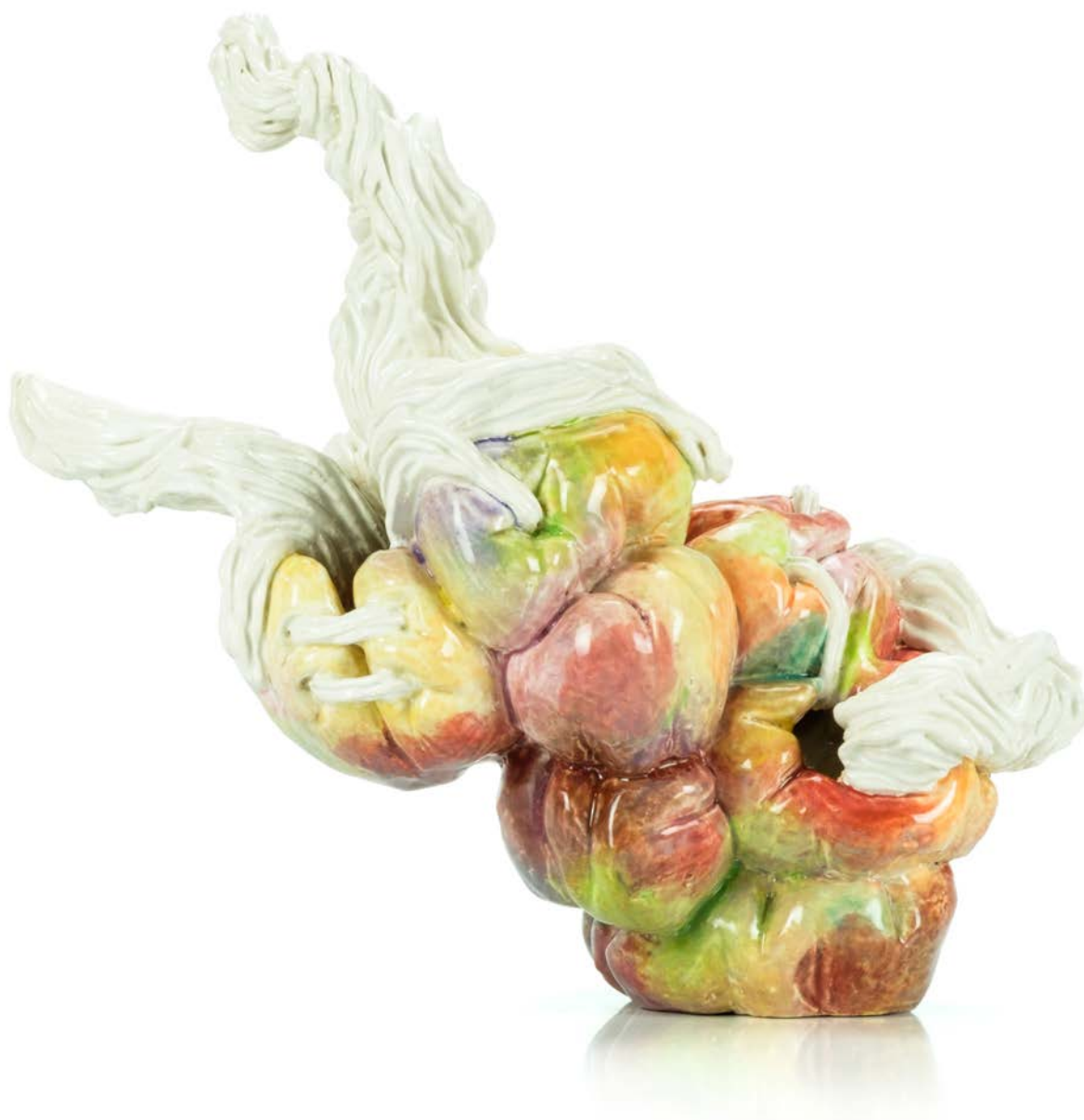
AKRITERA , 2015 - 2018 ceramic 29 x 19 x 26.5 cm 11.4 x 7.5 x 10.4 inches