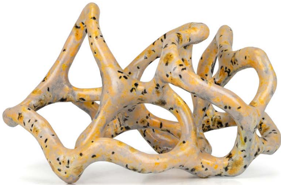
TIEWCERICS , 2020 - 2021 Ceramic 20 x 24 x 30,5 cm 7.9 x 9.5 x 12 inches