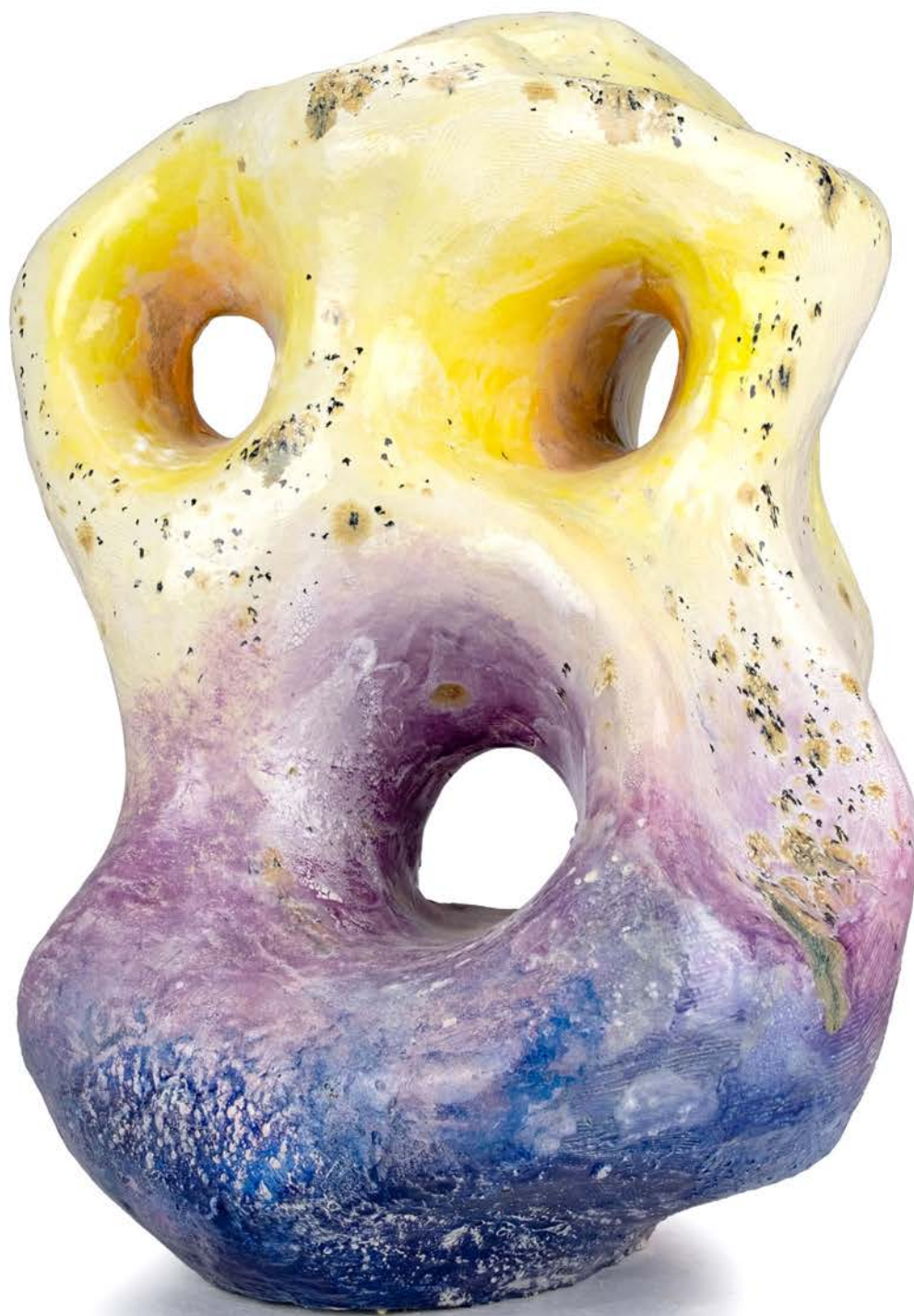
ELLEVIAR, 2023 ceramic 60 x 41,5 x 44 cm 23.2 x 16.3 x 17.3 inches