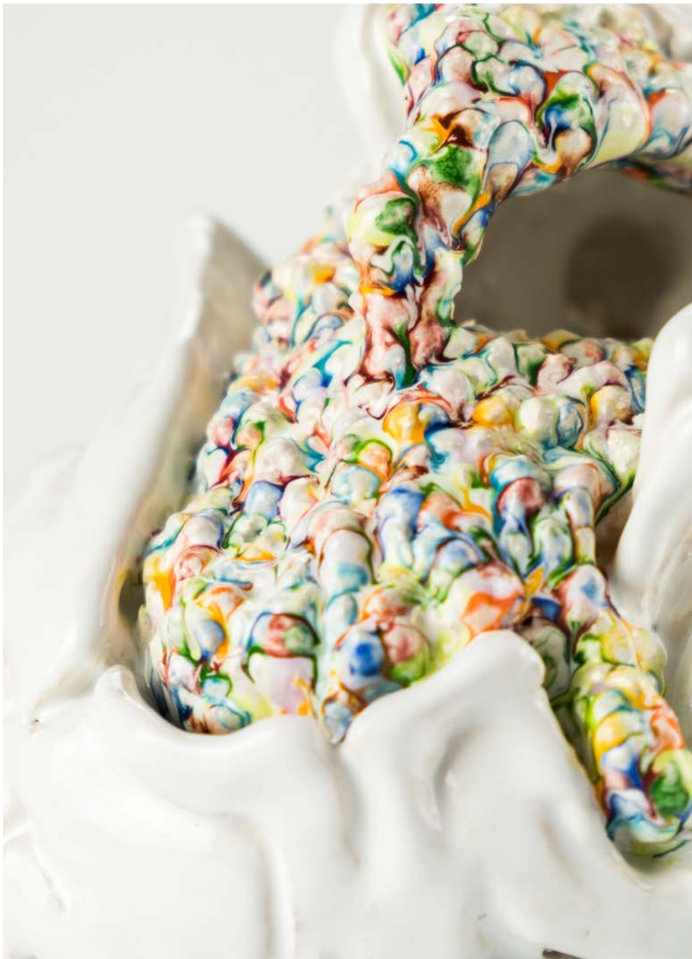
detail ENTUNAP , 2017 ceramic, 28 x 20 x 21 cm 11 x 7,9 x 8,3 inches