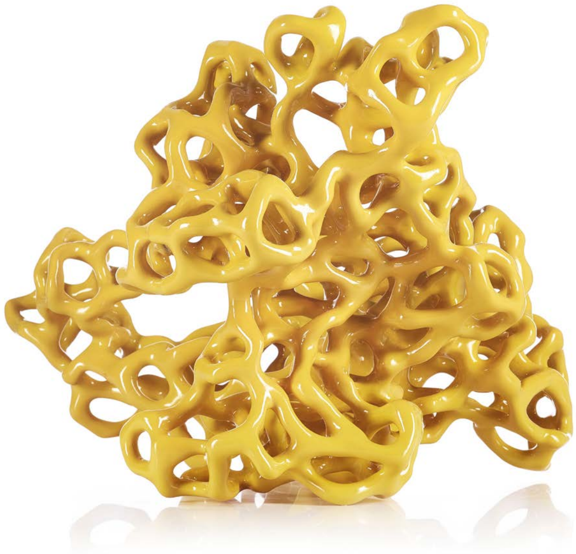
LERACERUM , 2016 ceramic 50 x 50 x 33 cm 19.7 x 19.7 x 13 inches