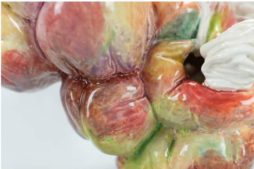
detail AKRITERA , 2015 - 2018 ceramic 29 x 19 x 26.5 cm 11.4 x 7.5 x 10.4 inches