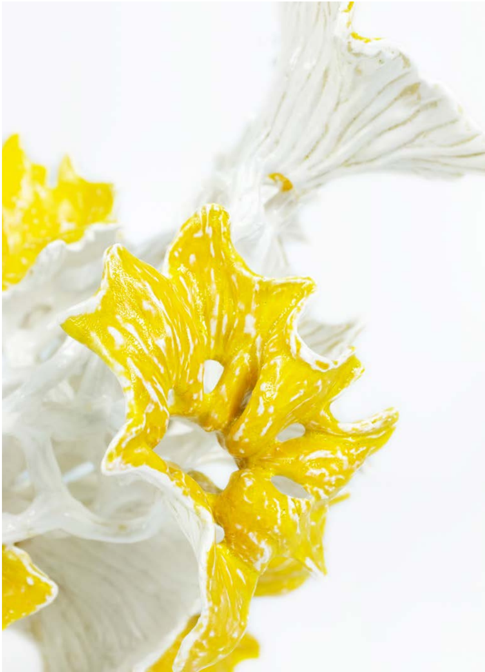
detail PETOEMBA , 2016 - 2018 ceramic 40 x 40 x 40 cm 15.7 x 15.7 x 15.7 inches