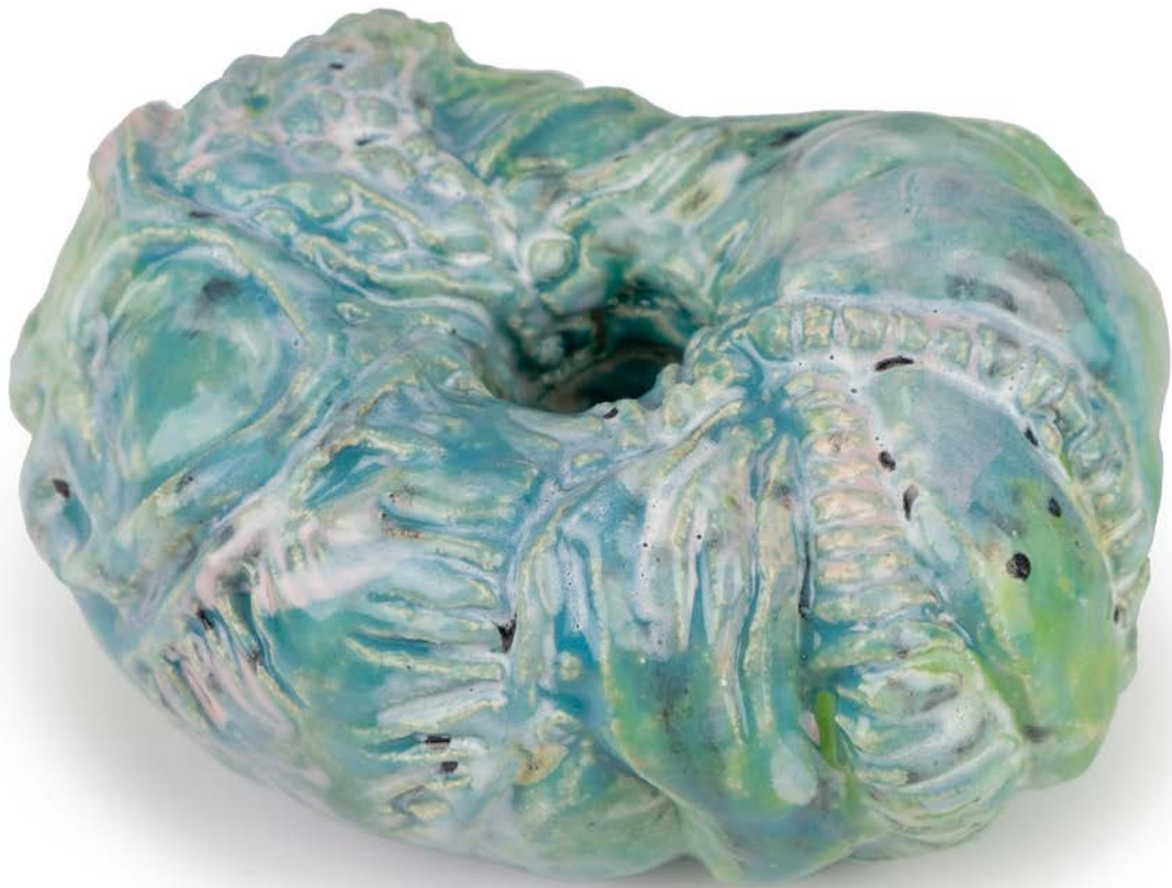
BOARIAZU, 2022 ceramic 7,3 x 13,5 x 10,5 cm 2.8 x 5.3 x 4.1 inches