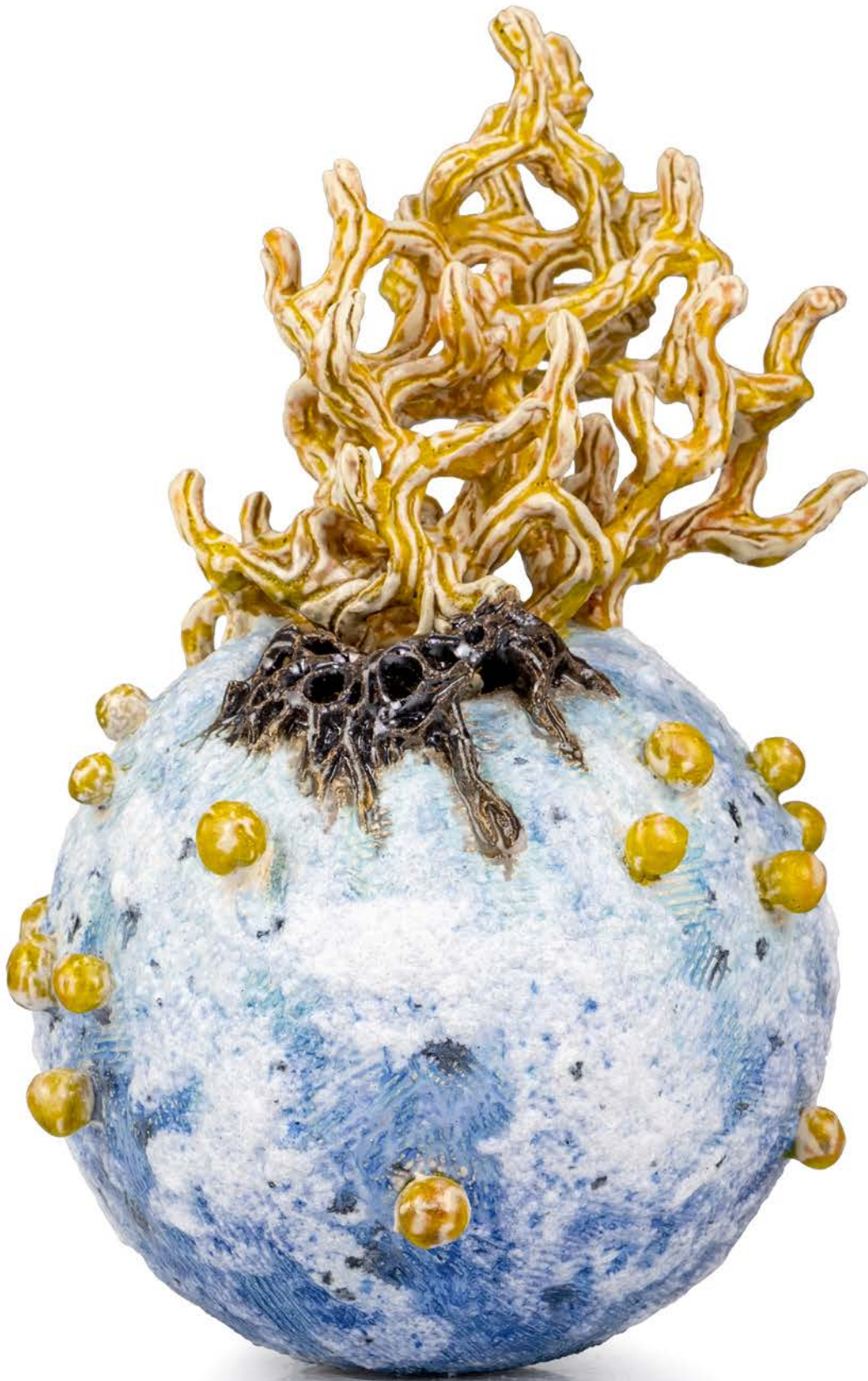
CROBOSLIAS , 2022-2023 ceramic 38 x 23 x 20,5 cm 15 x 9 x 8 inches