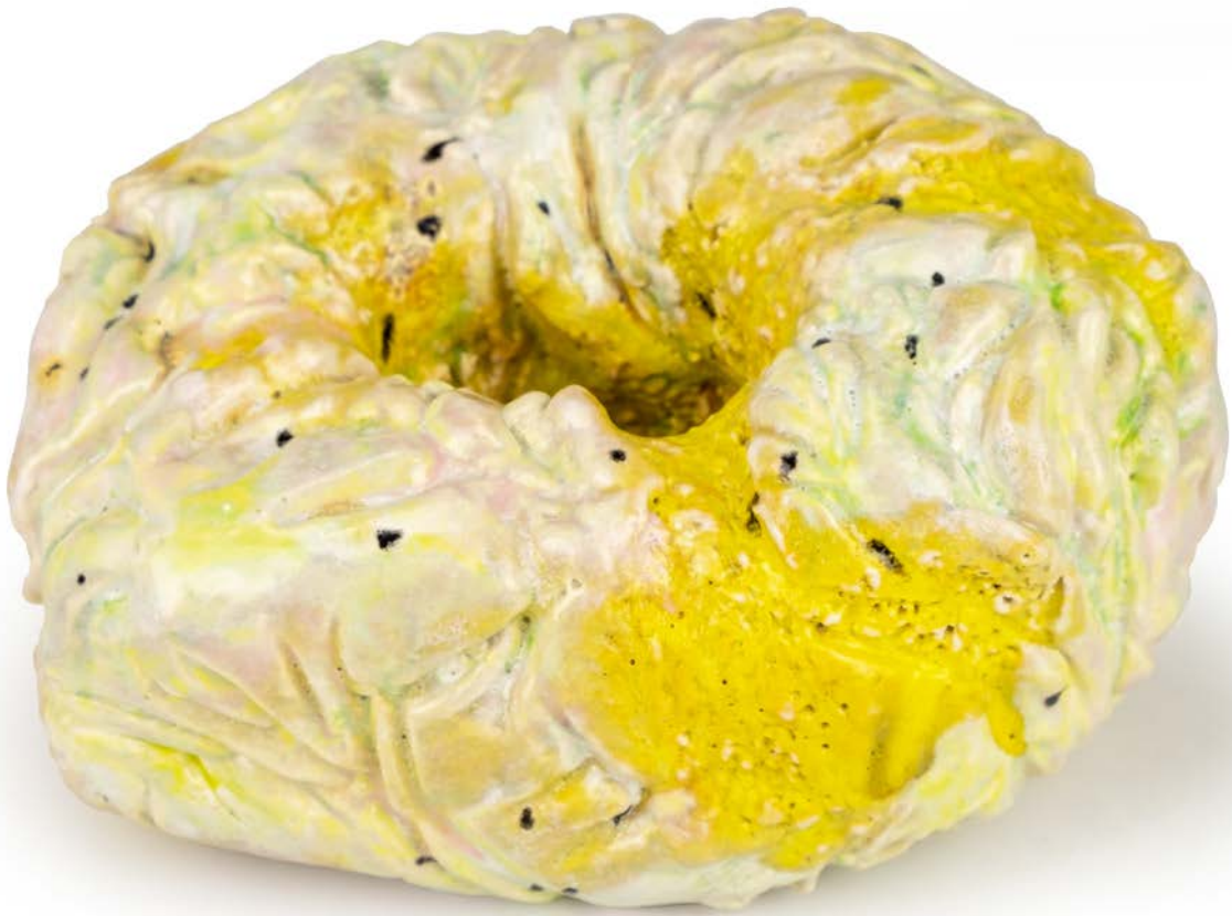
BOARIASEM, 2022 ceramic 8 x 15,5 x 11,5 cm 3.1 x 6 x 4.5 inches