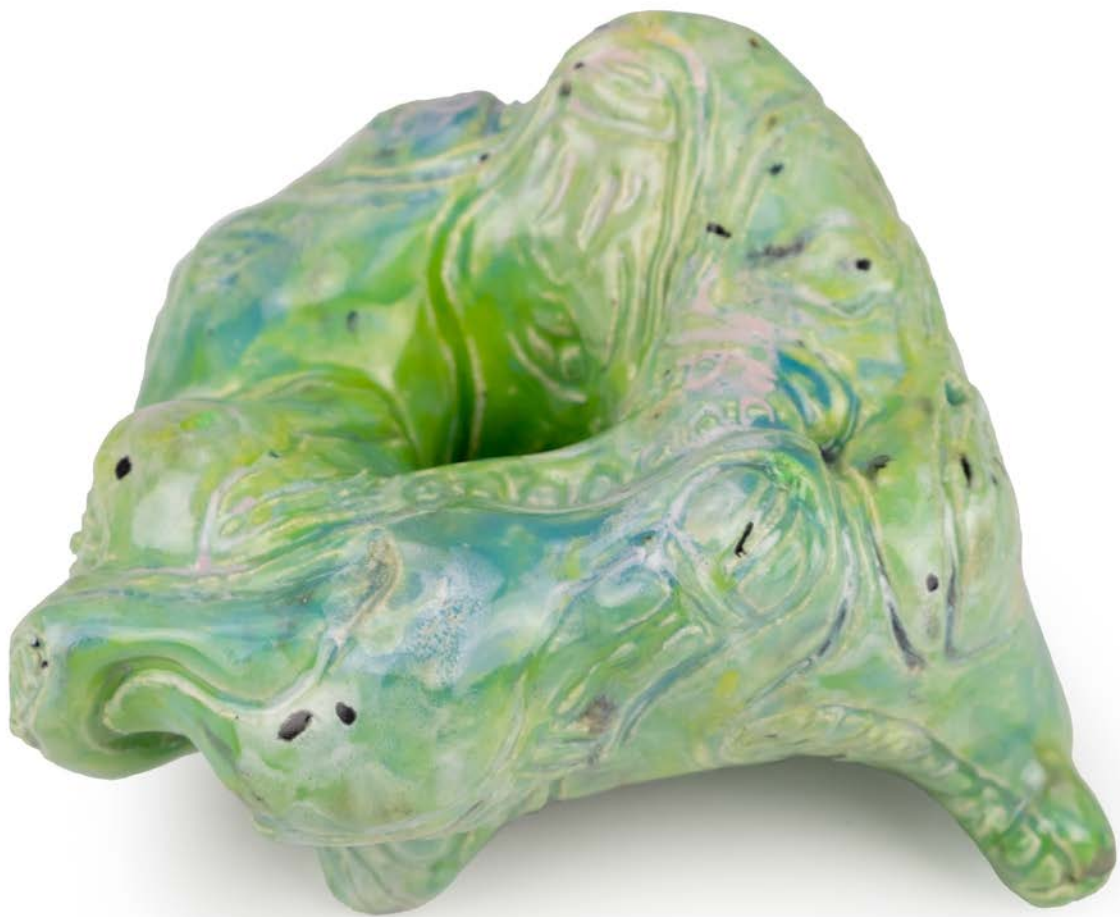
BOARITIOS, 2022 ceramic 9,5 x 14,5 x 12,5 cm 3.7 x 5.7 x 4.9 inches