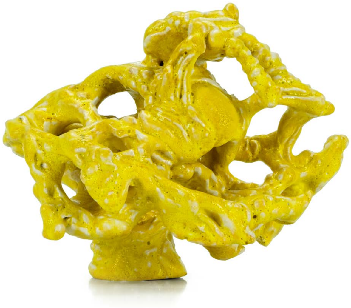
CORBOSLAM , 2017 - 2018 ceramic 15 x 19 x 15 cm 5.9 x 7.5 x 5.9 inches