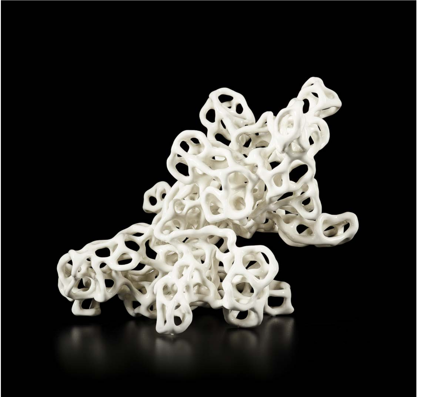
TIEWCERUM, 2016 ceramic 28 x 28 x 43 cm 11 x 11 x 16,9 inches