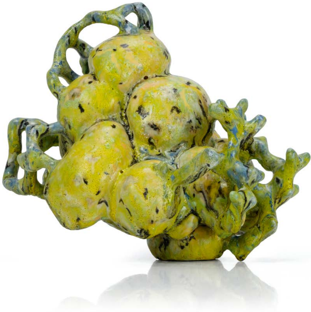
PLETORAK, 2017 ceramic 17 x 23 x 13 cm 6.7 x 9.1 x 5.1 inches