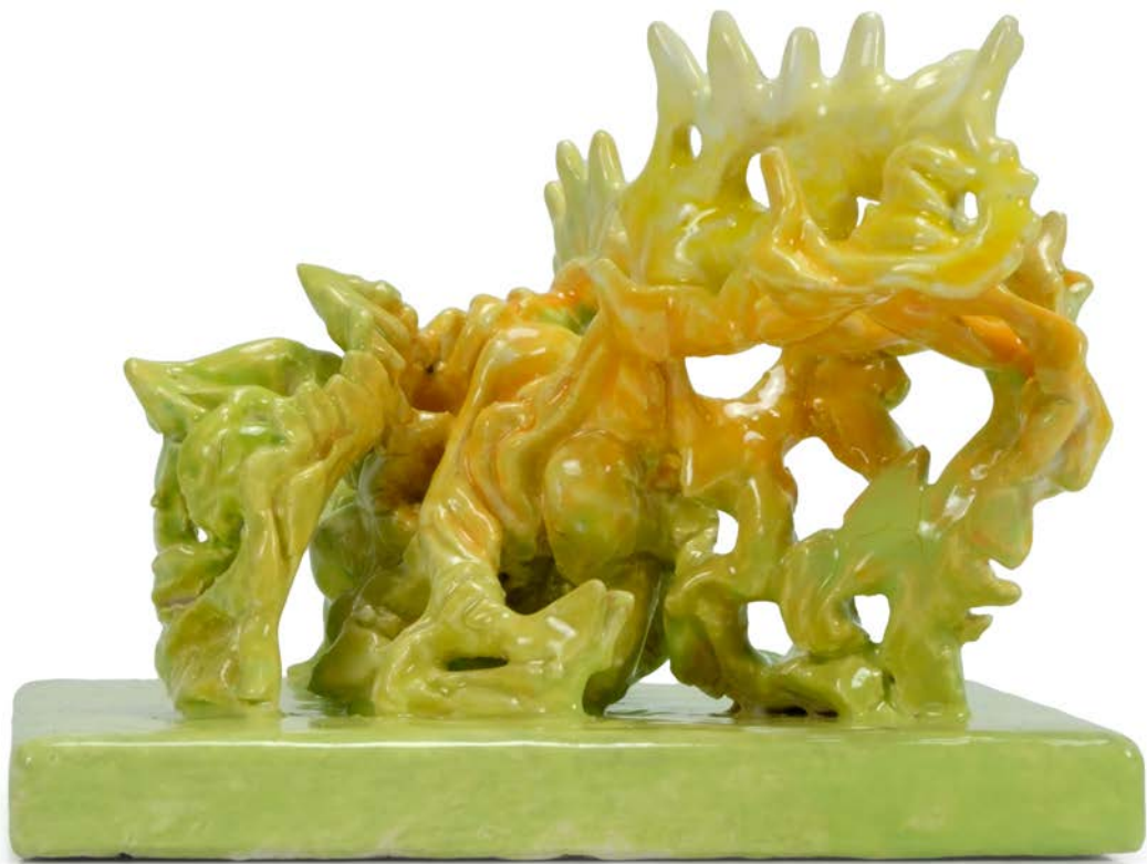
MINOTERKSA , 2017 ceramic 16 x 14 x 12 cm 6.3 x 5.5 x 4.7 inches