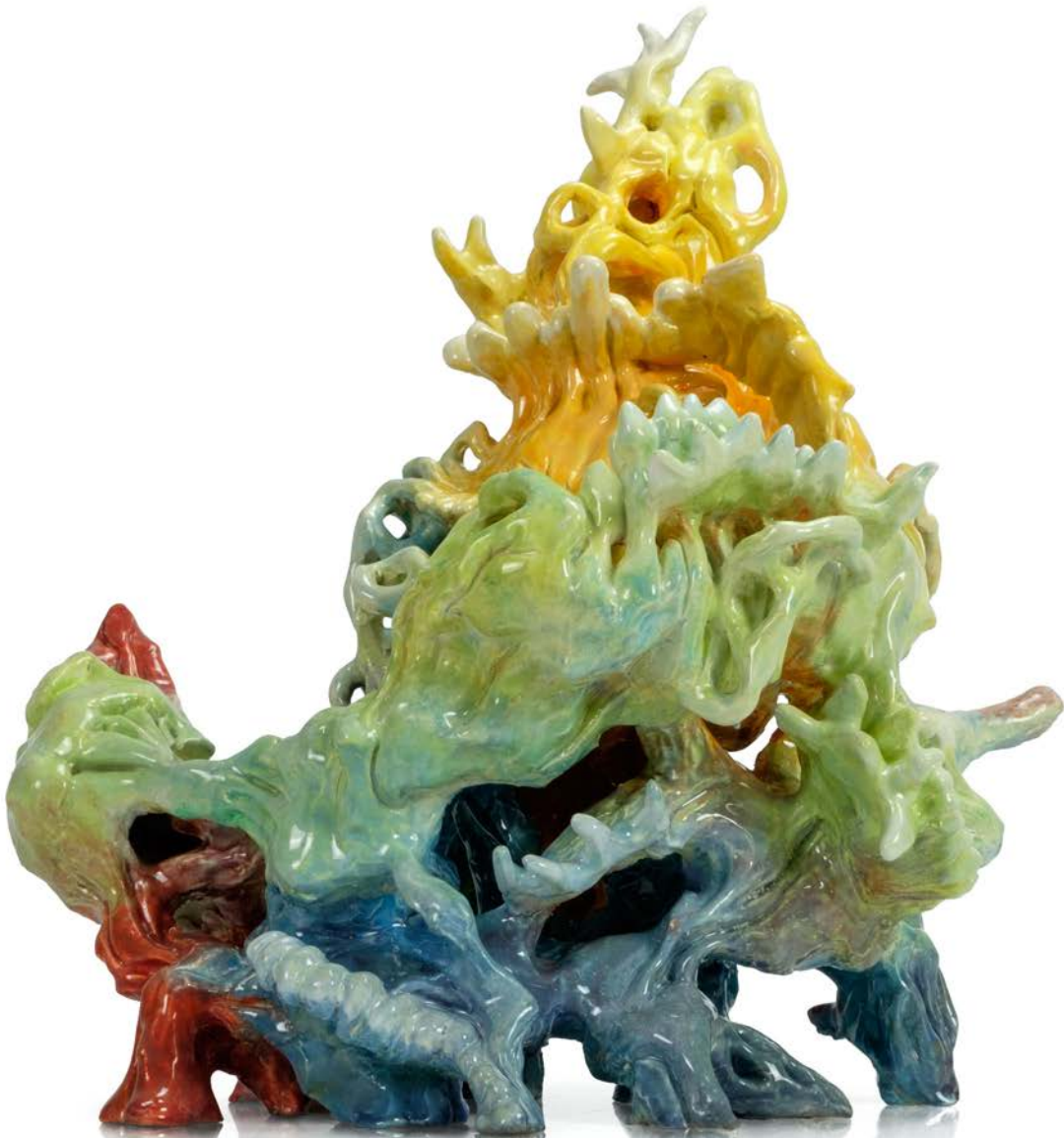
BRUNTUSKA, 2017 - 2018 ceramic 41 x 37 x 32 cm 16.1 x 14.6 x 12.6 inches