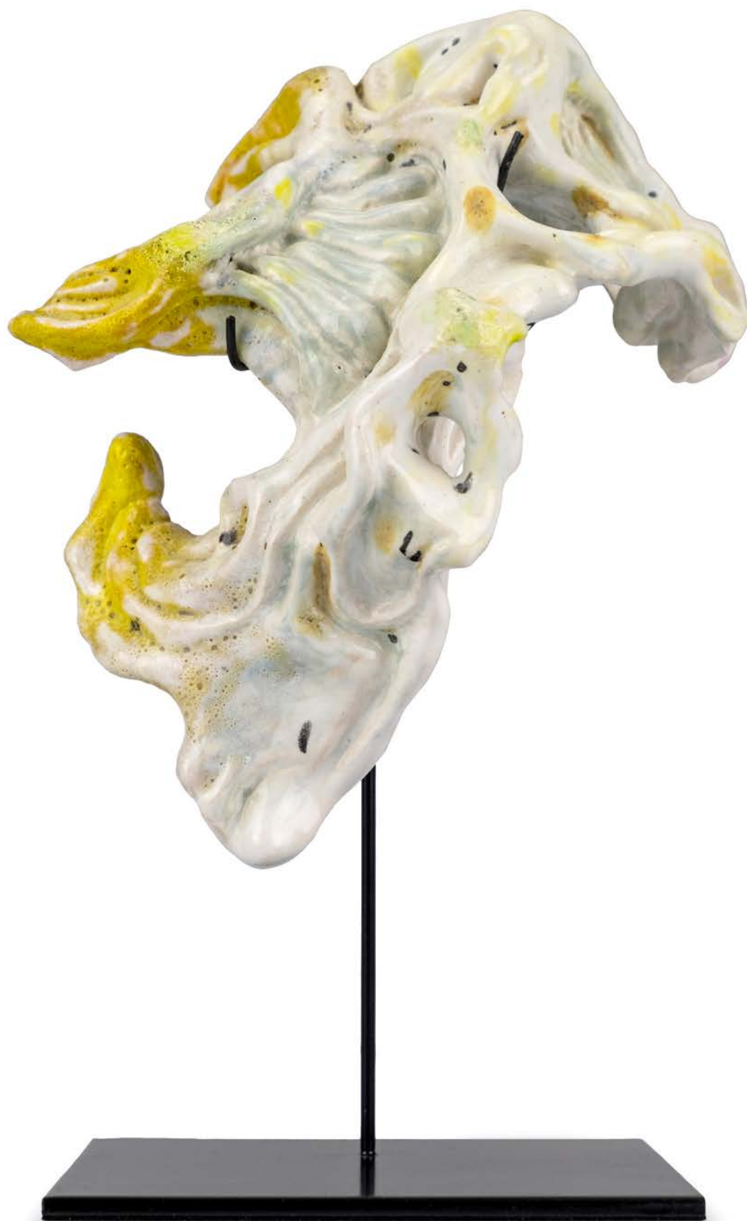
WIGNILIOS, 2022 ceramic 7,5 x 14,5 x 10,5 cm 2.9 x 5.7 x 4.1 inches