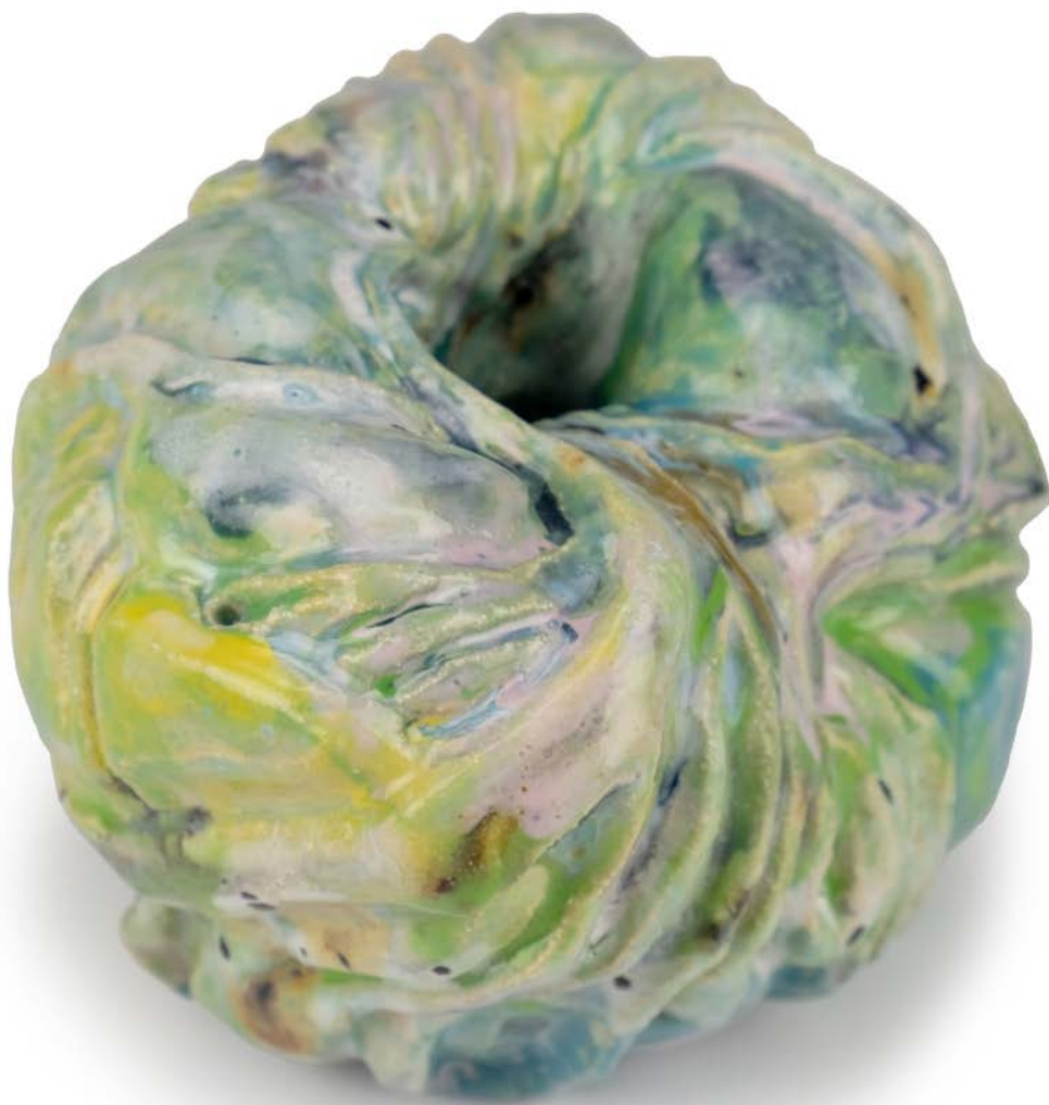
BOARIASI, 2022 ceramic 9,2 x 10,5 x 12,5 cm 3.6 x 4 x 4.9 inches