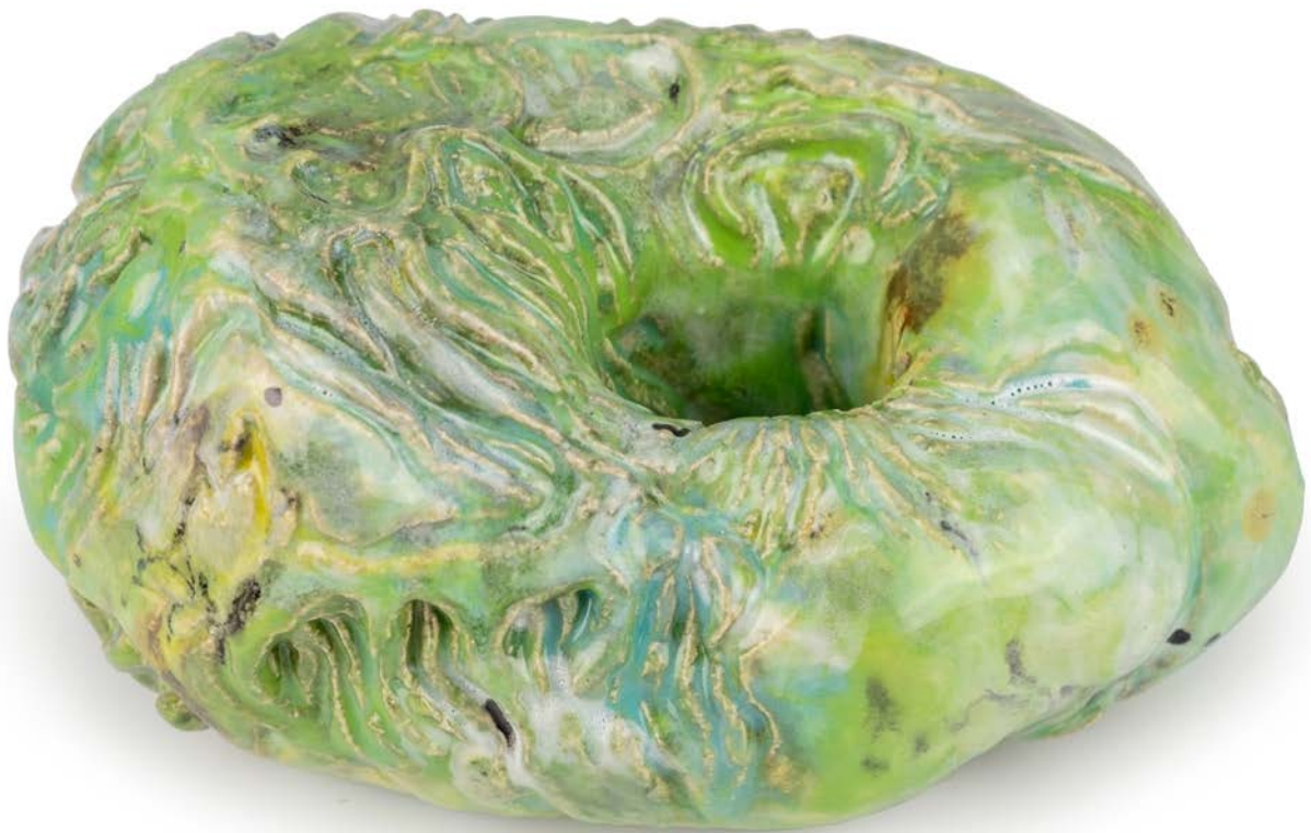
BOARILIA, 2022 ceramic 7,5 x 14,5 x 9,5 cm 3 x 5.7 x 3.7 inches