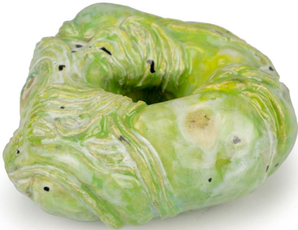
BOARILOS, 2022 ceramic 7 x 12,5 x 10,3 cm 2.7 x 4.9 x 4 inches