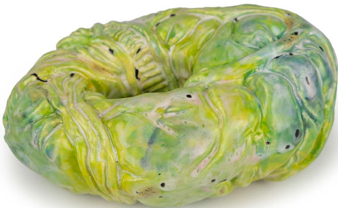
BOARIAS, 2022 ceramic 7,5 x 16,5 x 11 cm 3 x 6.5 x 4.3 inches