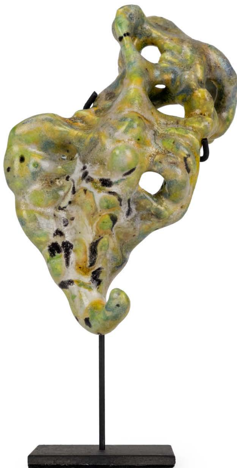
WIGNILOPS , 2020 - 2021 Ceramic 12,5 x 9 x 7 cm 4.9 x 3.5 x 2.7 inches