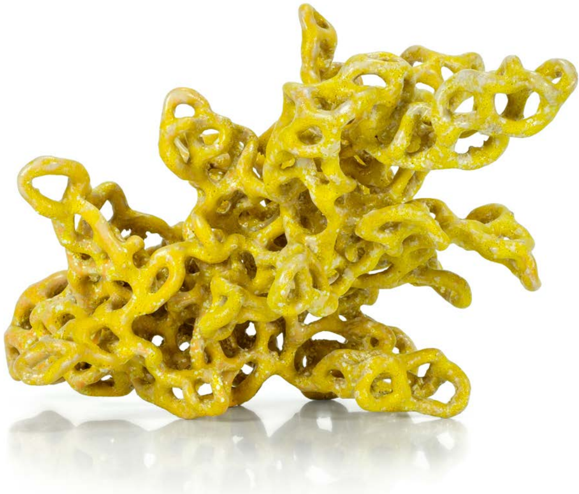
TIEWCEROM , 2017 - 2018 ceramic 22 x 24 x 37 cm 8.7 x 9.4 x 14.6 inches