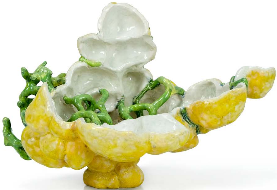
PLEZULNA , 2017 ceramic 23 x 23 x 26 cm 9.1 x 9.1 x 10.2 inches