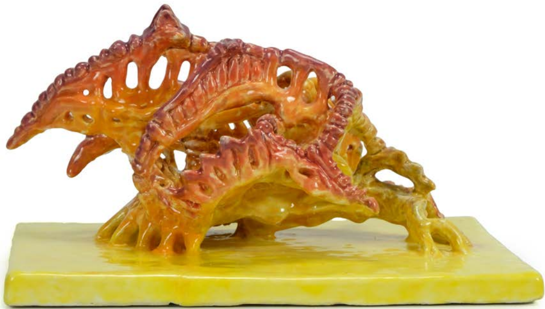
MINOTERCERAM, 2017 ceramic 17.5 x 24 x 11 cm 6.9 x 9.4 x 4.3 inches