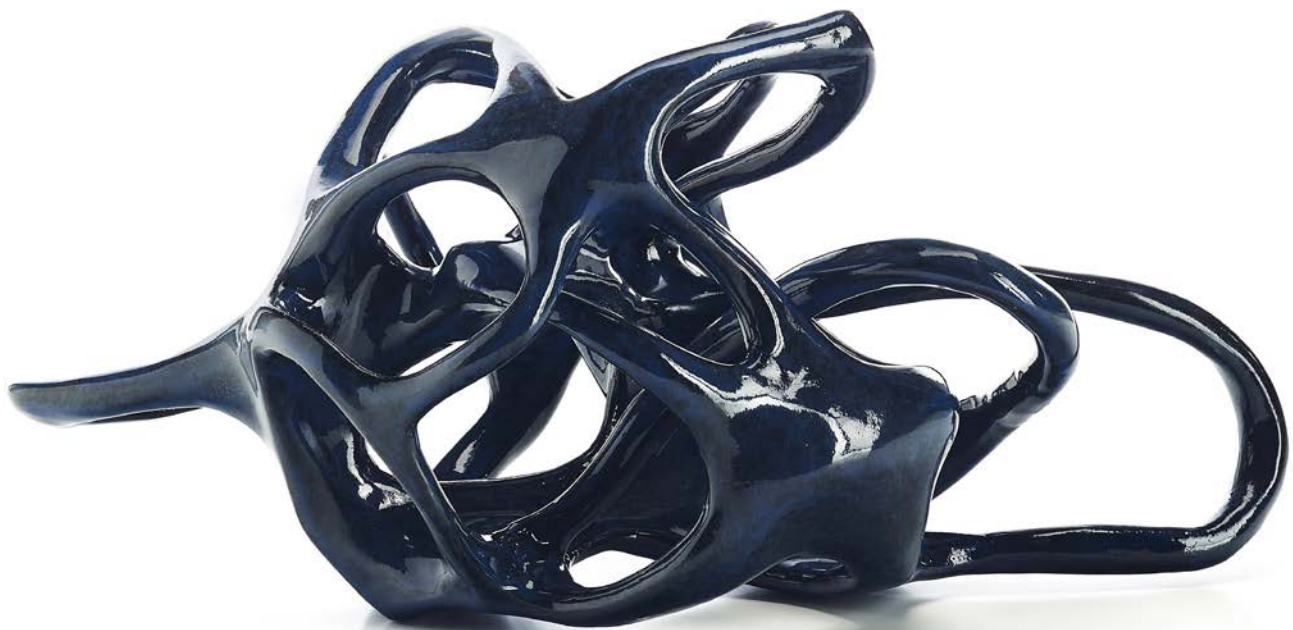
WINOCERICS , 2016 ceramic 17 x 37 x 21 cm 6,7 x 14,6 x 8,3 inches