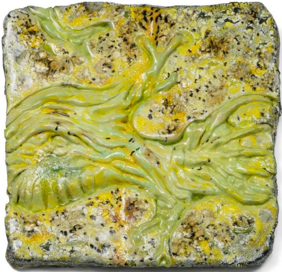
KINOVIZORA , 2018 ceramic 3 x 24 x 24 cm 1.2 x 9.4 x 9.4 inches