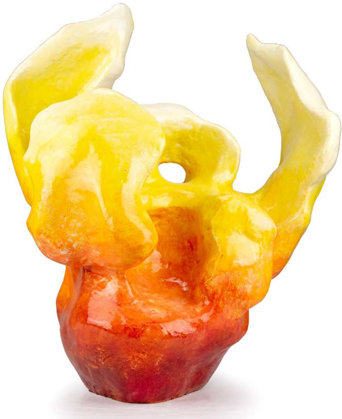
ELLEIBUOS, 2023 ceramic 60 x 50 x 35 cm 23.6 x 19.7 x 13.8 inches