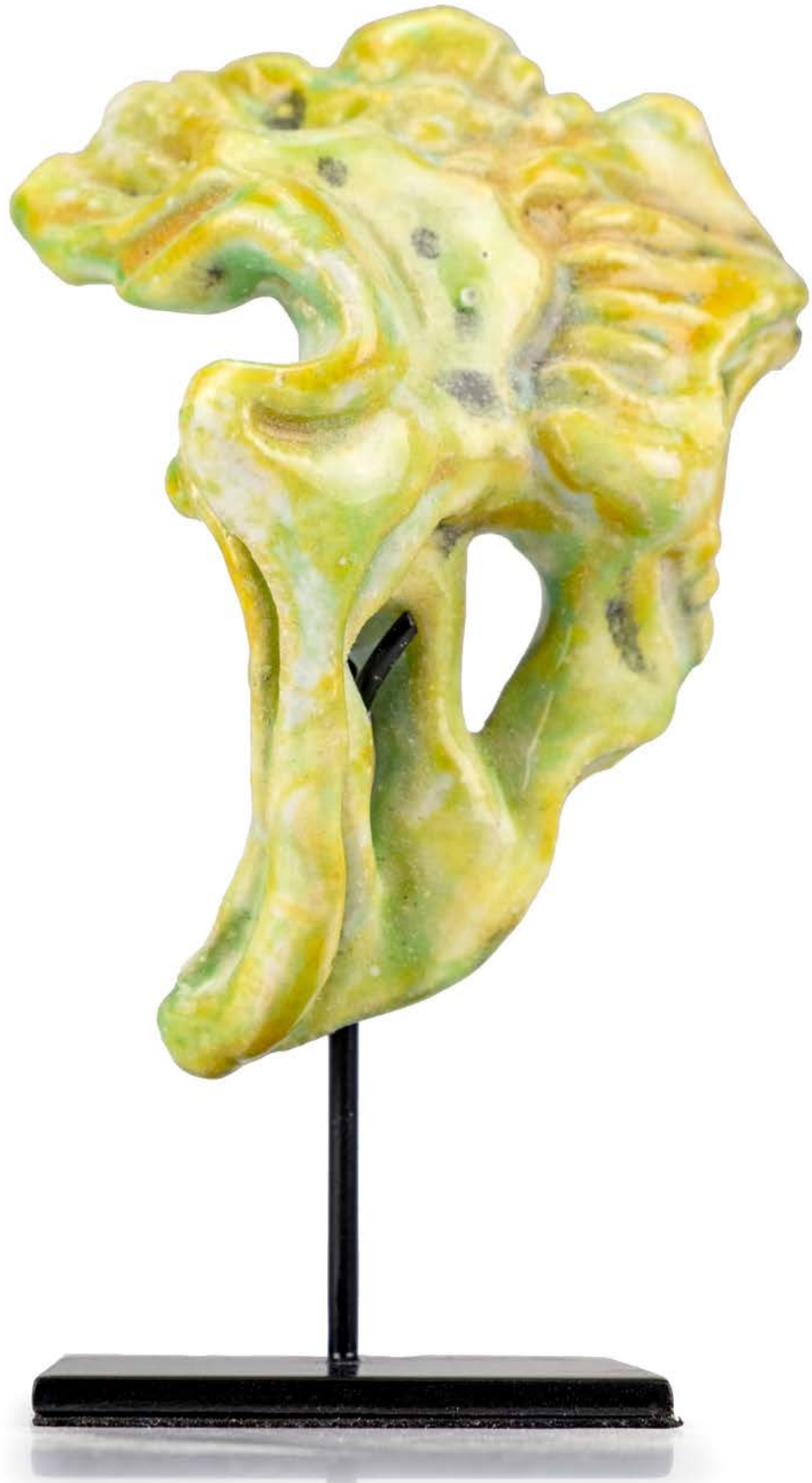
WIGNIROKA, 2022 ceramic 5 x 9.7 x 7 cm 2 x 3.8 x 2.7 inches