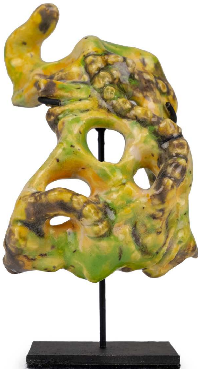
WIGNILUS , 2020 - 2021