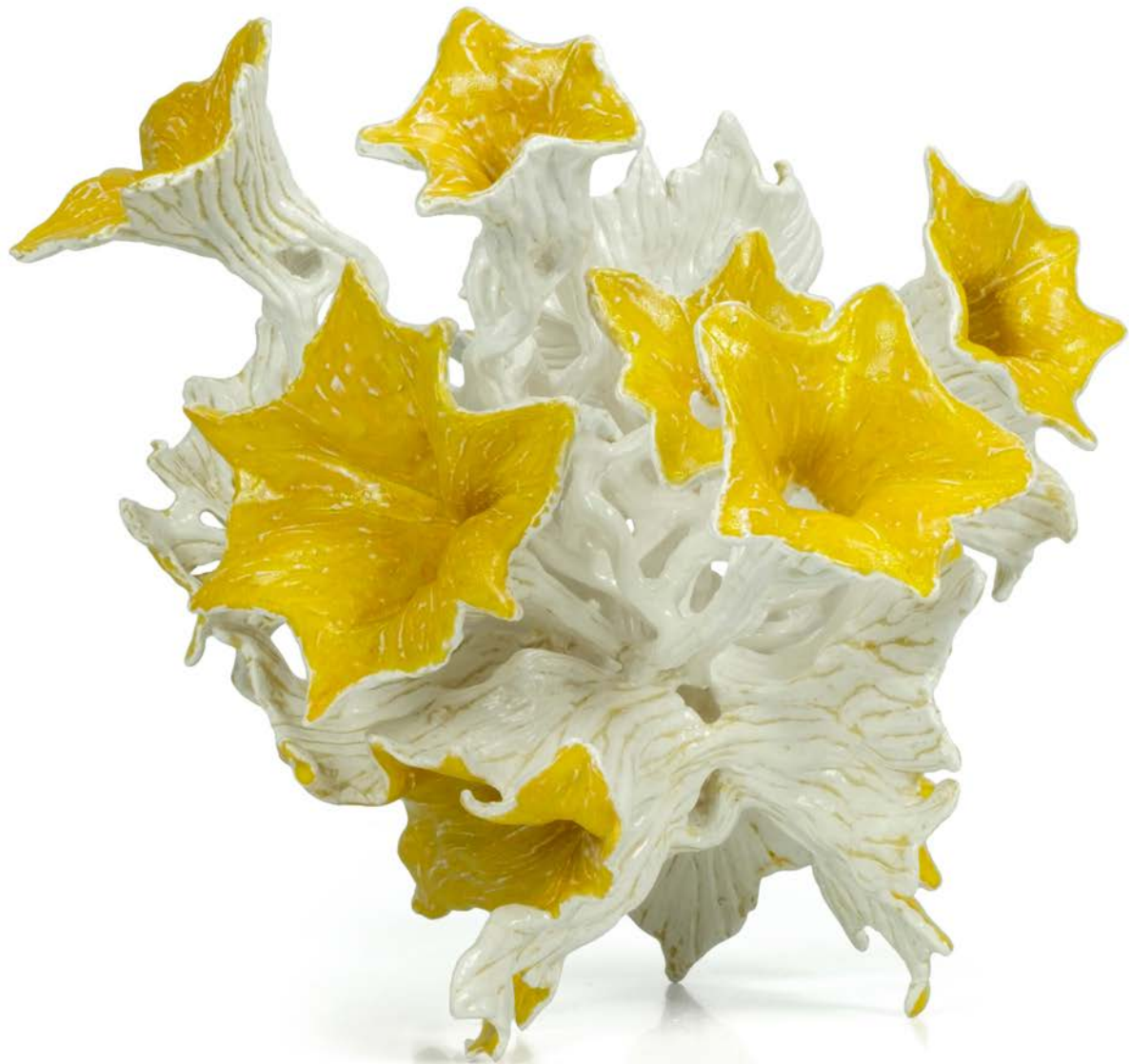
PETOEMBA , 2016 - 2018 ceramic 40 x 40 x 40 cm 15.7 x 15.7 x 15.7 inches