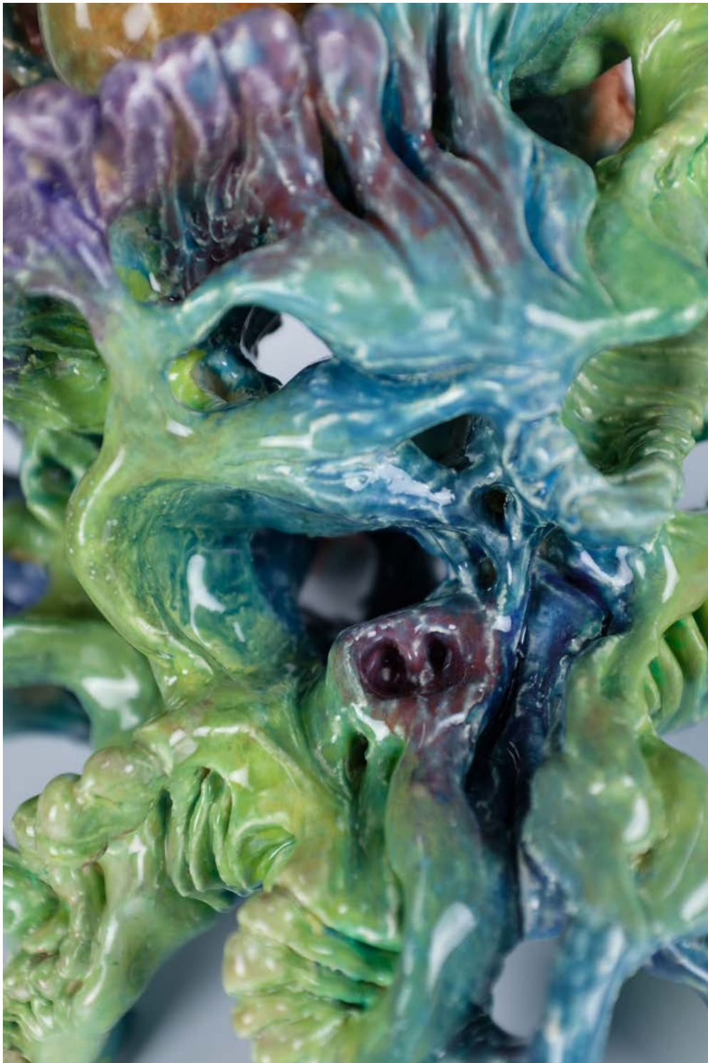
detail BRUNTUSCOLO , 2018 ceramic 46 x 37 x 37 cm 18.1 x 14.6 x 14.6 inches