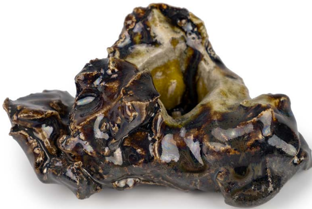
WIGNAREAS, 2022 ceramic 5 x 11,5 x 7,5 cm 2 x 4.3 x 3 inches