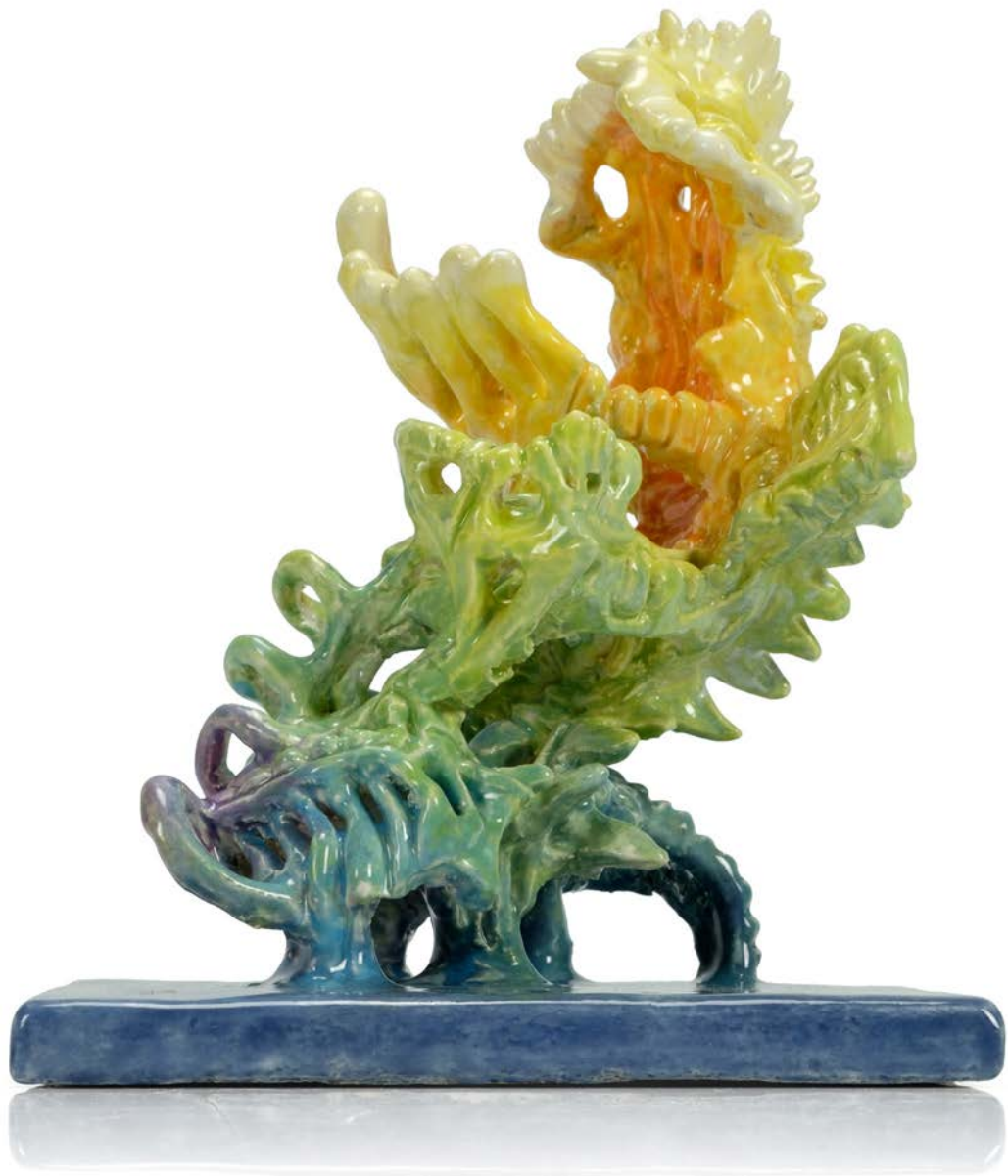
MINOTERKAM , 2017 ceramic 19 x 16.5 x 13 cm 7.5 x 6.5 x 5.1 inches