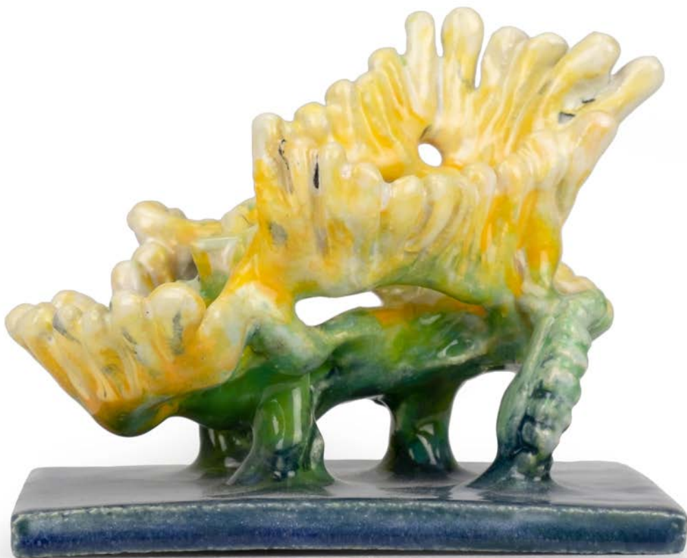
MINOTERSUMI, 2022 ceramic 11 x 12,8 x 10,5 cm 4.3 x 5 x 4 inches