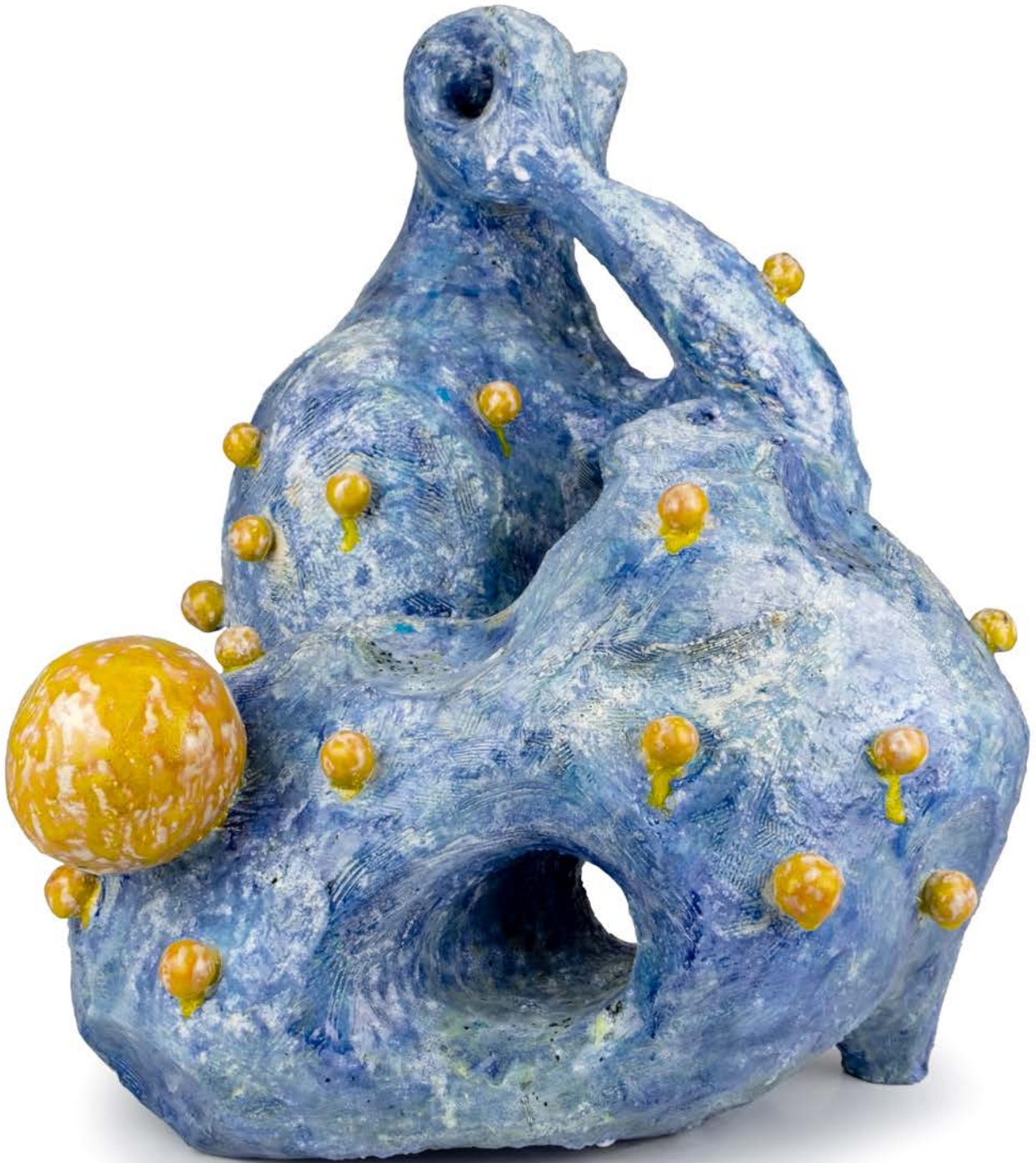
CROBIESLU , 2023 ceramic 57,5 x 47,5 x 40,5 cm 22.6 x 18.7 x 16 inches