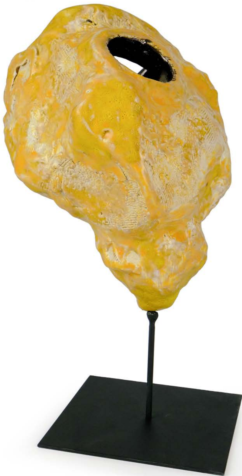
ENOOREMAOS , 2020 - 2021 Ceramic 26,5 x 21,5 x 20 cm 10.4 x 8.5 x 7.9 inches