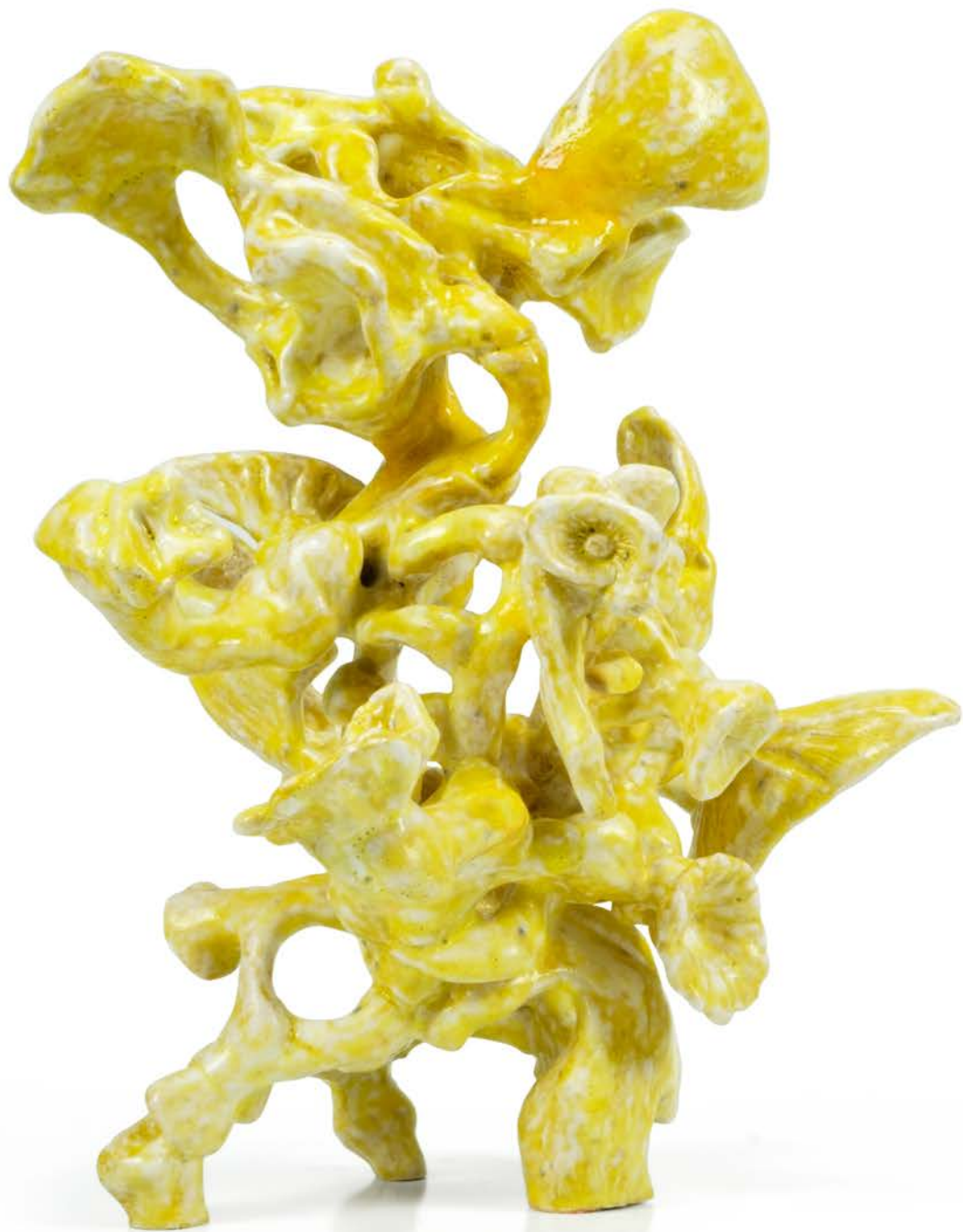
MAOBTID , 2016 - 2018 ceramic 29 x 20 x 32 cm 11.4 x 7.9 x 12.6 inches