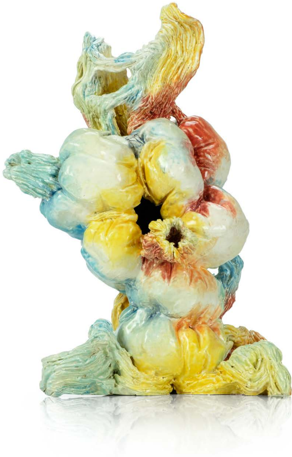
AKRIMUTO, 2017 - 2018 ceramic 30 x 18 x 20 cm 11.8 x 7.1 x 7.9 inches