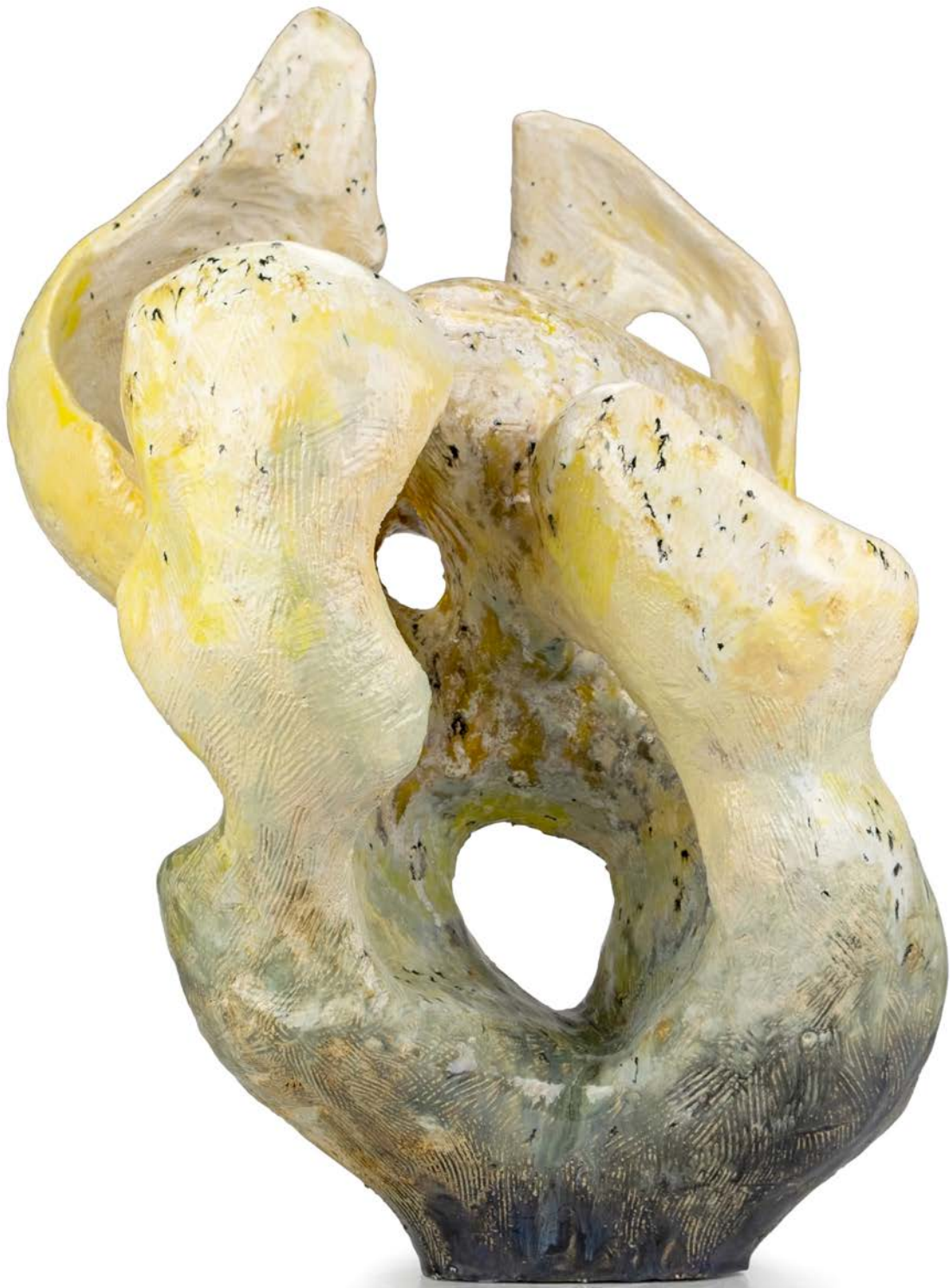
ELLEIBIO, 2023 ceramic 57 x 37,5 x 39,5 cm 22.4 x 14.8 x 15.5 inches