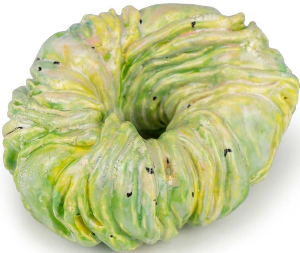
BOARIASU, 2022 ceramic 7 x 13 x 11 cm 2.7 x 5.1 x 4.3 inches